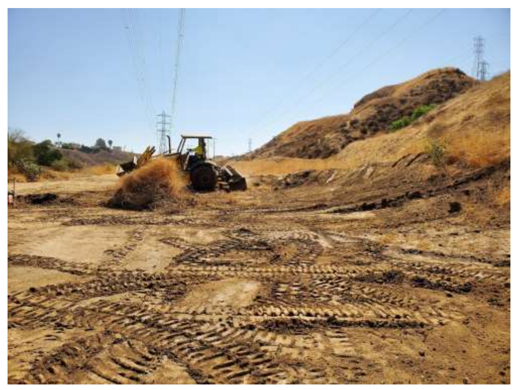
Photo 1 – Site restoration activities at Construction Area 2N26, Segment 2 (August 31, 2020).