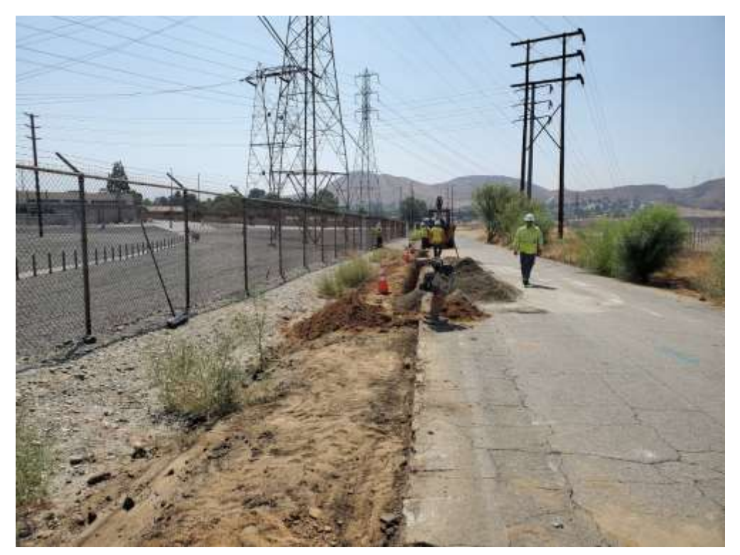
Photo 2 – Trenching activities at Construction Areas 2N36 through 2N38 (TWA-2-VistaSub-MPR-37), Segment 2 (September 1, 2020).