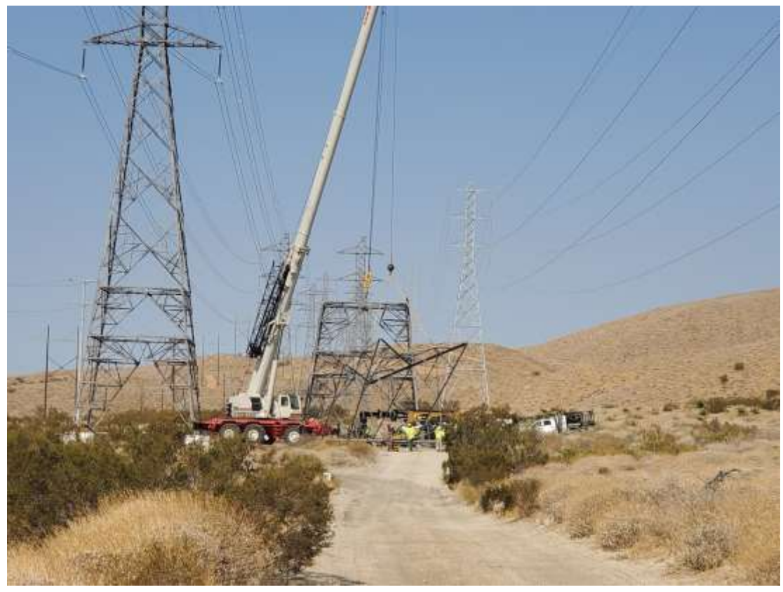
Photo 5 – Tower assembly at Construction Area 5X05, Segment 5 (September 2, 2020).