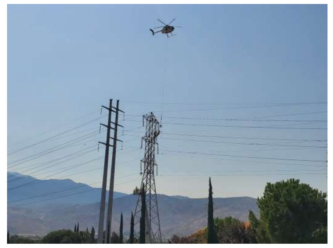
Photo 4 – Wire wreck-out activities at Construction Area 4X03, Segment 4 (September 2, 2020).