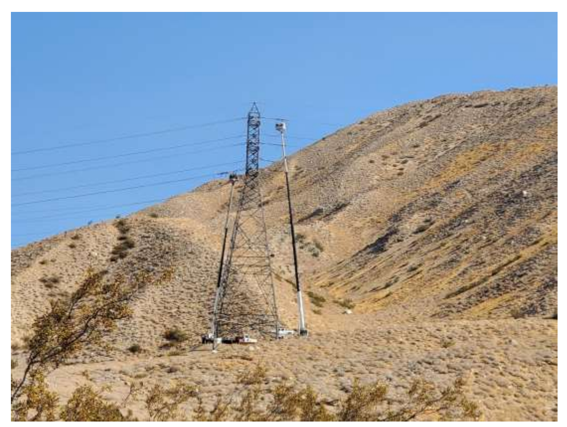
Photo 6 – Wire stringing activities at Construction Area 6N31, Segment 6 (September 1, 2020).