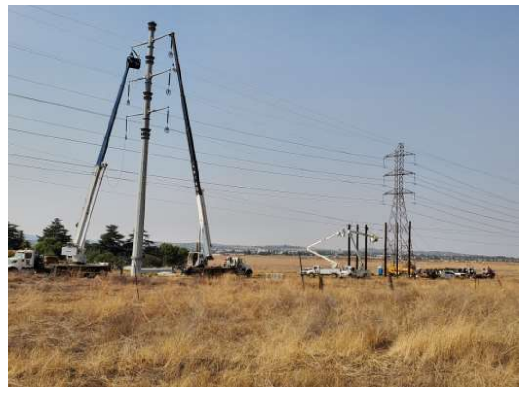
Photo 3 – Wire wreck-out activities at Construction Area WSS-4X15-4X16, Segment 4 (September 14, 2020).