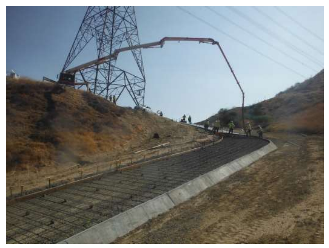
Photo 2 – Concrete pour at Construction Area 2N18, Segment 2 (September 18, 2020) (Photo courtesy of SCE).