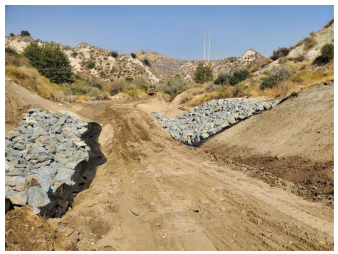
Photo 4 – Grading at wet crossing on access road to Construction Area 4X04, Segment 4 (September 16, 2020).