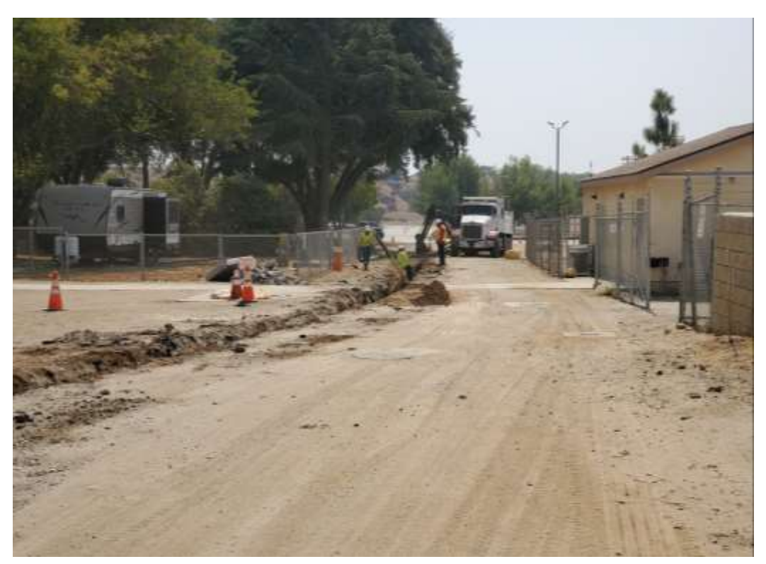
Photo 1 – Conduit installation at Construction Area TWA-4S35X-1, Segment 4 (September 16, 2020).