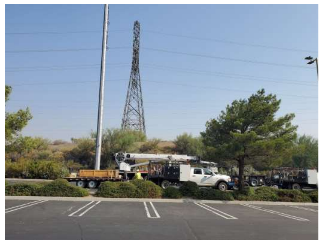
Photo 5 – Wire wreck-out activities at Construction Area 4175195E, Segment 5 (September 16, 2020).