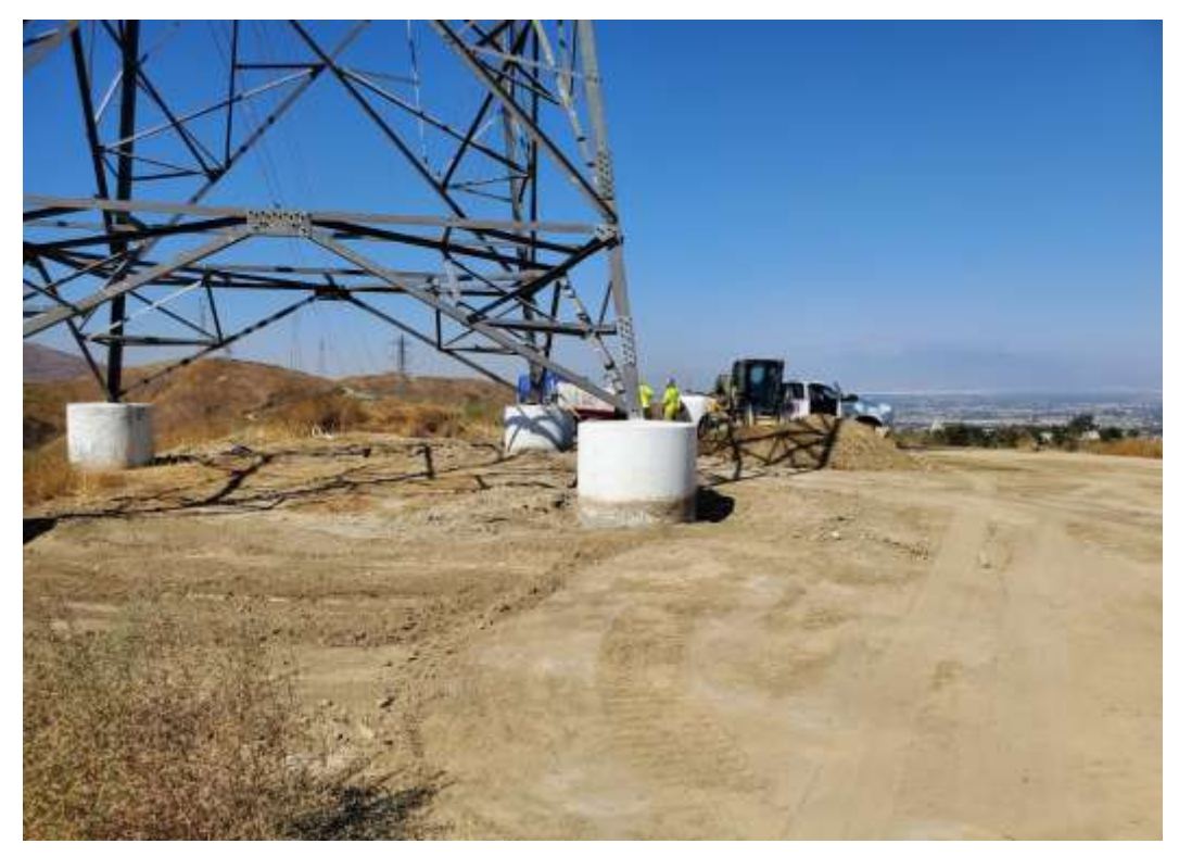
Photo 1 – Site restoration activities at Construction Area 2N08, Segment 2 (September 30, 2020).