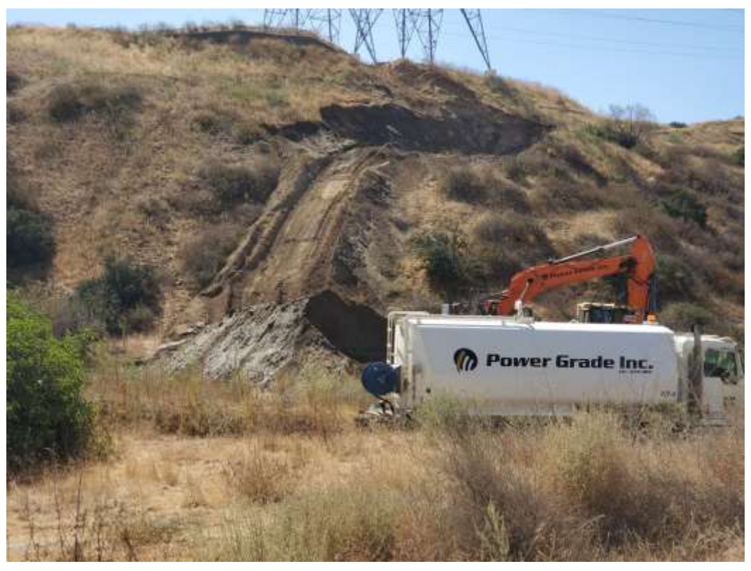
Photo 2 – Erosion repair activities at Construction Area 3X64, Segment 3 (September 29, 2020).