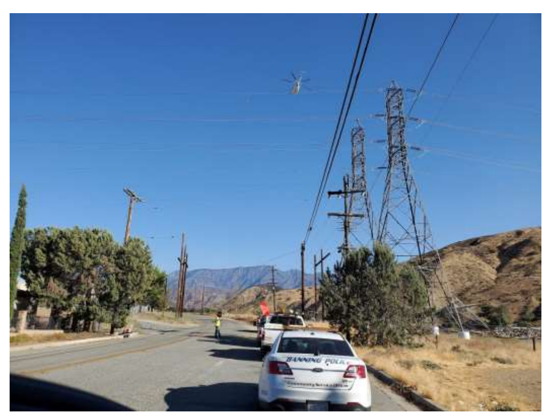
Photo 5 – Wire stringing activities with traffic control at Construction Area 4X01, Segment 4 (September 30, 2020).