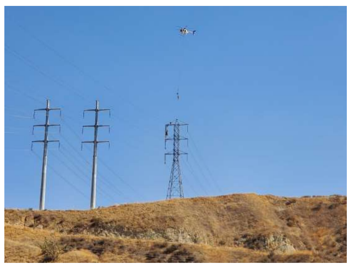
Photo 3 – Wire wreck-out activities at Construction Area 3X46, Segment 3 (September 30, 2020).