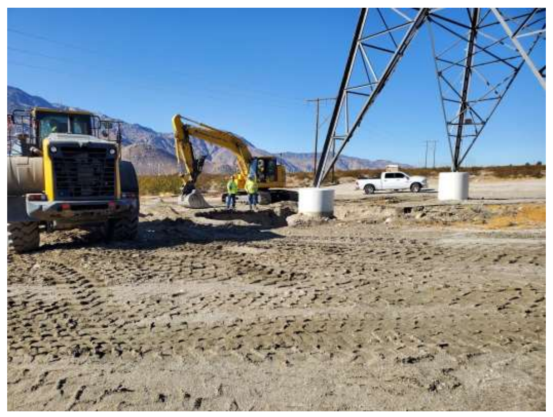
Photo 5 – Scour prevention activities at Construction Area 6X41, Segment 6 (November 4, 2020).