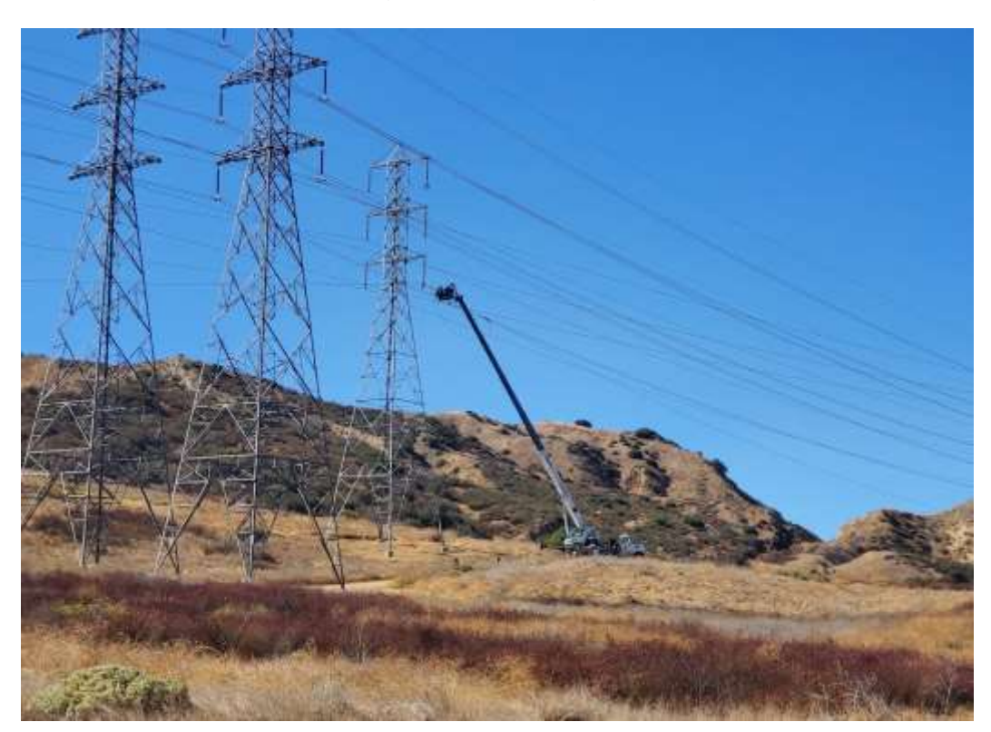
Photo 2 – Wire wreck-out activities at Construction Area 3X14, Segment 3 (November 2, 2020).