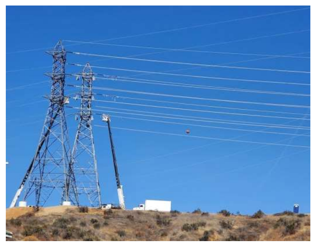
Photo 4 – Wire stringing activities at Construction Area 4X56, Segment 4 (November 2, 2020).