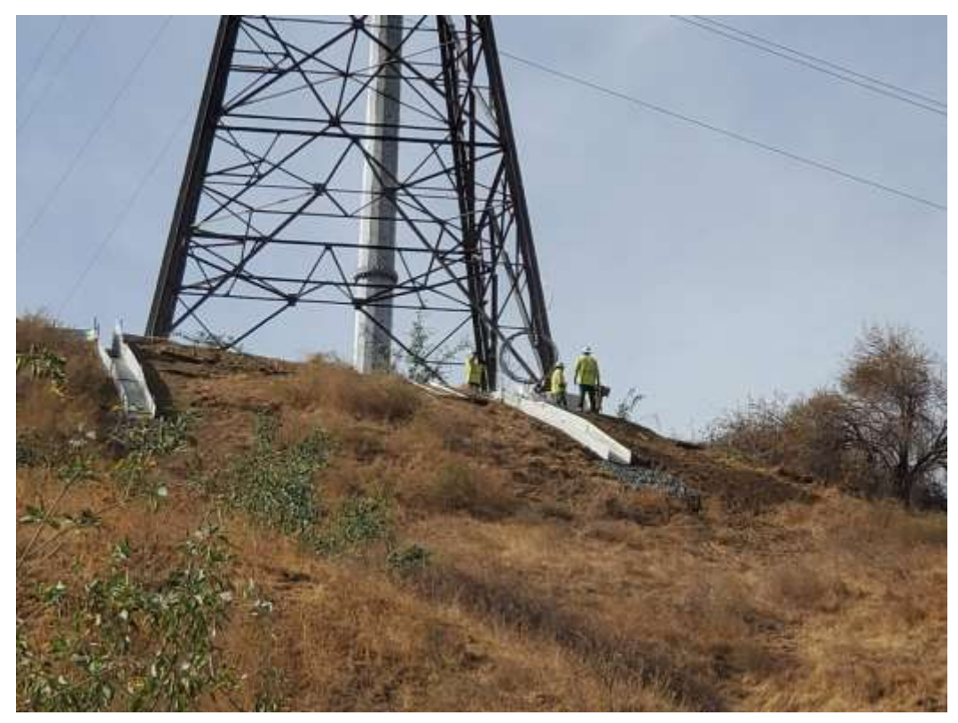
Photo 3 – MAC drain installation at Construction Area 3X65, Segment 3 (November 3, 2020).