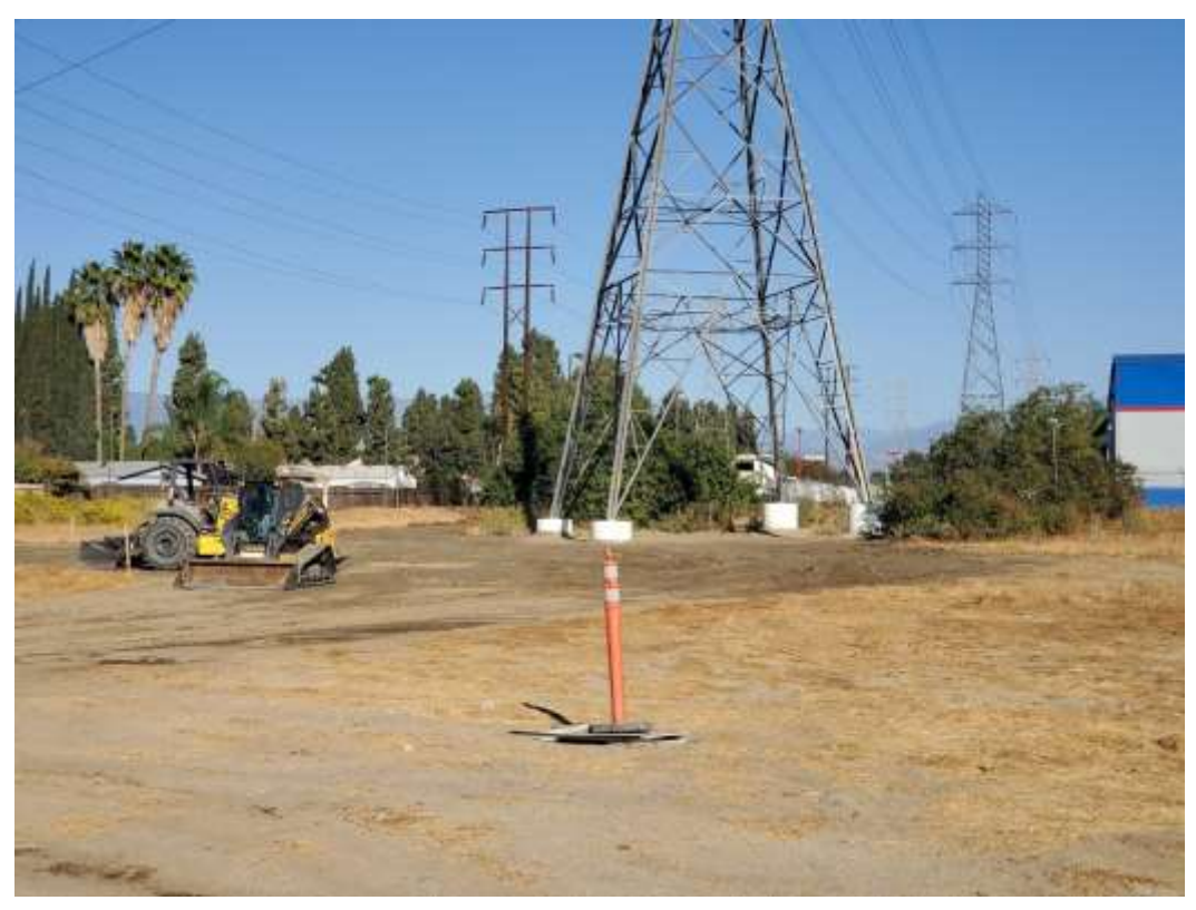
Photo 1 – Site restoration activities at Construction Area 2N35, Segment 2 (November 4, 2020).