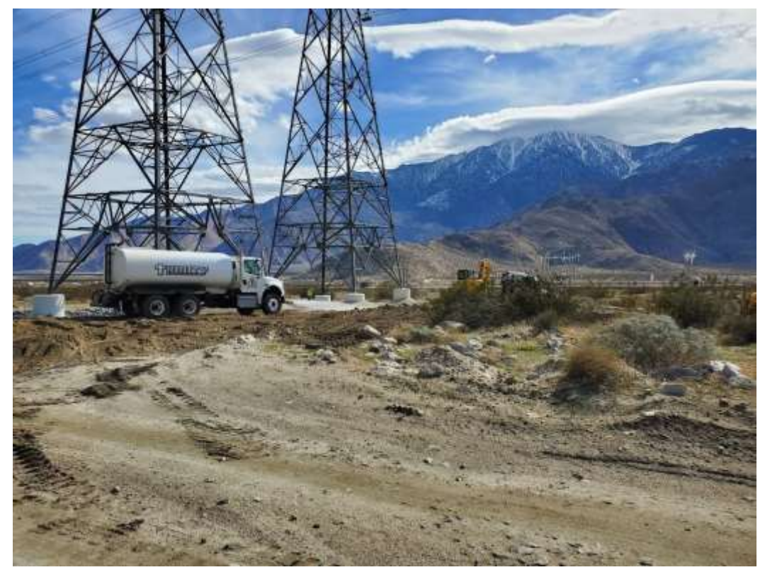
Photo 6 – Site restoration activities at Construction Area 6X44, Segment 6 (February 2, 2021).