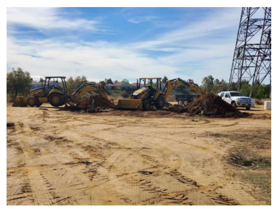
Photo 4 – Foundation wreck-out activities at Construction Area 4X39, Segment 4 (February 2, 2021).