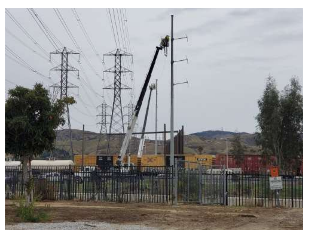
Photo 1 – Shoofly wire wreck-out activities at Construction Areas 1X10 through 1X11 (SF110 through SF111), Segment 1 (February 1, 2021).