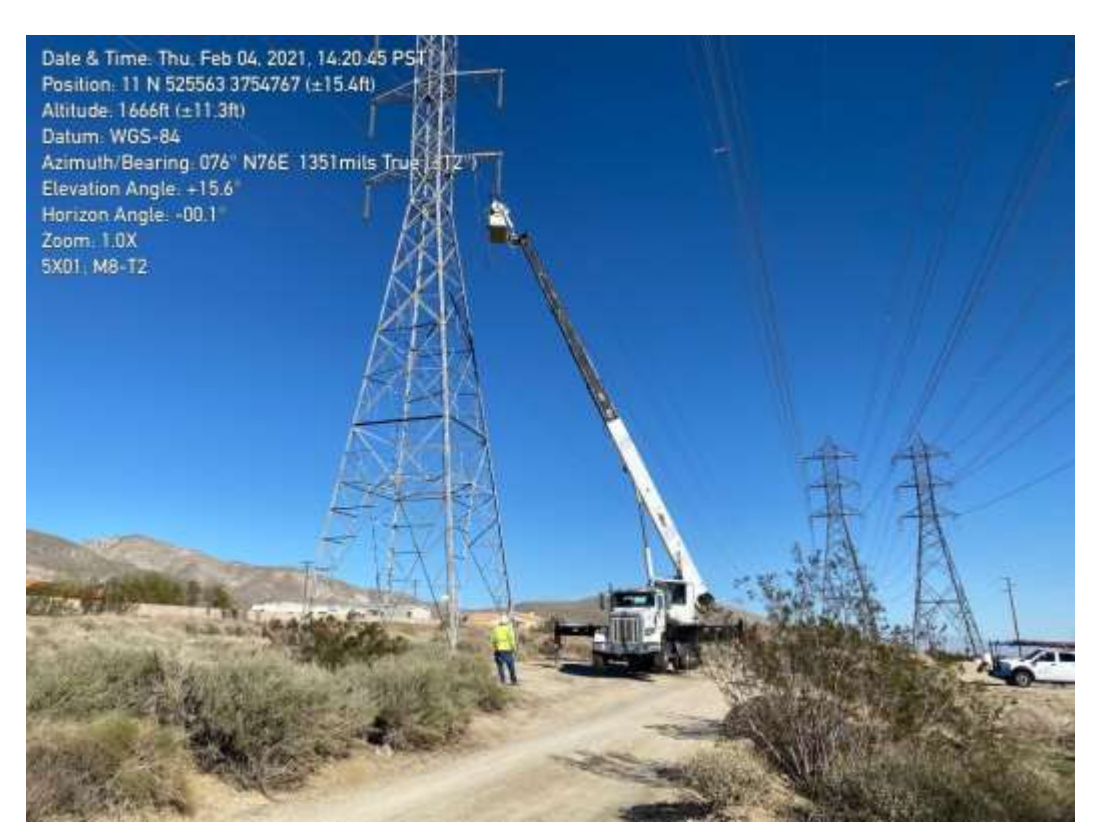
Photo 5 – Wire wreck-out activities at Construction Area 5X01, Segment 5 (February 4, 2021).