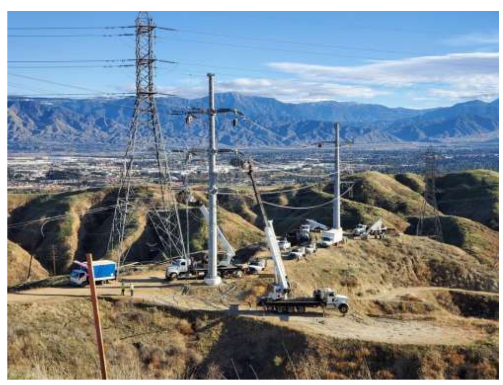
Photo 2 – Wire stringing activities at Construction Areas 1W01 through 1W02, Segment 1 (February 2, 2021).