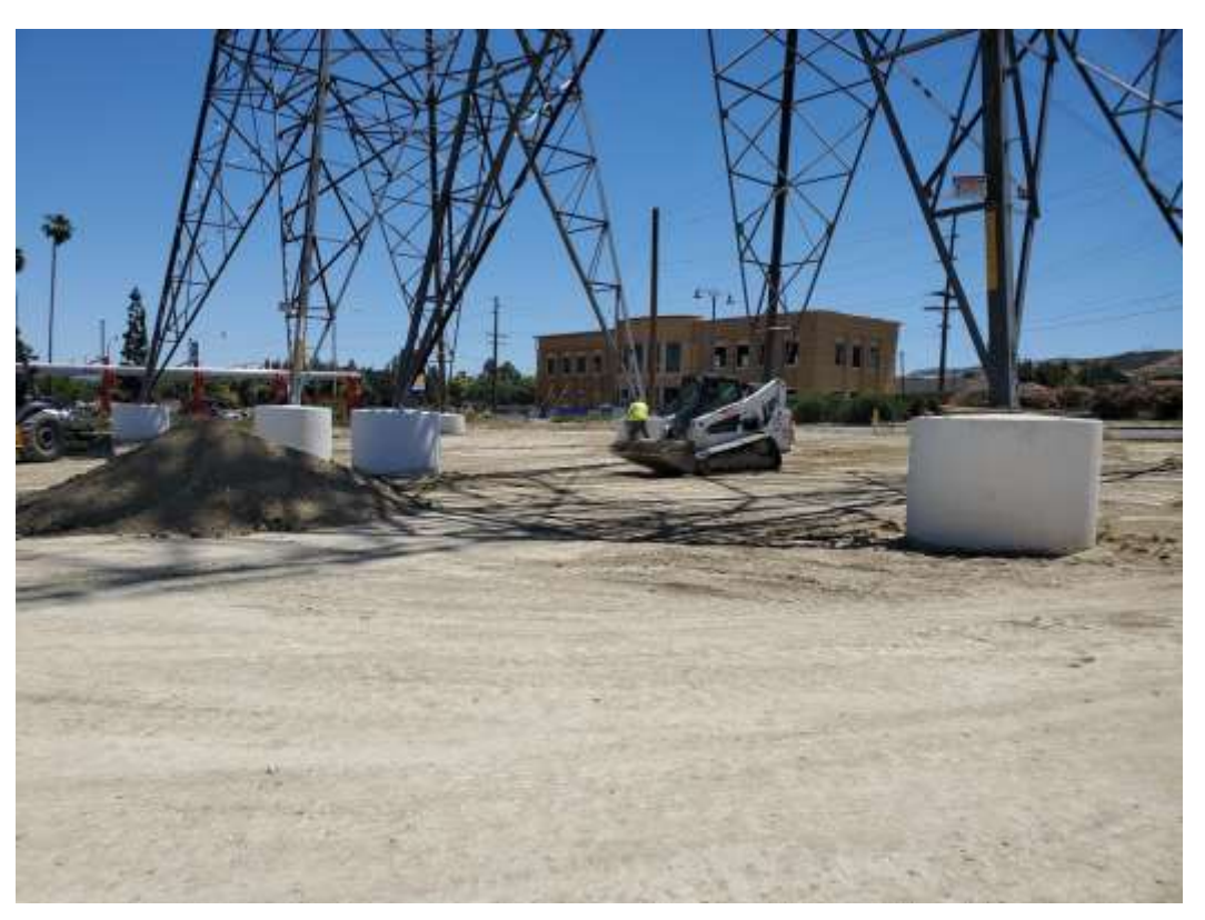
Photo 3 – Site restoration and foundation compaction at Construction Area 1X10, Segment 1 (April 29, 2021).