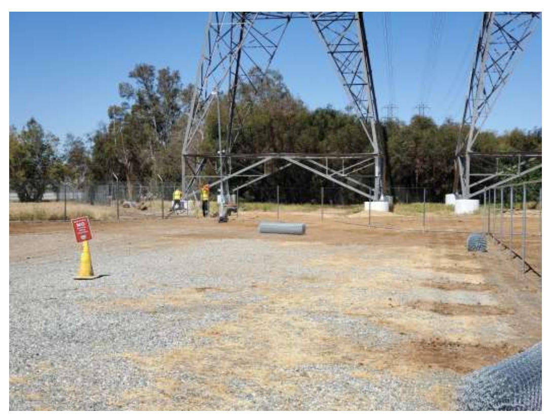
Photo 7 – Fence installation at Construction Area 4X44 (within approved vertical nest buffer reduction), Segment 4 (April 28, 2021).