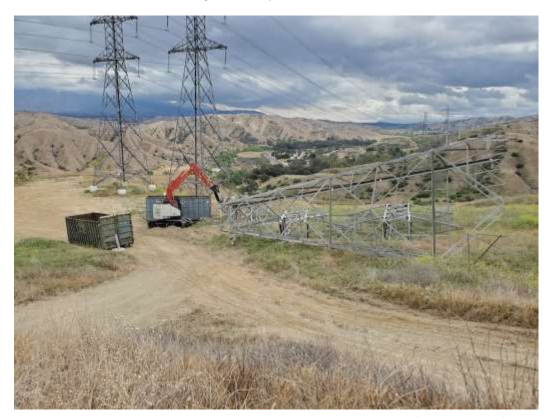
Photo 4 – Tower shearing at Construction Area 3X38, Segment 3 (April 26, 2021).