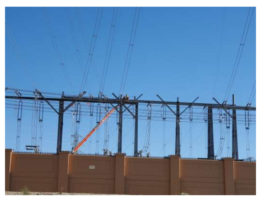
Photo 1 – Support welding at the Devers Substation (April 30, 2021).