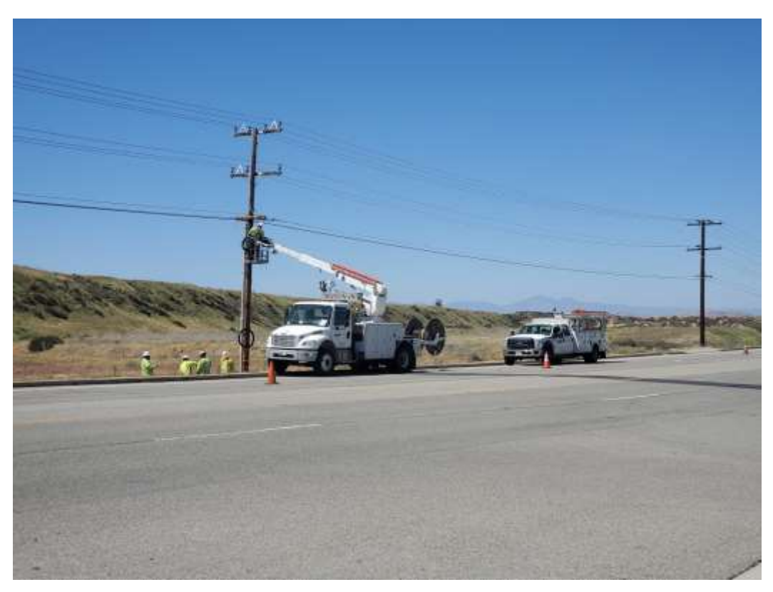
Photo 6 – Fiber optic installation at Construction Area SWA-OakValleyParkwayTelecom-MPR-46, Segment 4 (April 30, 2021).