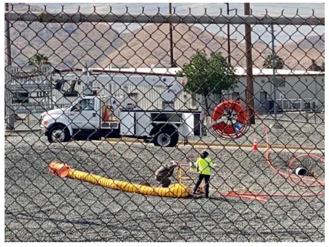
Photo 2 – Fiber optic installation at the Vista Substation (April 27, 2021) (Photo courtesy of SCE).