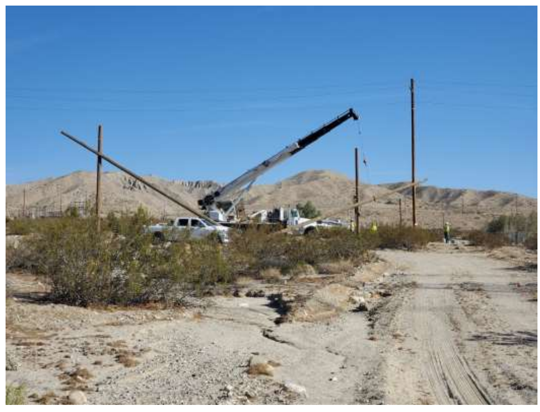
Photo 8 – Guard pole removal at Construction Area GS-6N20-6N21-1, Segment 6 (April 30, 2021).