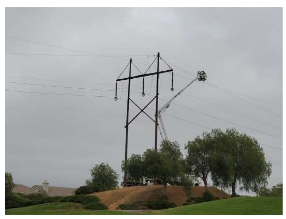
Photo 2 – Wire wreck-out activities at Construction Area PP#123307, Segment 4 (May 20, 2021).