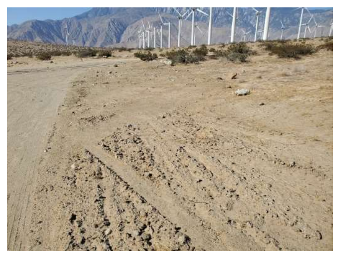
Photo 7 – Hydroseeded area at Construction Area 6X24, Segment 6 (May 21, 2021).