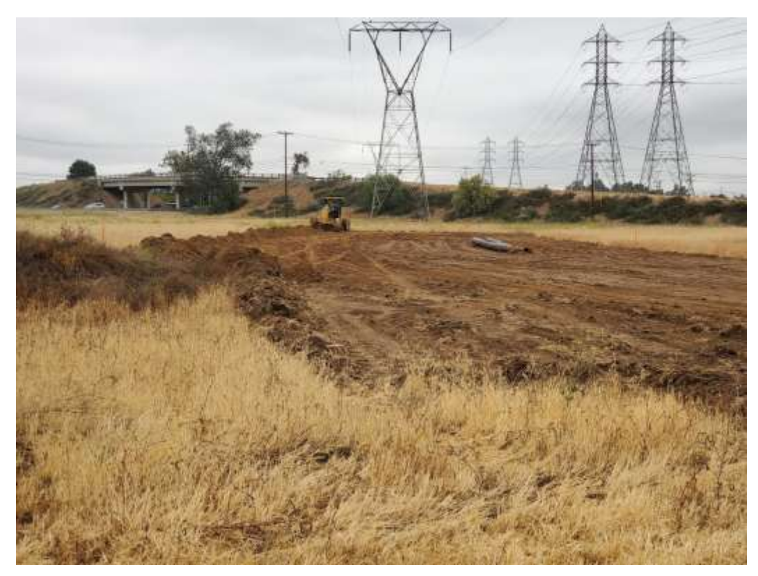
Photo 4 – Vegetation clearing and grading at Construction Area WSS-4X45-4X46, Segment 4 (May 17, 2021).