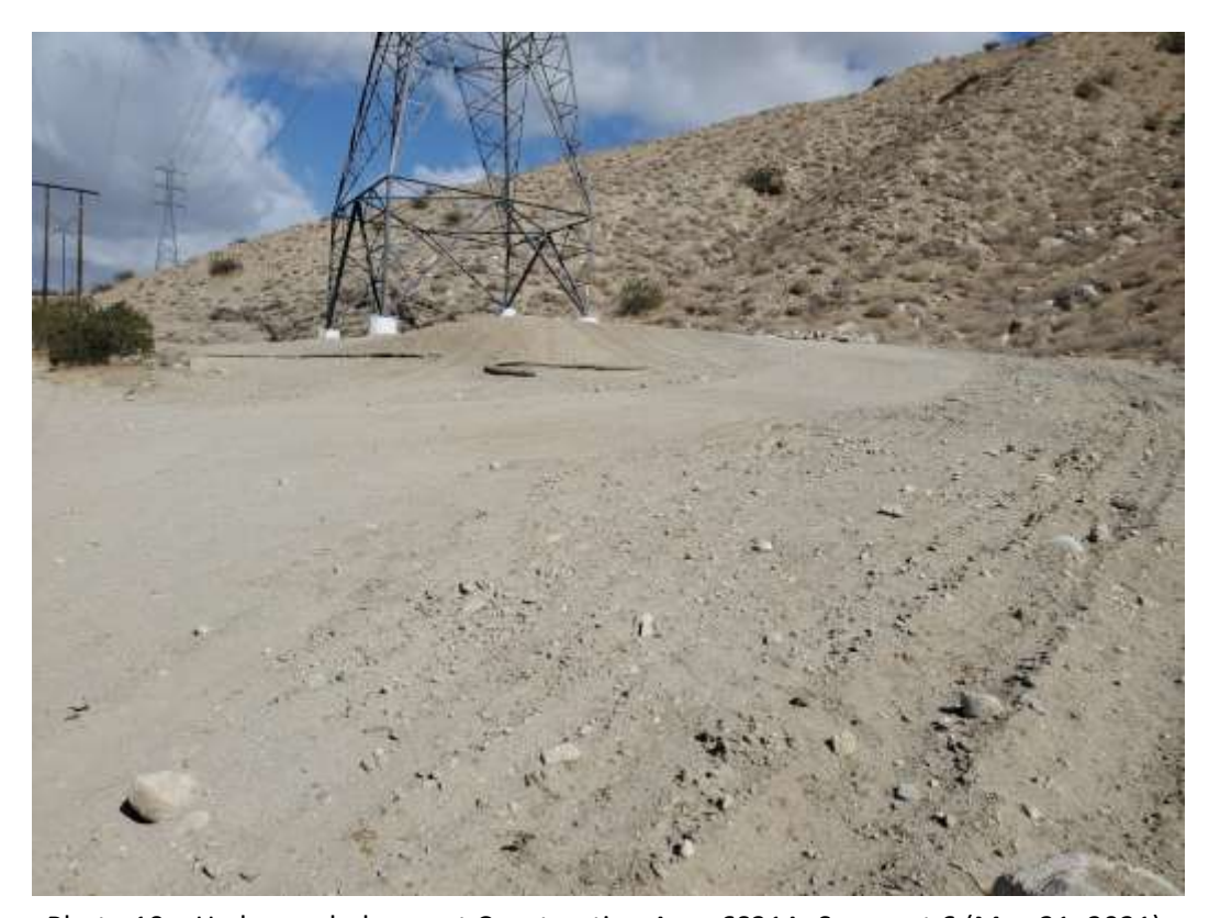
Photo 10 – Hydroseeded area at Construction Area 6S31A, Segment 6 (May 21, 2021).