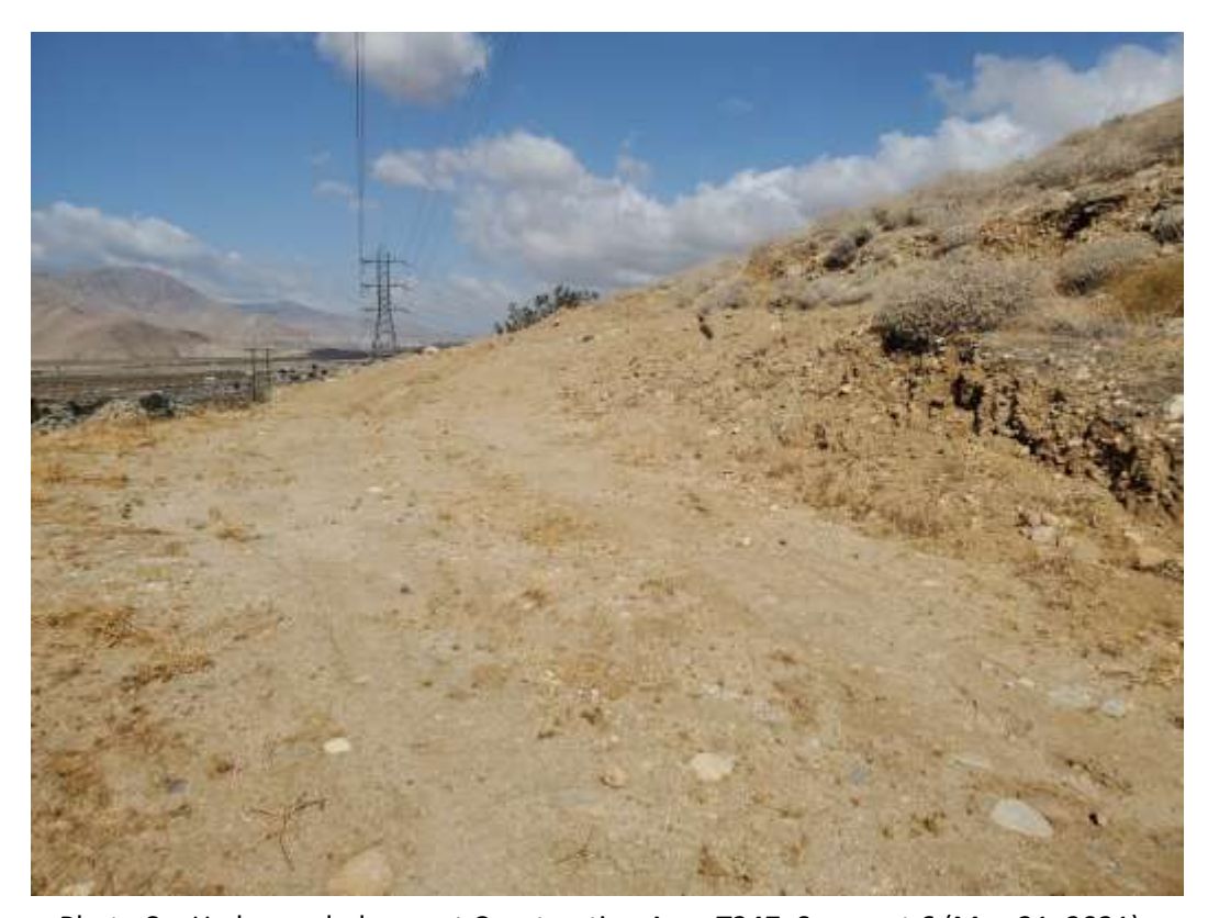
Photo 8 – Hydroseeded area at Construction Area T247, Segment 6 (May 21, 2021).