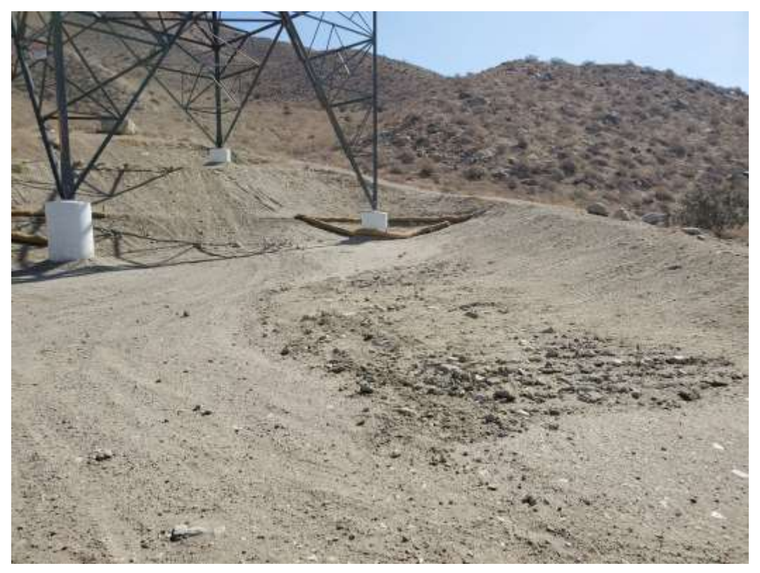
Photo 9 – Hydroseeded area at Construction Area 6S31, Segment 6 (May 21, 2021).