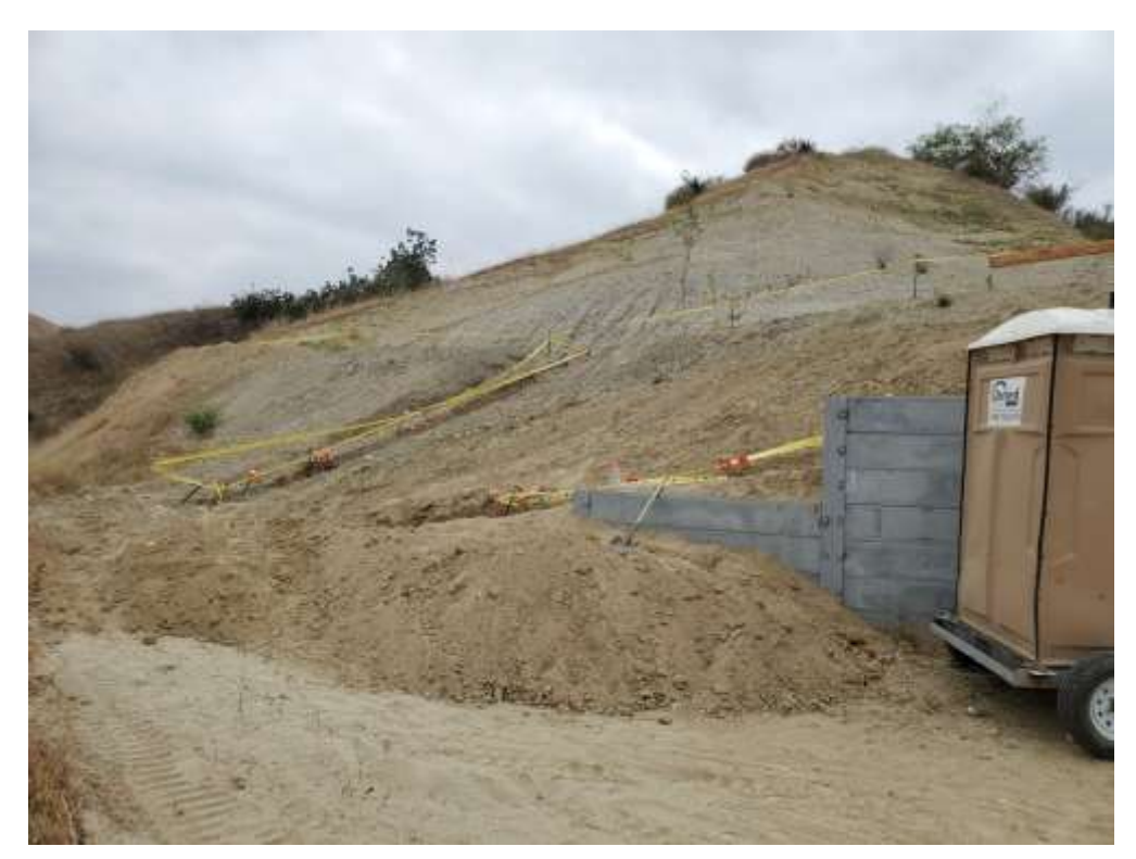
Photo 1 – V-ditch excavation at Construction Area 3X36, Segment 3 (May 17, 2021).