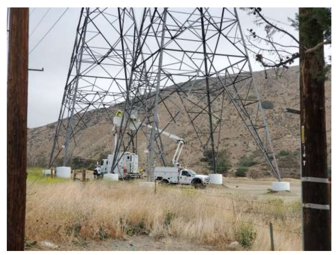
Photo 3 – Fiber splicing activities at Construction Area 4X01, Segment 4 (May 20, 2021).