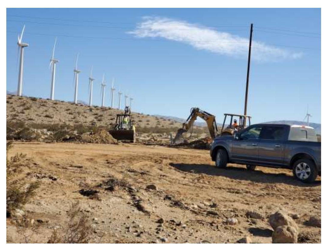
Photo 5 – Foundation wreck-out at Construction Area M0-T5(1), Segment 6 (May 20, 2021).