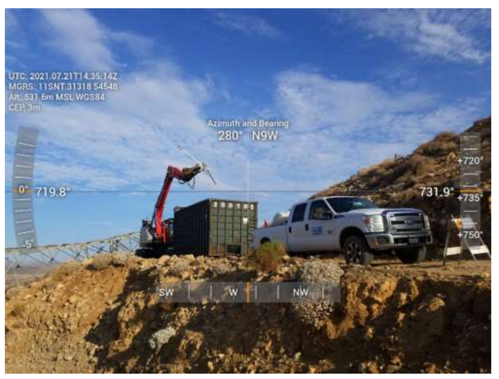
Photo 6 – Tower shearing at Construction Area 6N31, Segment 6 (July 21, 2021) (Photo courtesy of SCE).