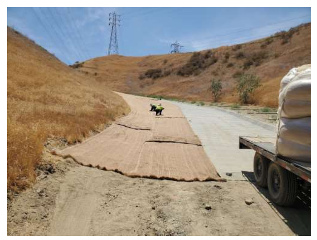
Photo 1 – BMP installation at Construction Area 2N18, Segment 2 (July 21, 2021).