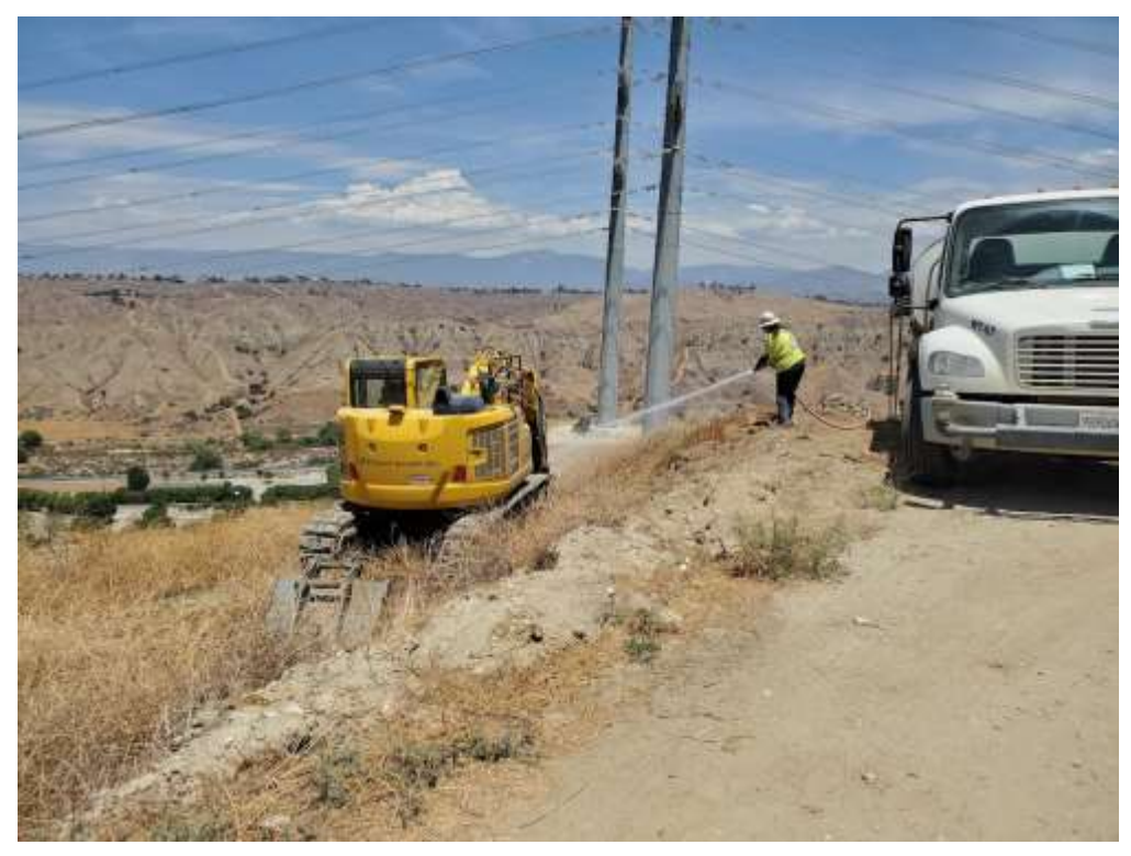
Photo 2 – Foundation wreck-out at Construction Area 3X35, Segment 3 (July 21, 2021).