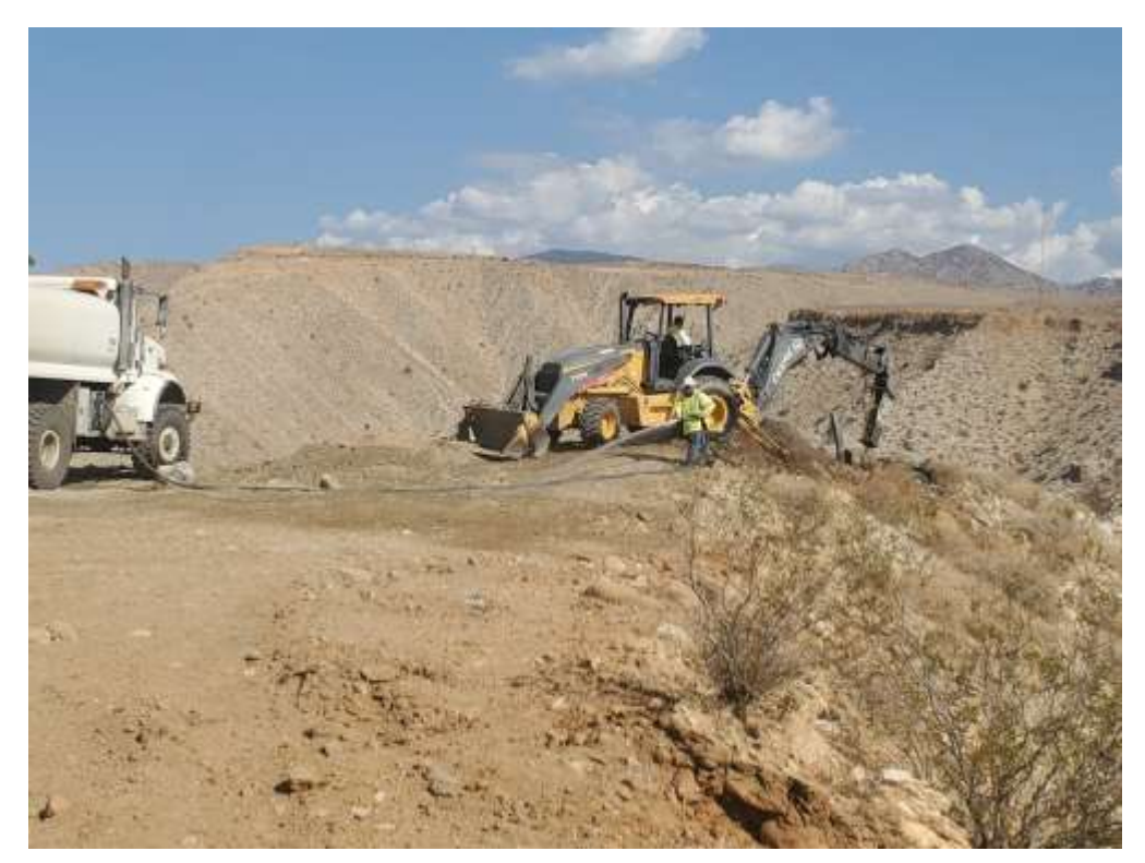
Photo 5 – Foundation wreck-out at Construction Area 6N28, Segment 6 (July 19, 2021).