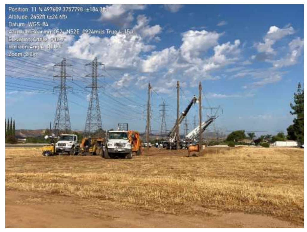
Photo 3 – Wire wreck-out activities at Construction Area WSS-4X45-4X46, Segment 4 (July 19, 2021) (Photo courtesy of SCE).