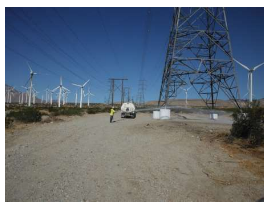
Photo 6 – Hydroseed watering at Construction Area 6X22, Segment 6 (August 2, 2021).