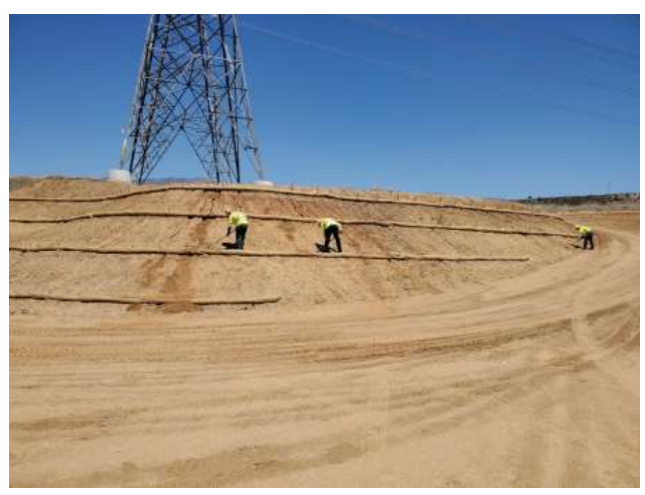
Photo 4 – BMP maintenance at Construction Area 4X06, Segment 4 (August 2, 2021).