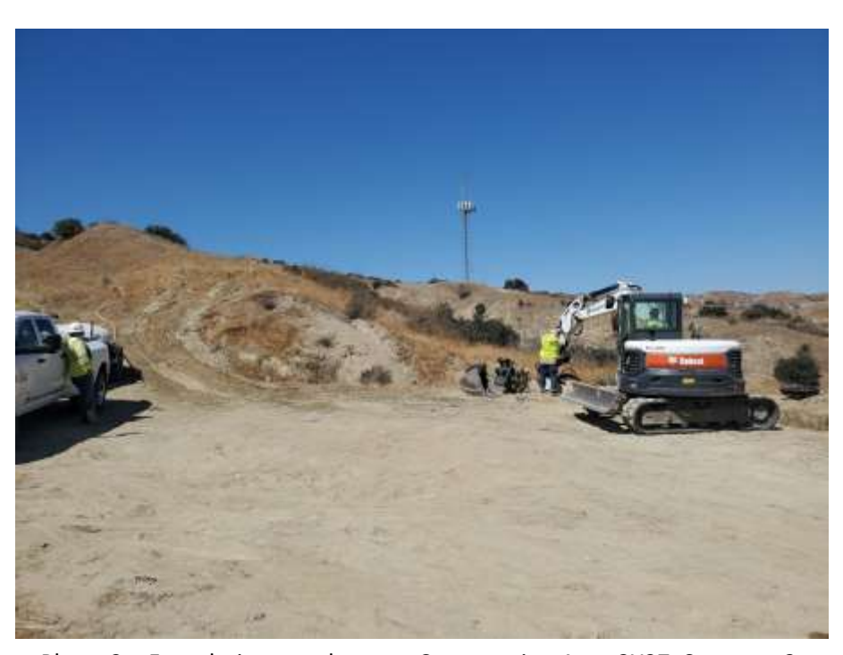
Photo 2 – Foundation wreck-out at Construction Area 3X27, Segment 3 (August 2, 2021).