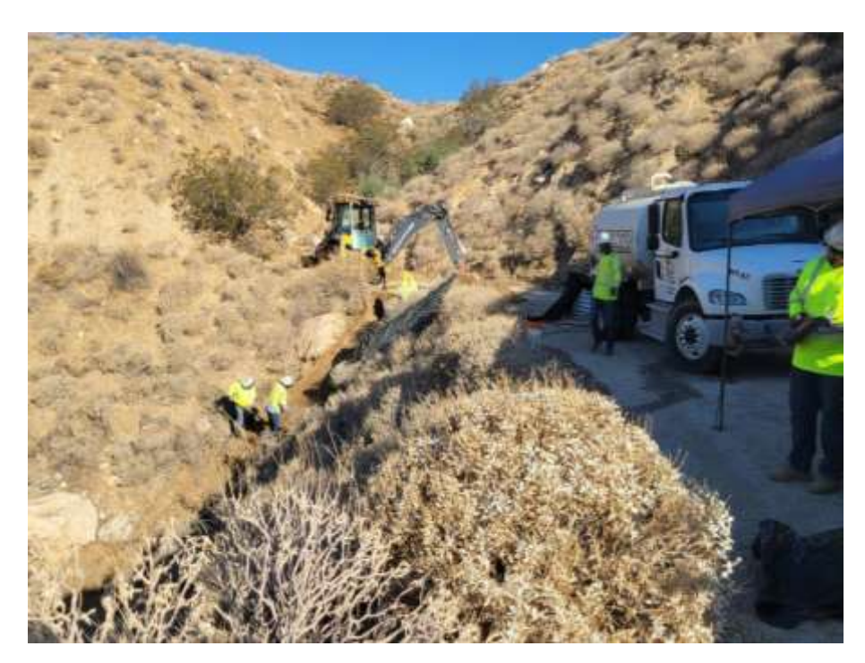
Photo 5 – MAC drain installation at Construction Area 5X14, Segment 5 (August 3, 2021) (Photo courtesy of SCE).