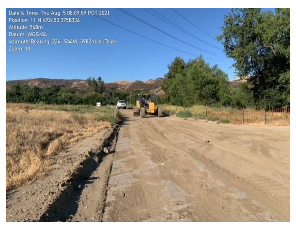
Photo 3 – Access road maintenance near Construction Area 4S60, Segment 4 (August 5, 2021) (Photo courtesy of SCE).