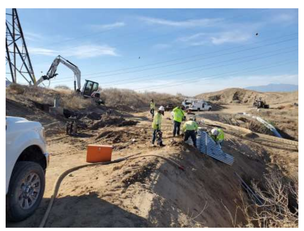
Photo 2 – MAC drain installation and foundation removal at Construction Area 2N12, Segment 2 (November 15, 2021).