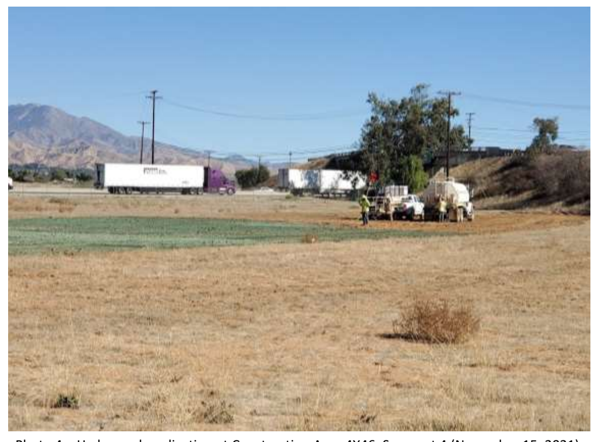
Photo 4 – Hydroseed application at Construction Area 4X46, Segment 4 (November 15, 2021).