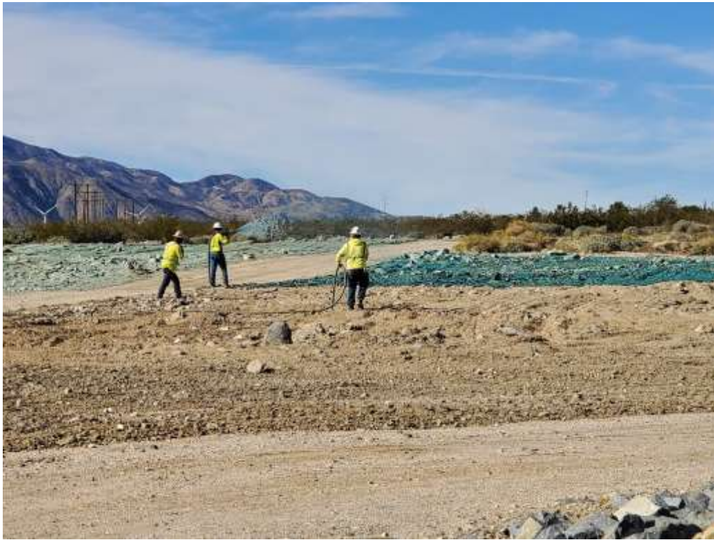
Photo 5 – Hydroseed application at Construction Area 6X42, Segment 6 (January 26, 2022).