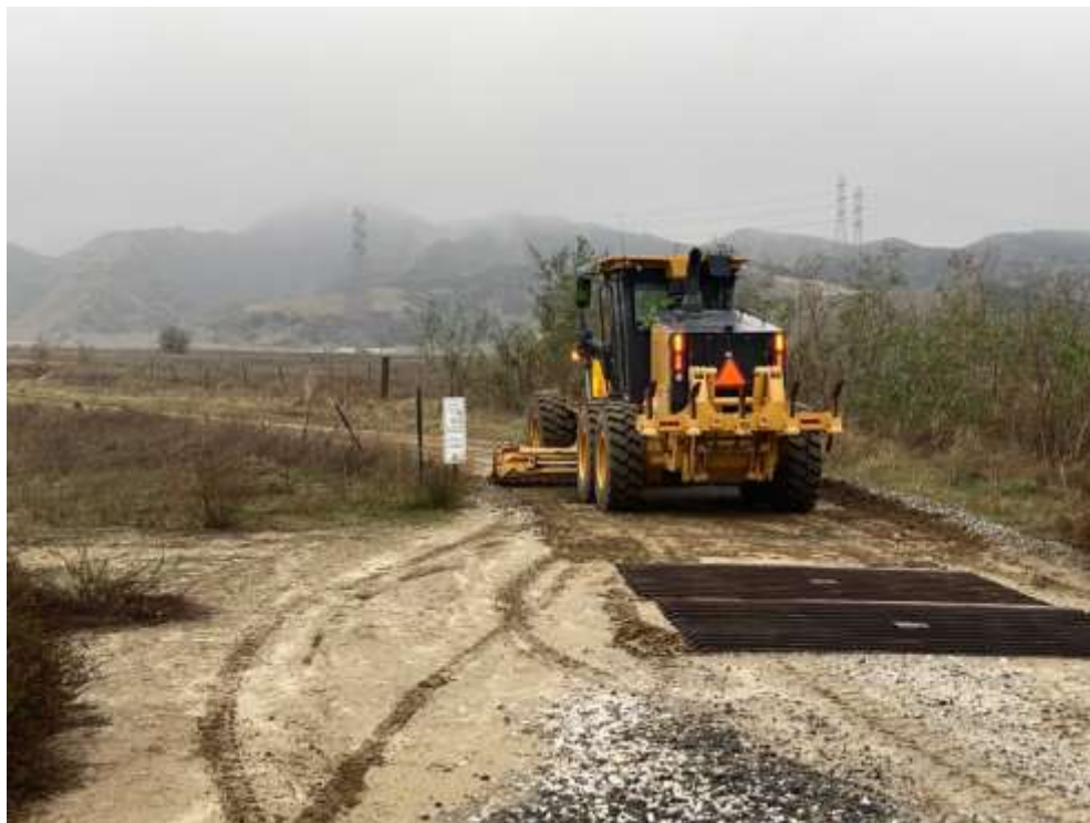
Photo 2 – Access road maintenance between El Casco Substation and Construction Area 3N06, Segment 3 (January 18, 2022) (Photo courtesy of SCE).