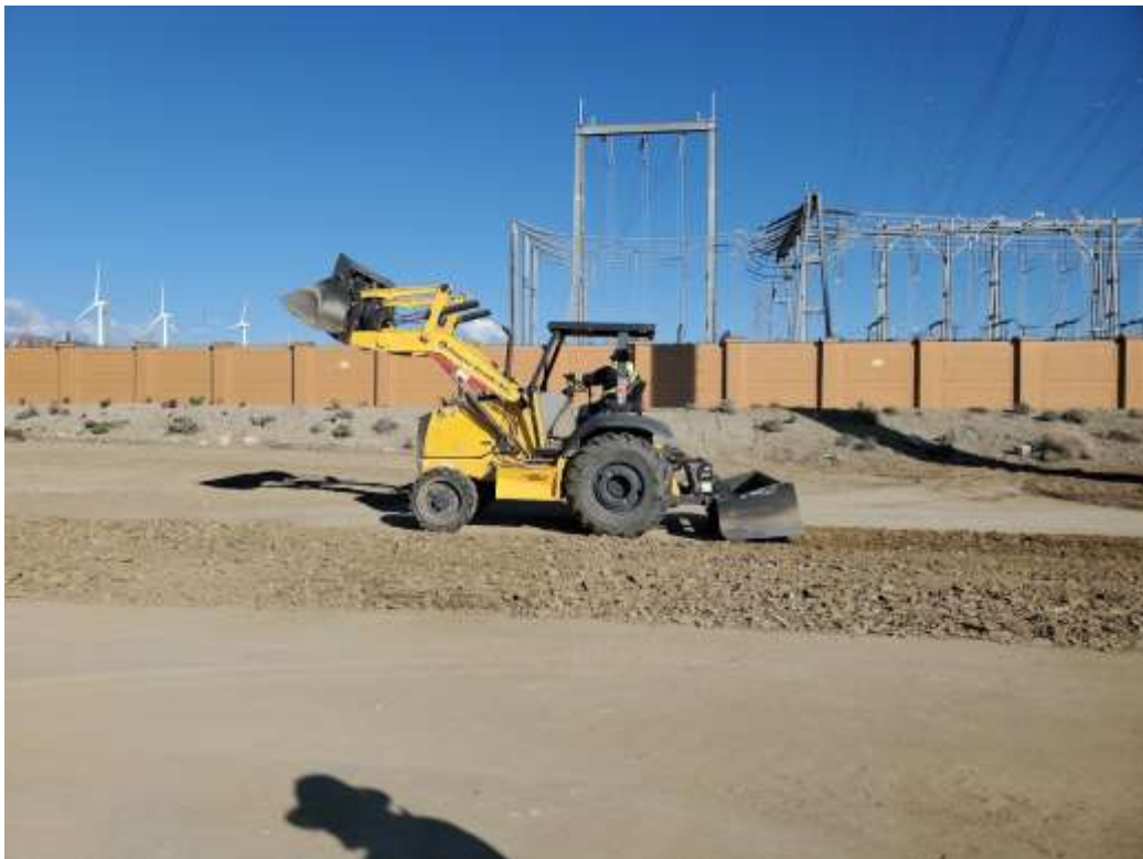
Photo 4 – Site decompaction and hydroseed preparation at Construction Area 6X08, Segment 6 (January 18, 2022).