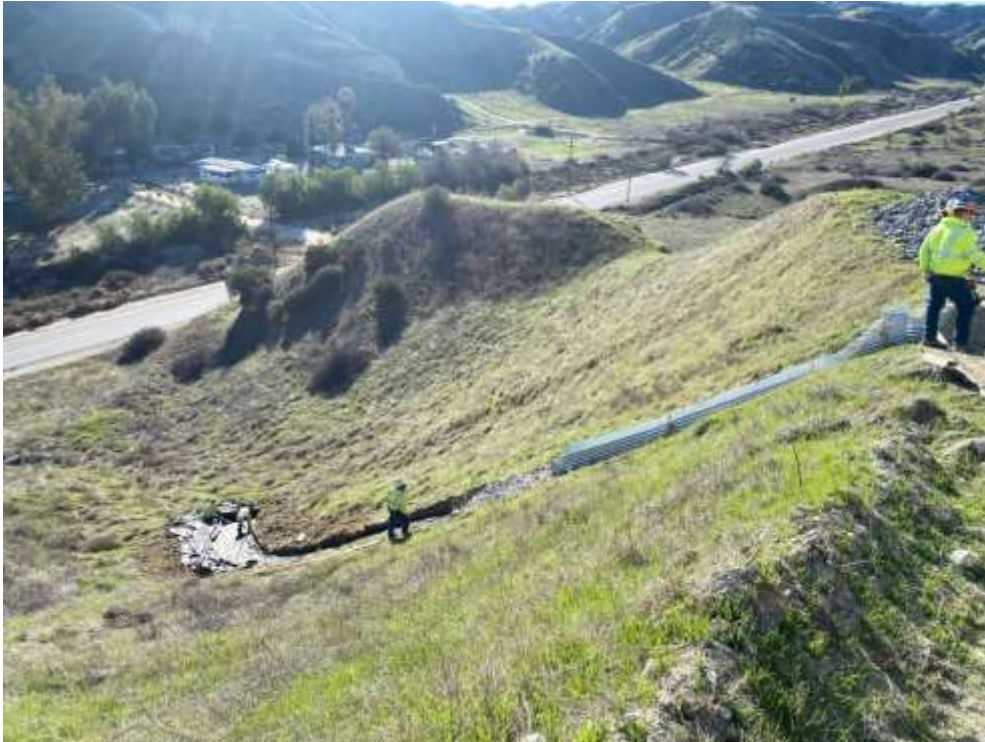
Photo 1 – MAC drain dissipator and rock apron installation at Construction Area 3X35, Segment 3 (January 27, 2022) (Photo courtesy of SCE).