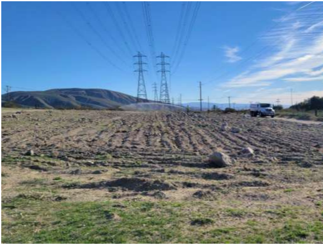
Photo 3 – Hydroseed watering at Construction Area 5X01, Segment 5 (January 26, 2022).