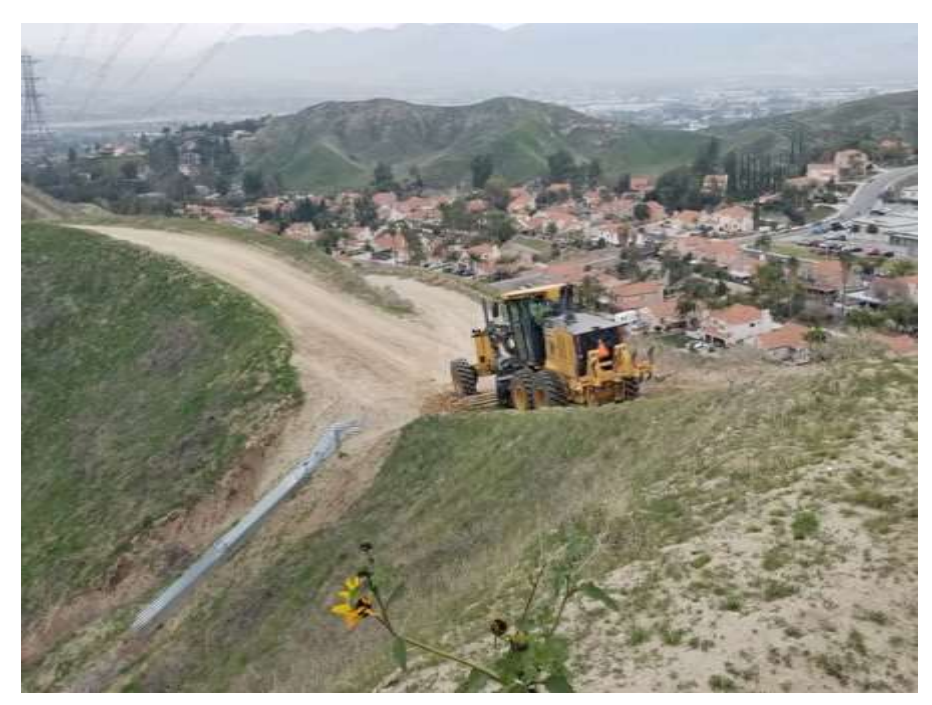
Photo 1 – Access road maintenance between Construction Areas 2N17 and 2N18 (January 31, 2022) (Photo courtesy of SCE).