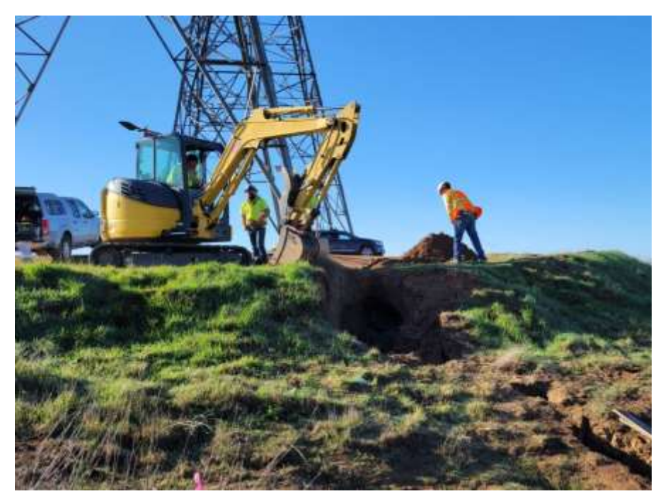
Photo 5 – Exploratory potholing at Construction Area 4X34, Segment 4 (February 16, 2022) (Photo courtesy of SCE).