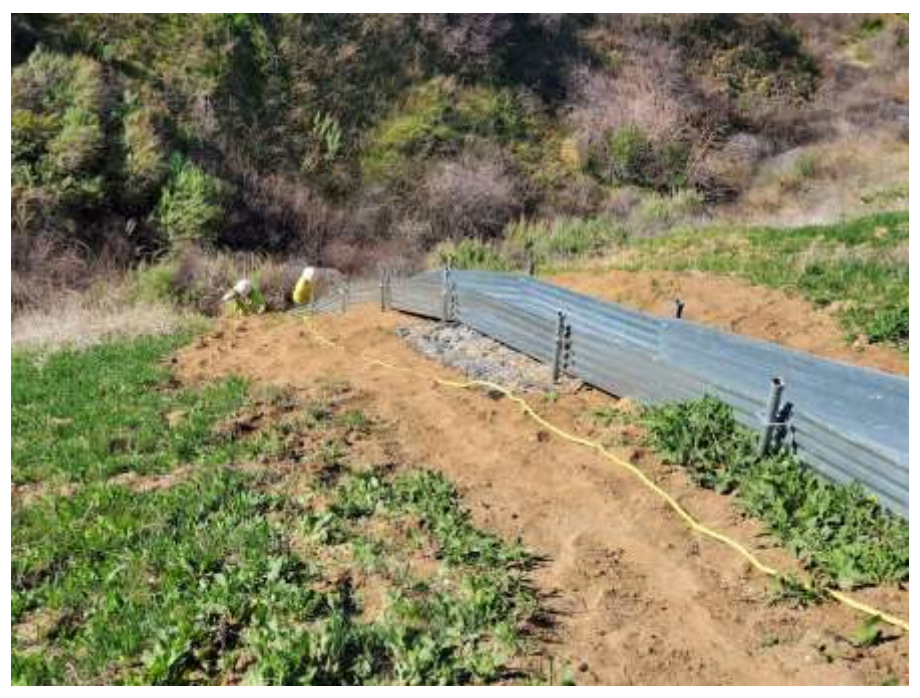
Photo 2 – MAC drain installation at Construction Area 3X64, Segment 3 (February 16, 2022).