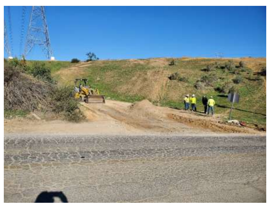
Photo 3 – Stabilized entrance removal at Refuse Road, Segment 3 (February 10, 2022).