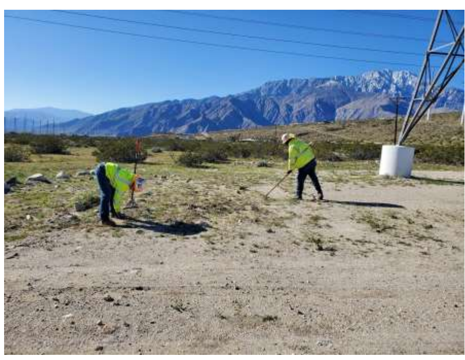
Photo 4 – Hand weeding at Construction Area 6S18, Segment 6 (March 8, 2022).