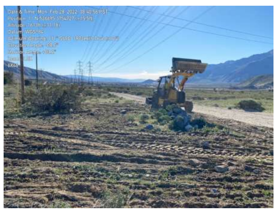
Photo 3 – Decompaction at Construction Area 6X46, Segment 6 (February 28, 2022).