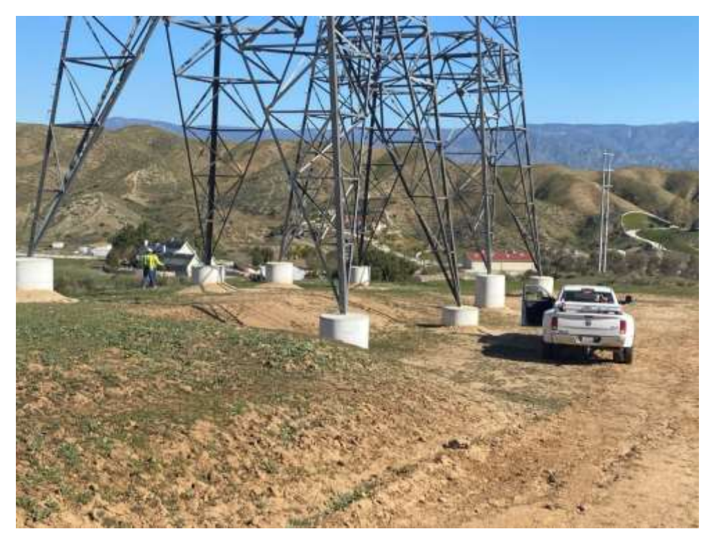
Photo 1 – BMP removal and site clean-up at Construction Area 3X57, Segment 3 (March 9, 2022) (Photo courtesy of SCE).