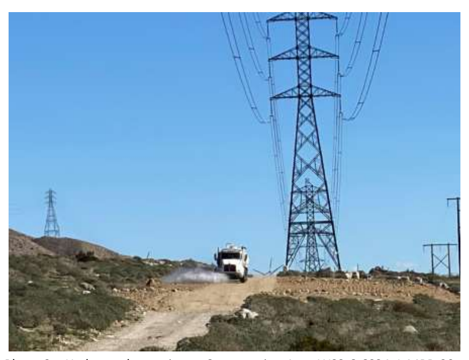
Photo 2 – Hydroseed watering at Construction Area WSS-6-6S34-1-MPR-29, Segment 6 (December 12, 2022).