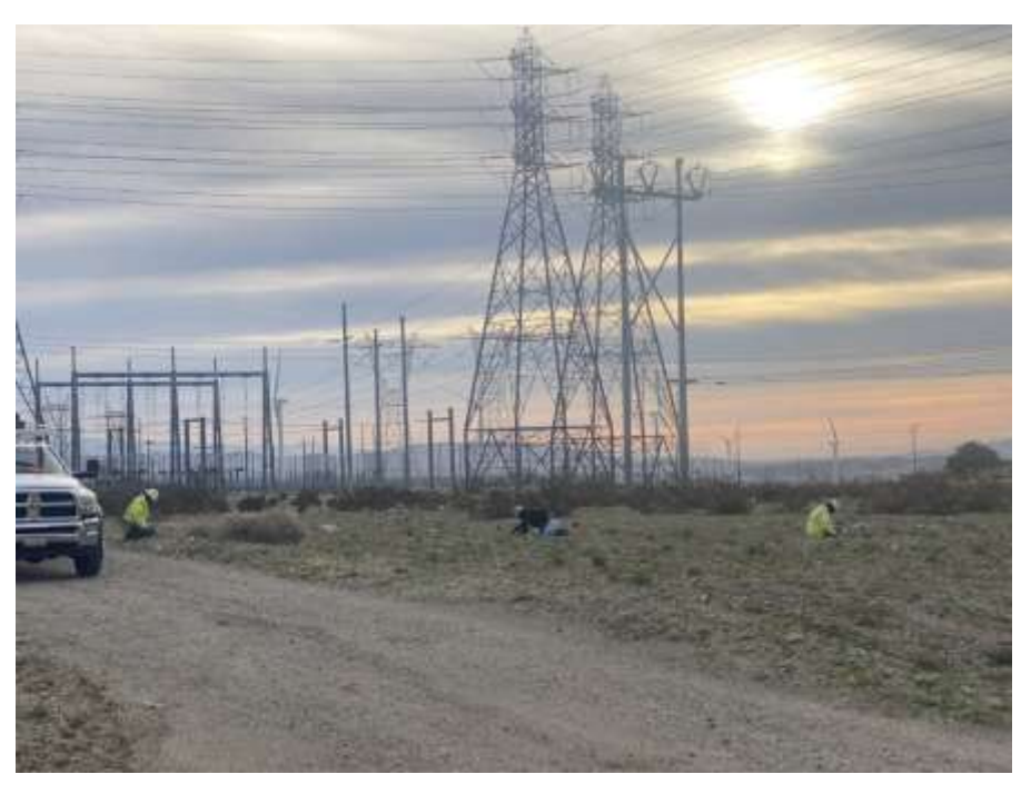
Photo 3– Restoration site weeding at Construction Area 6X11, Segment 6 (December 20, 2022) (Photo courtesy of SCE).