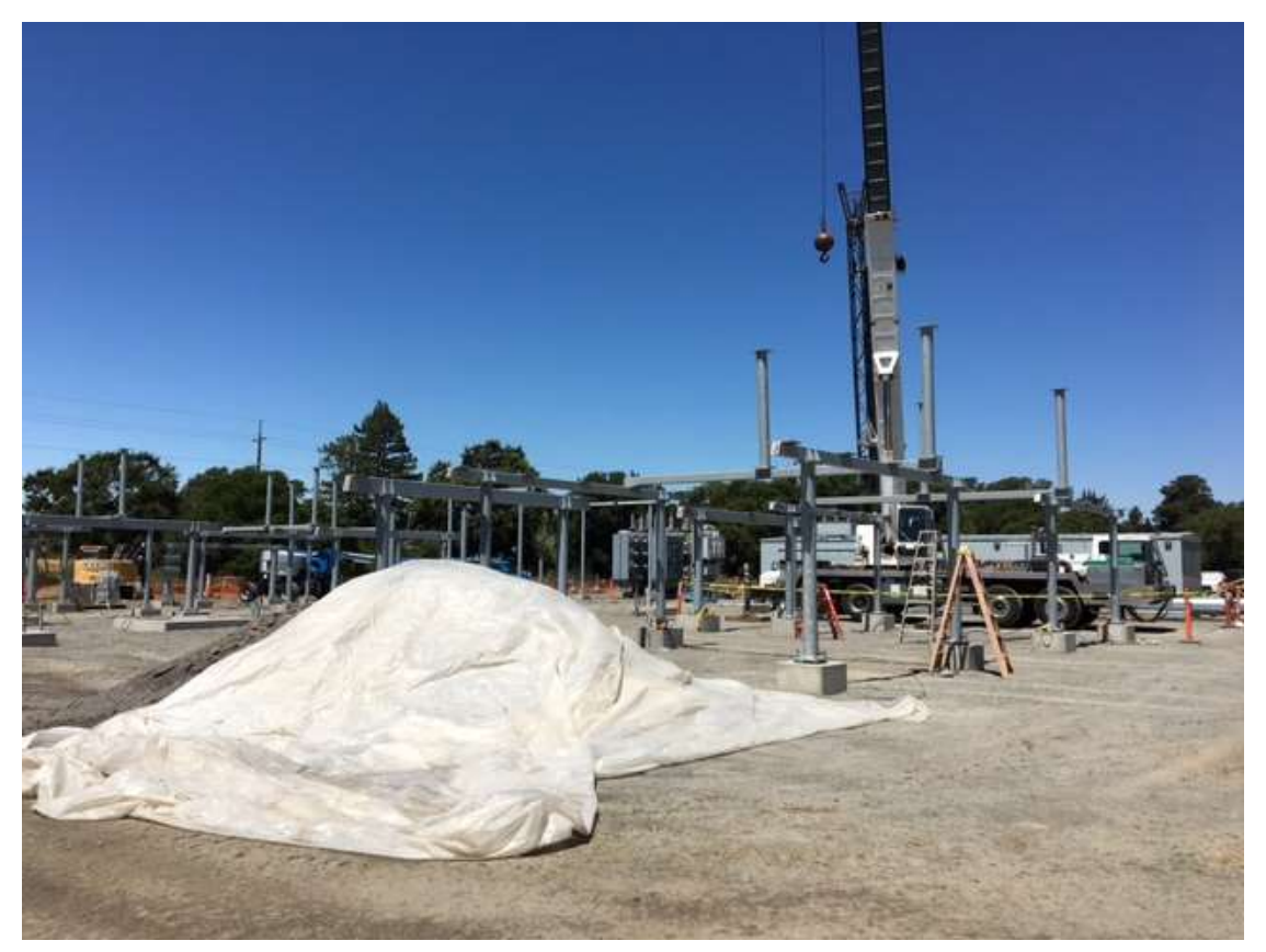
Figure 5 – Erecting steel bus structures – view northwest, July 26, 2017.