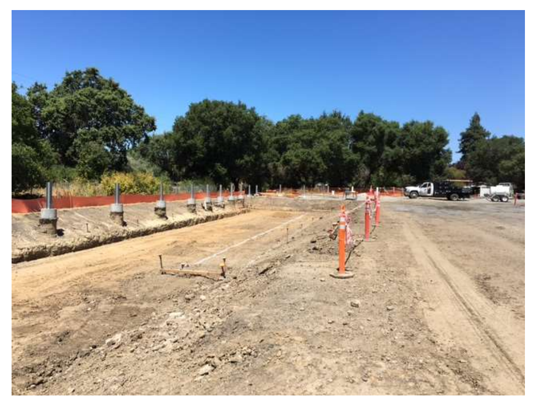
Figure 2 – SPCC pond excavation on west side of site – view north, July 26, 2017.