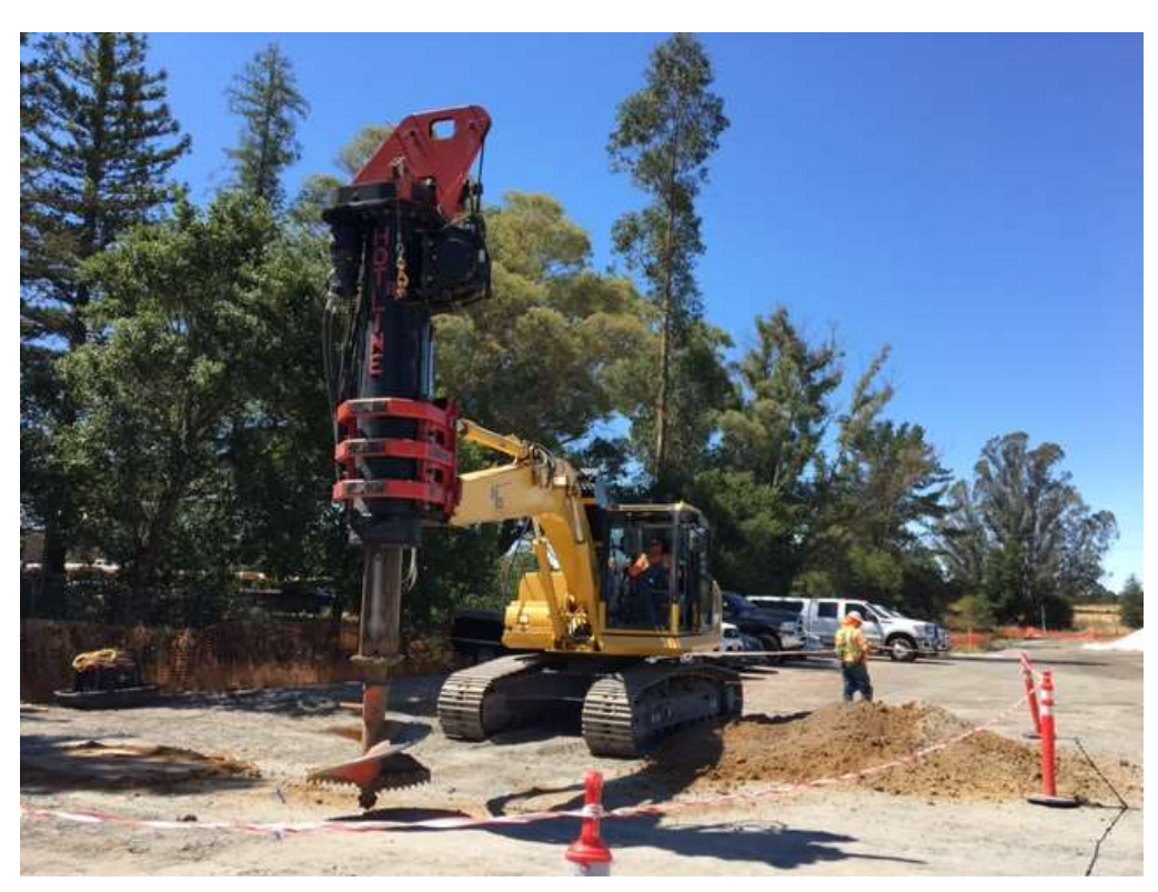
Figure 1 – Drilling pier holes for perimeter wall foundation on east side of site – view west-southwest, July 26, 2017.