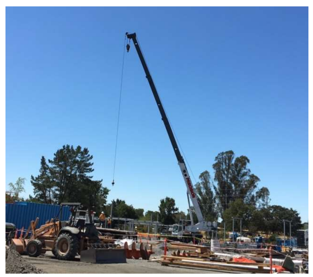
Figure 4 – Erecting steel bus structures with crane – view southwest, July 26, 2017.