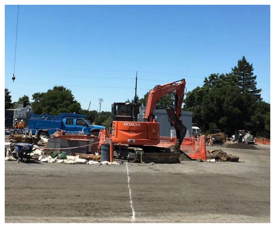
Figure 3 – Excavating for telecom line – view west, July 26, 2017.