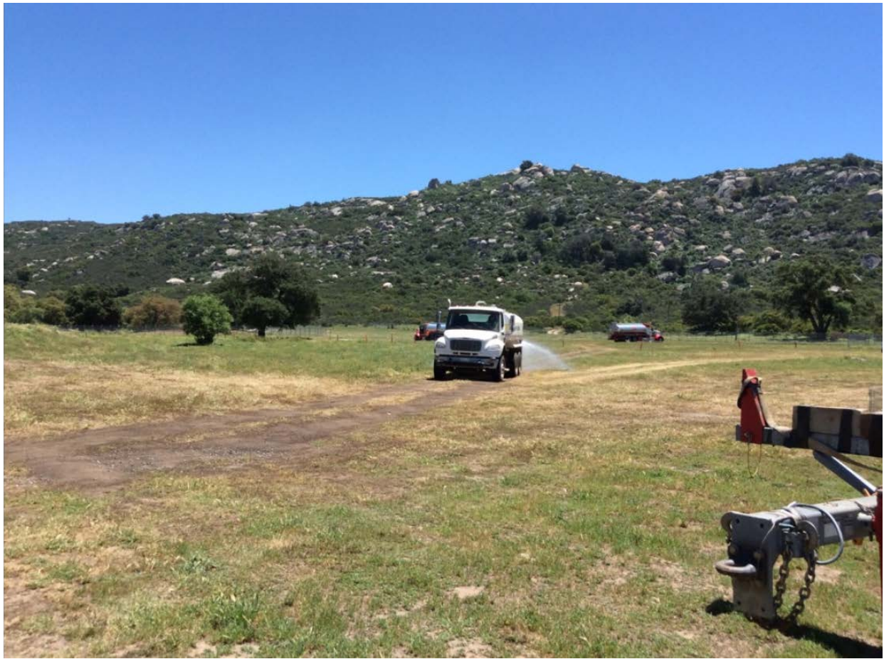
Photo 1: A water tender was observed applying water to the surface at Sol Valley South Staging Yard (TL 6923) throughout the day to reduce dust emissions, especially in areas where helicopter activity was occurring, in accordance with APM AIR-02.