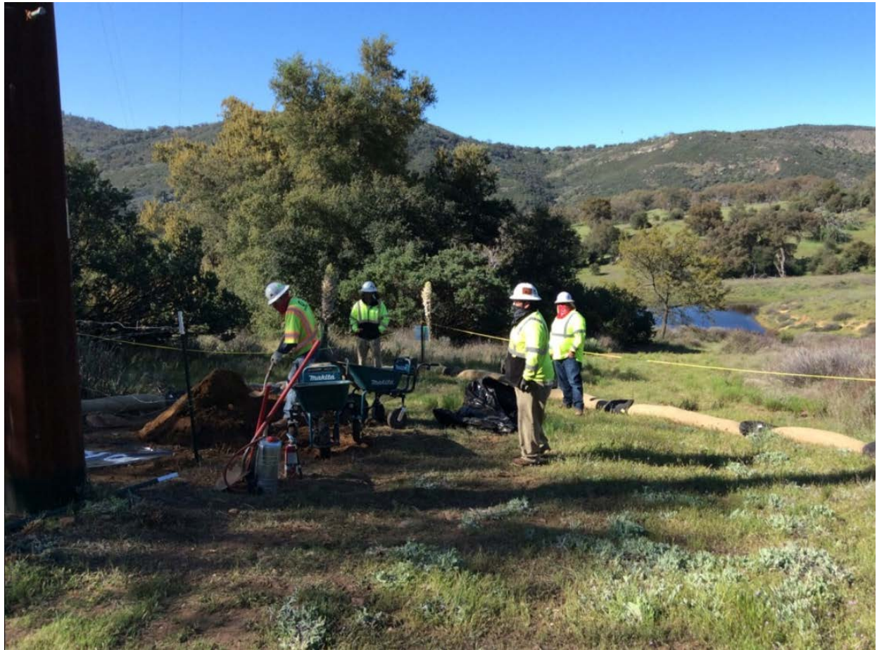
Photo 5: A crew was observed removing spoils from a pole location along TL 626 Conversion North (C 222). Archaeological and cultural monitors were observed monitoring the activity in accordance with the HPMP (MM CUL-1) and APM CUL-04.