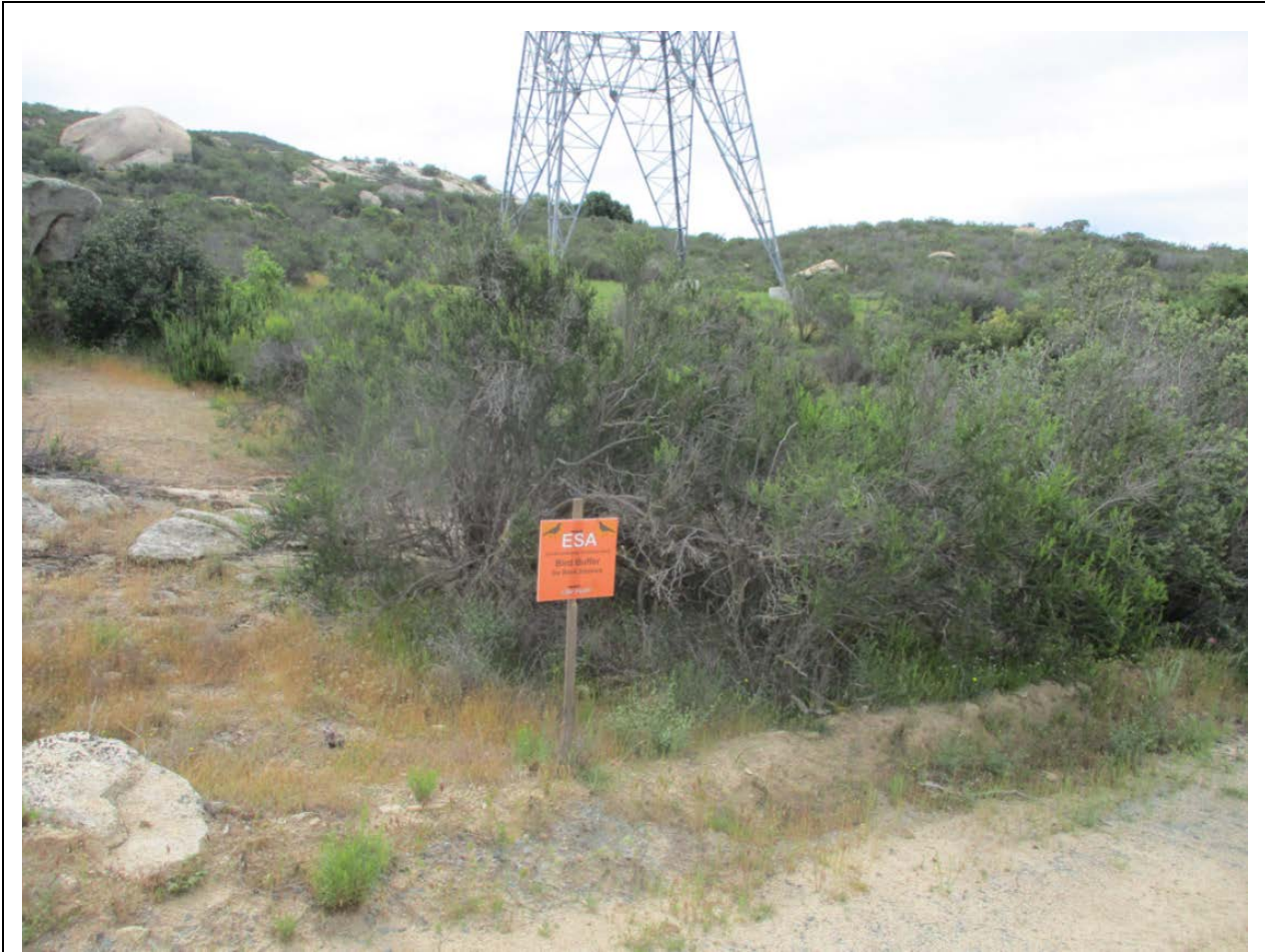
Photo 4: A nest buffer sign for a nesting pair of red-tailed hawks in an adjacent lattice transmission tower was documented along the access road near Z972848 (TL 6923) in accordance with the APP/NBMP (MM BIO-28). The sign (and others) were installed by the avian biologist after the nest was reported to the avian biologist by the on-site biological monitor the previous work day.