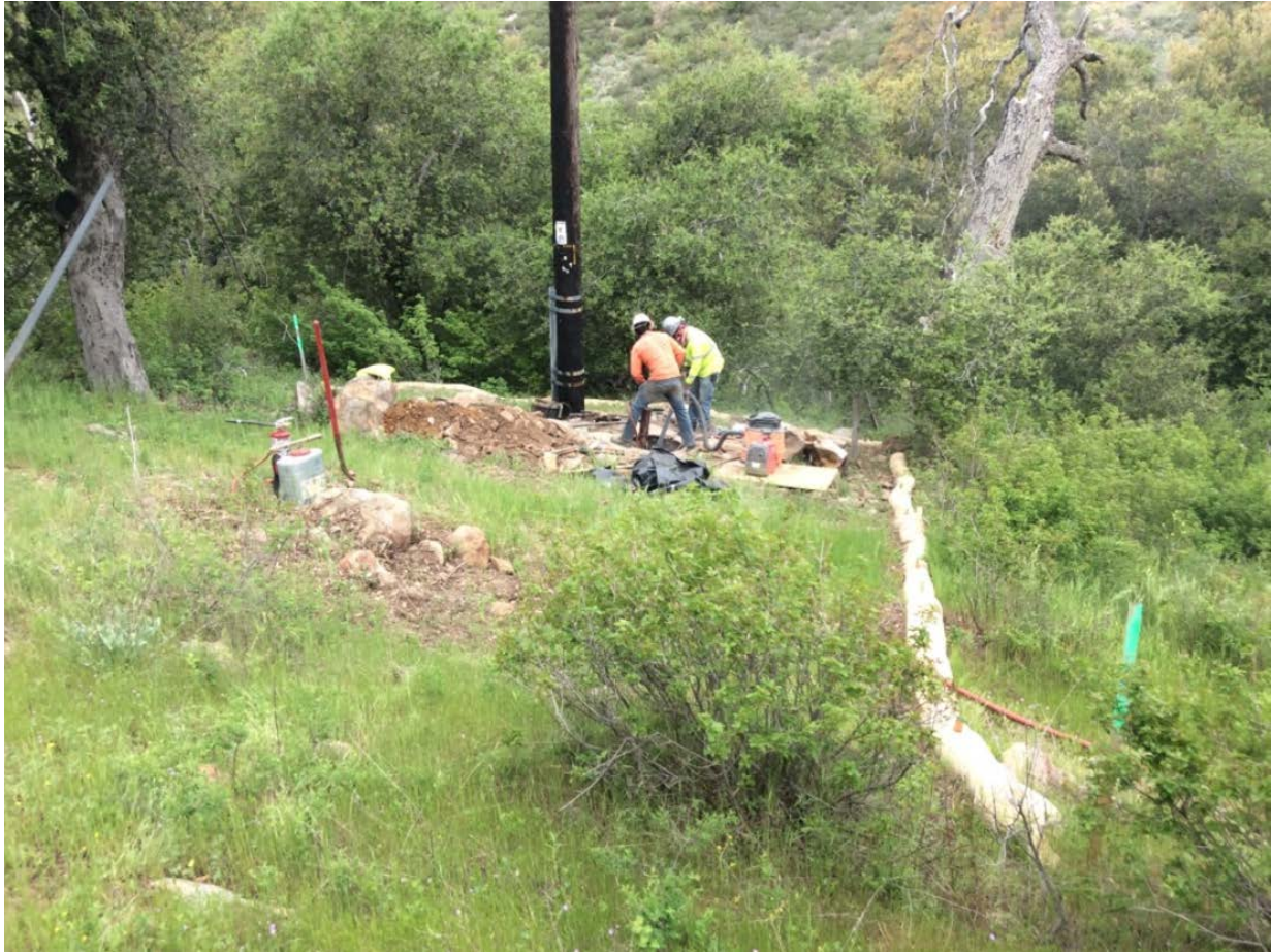
Photo 2: A crew was observed digging a direct-bury pole hole at P259369 (TL 626 Conversion North (C 222)) within clearly delineated work limits in accordance with MM BIO-1. Fire tools were observed on site in accordance with the CFPPP (MM FF-1).