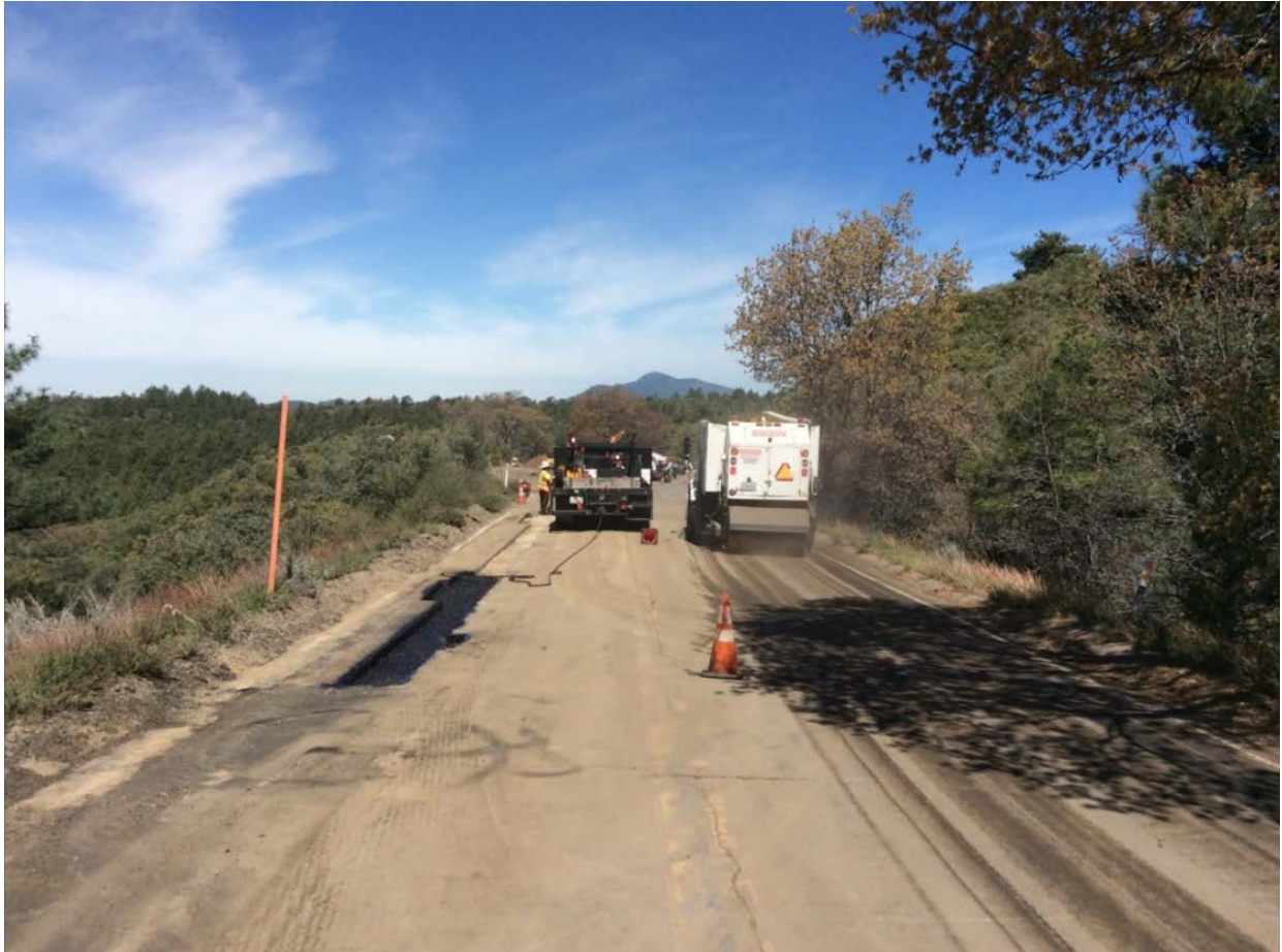
Photo 6: A street sweeper was used to remove debris from the C 440 Phase I road during trench patching in accordance with the project SWPPP (MM HYD-1 and MM BIO-7).