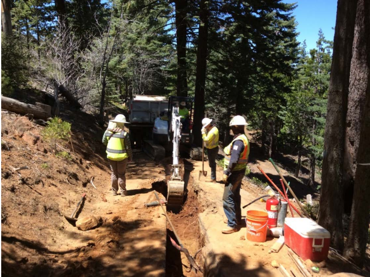
Photo 3: A biological monitor was observed monitoring trench excavation near 26+00 (C 79A) in accordance with MM BIO-22. In addition, a full set of fire tools was observed within 50 feet in accordance with the CFPPP (MM FF-1).