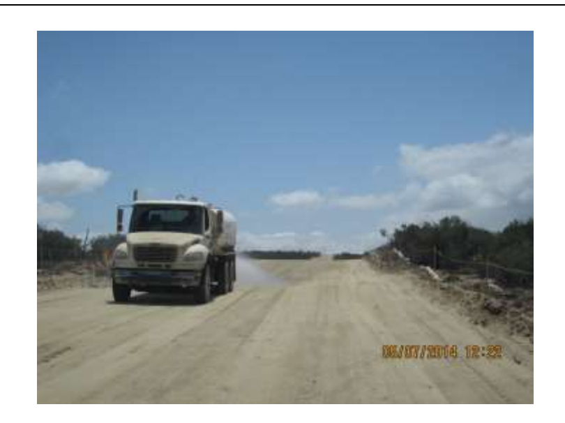
Photo 2: Water trucks are being utilized to minimize dust emissions in accordance with MM-AQ-1 and MM-BIO-4a.

Photo 1: All excavations were inspected daily prior to and during construction activities to ensure that no wildlife species had become entrapped in accordance with MM-BIO-7e. The photo above shows a biological monitor relocating a small rabbit found during morning inspection.