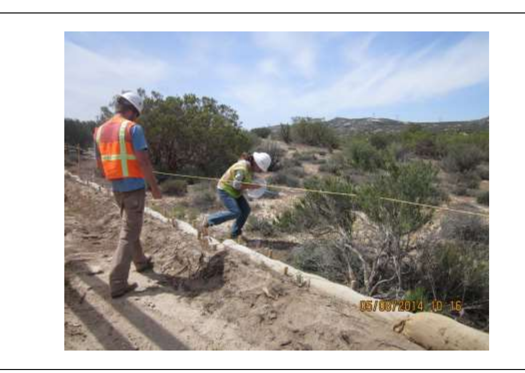
Photo 1: All excavations were inspected daily prior to and during construction activities to ensure that no wildlife species had become entrapped in accordance with MM-BIO-7e. The photo above shows a biological monitor relocating a small rabbit found during morning inspection.