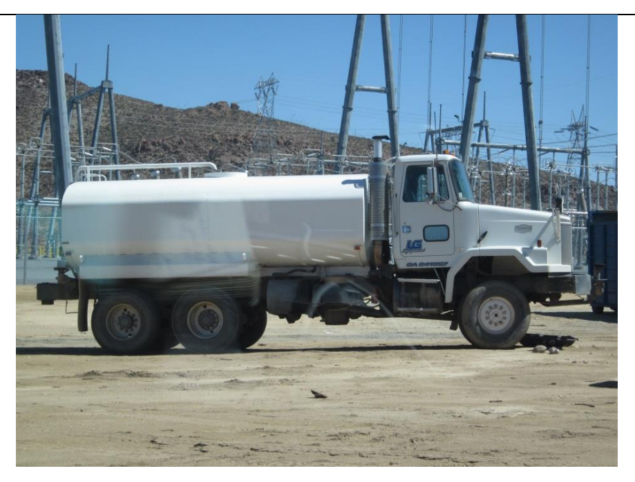
Photo 4: Staged equipment was equipped with drip pan containment in accordance with HAZ-1a.

Photo 3: Erosion and sediment controls included the use of straw wattles along the work area perimeter and hydro-mulch on graded slopes (MM HYD-1), and fire tools and water supply were observed on site (FF-1).