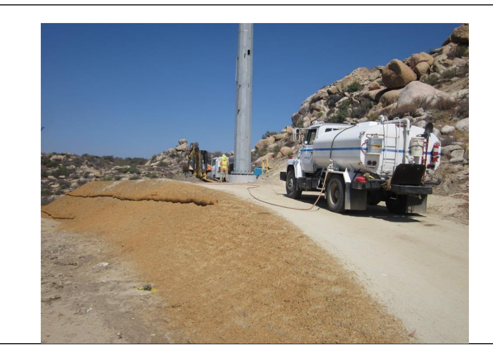
Photo 3: Erosion and sediment controls included the use of straw wattles along the work area perimeter and hydro-mulch on graded slopes (MM HYD-1), and fire tools and water supply were observed on site (FF-1).