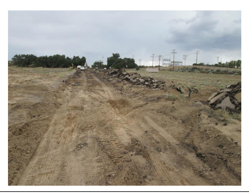
Photo 1: Construction crews removed the existing asphalt access road to the Boulevard Substation Rebuild site. All work at Boulevard Substation Rebuild site was completed within the approved work limits.