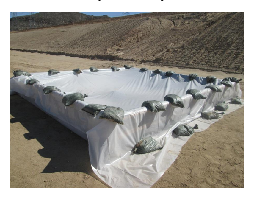
Photo 4: A concrete washout basin is established in preparation of pouring concrete foundations at the 138/230 kV pad site in accordance with the SWPPP and MM-HYD-1.