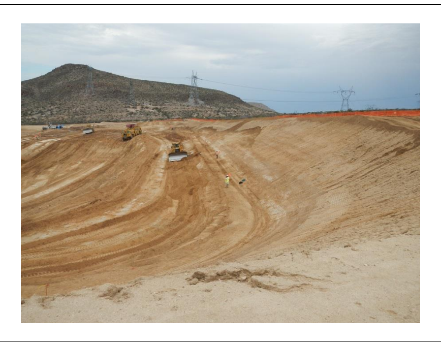
Photo 3: Construction activities associated with rough grading of the 500 kV substation pad at the ECO substation site continued during the week of September 2.