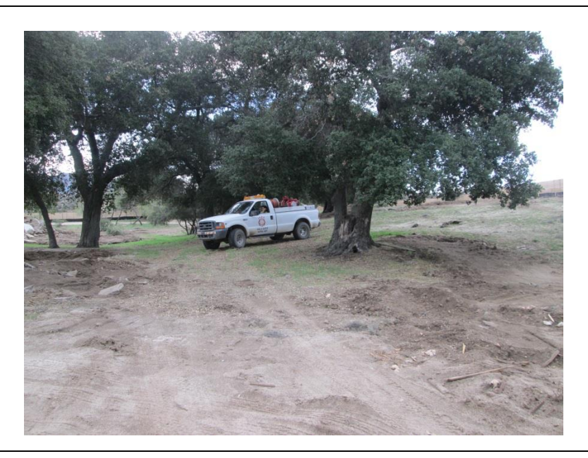
Photo 2: In accordance with Mitigation Measure FF-1, fire patrols are onsite during construction and for 1 hour following construction activities.