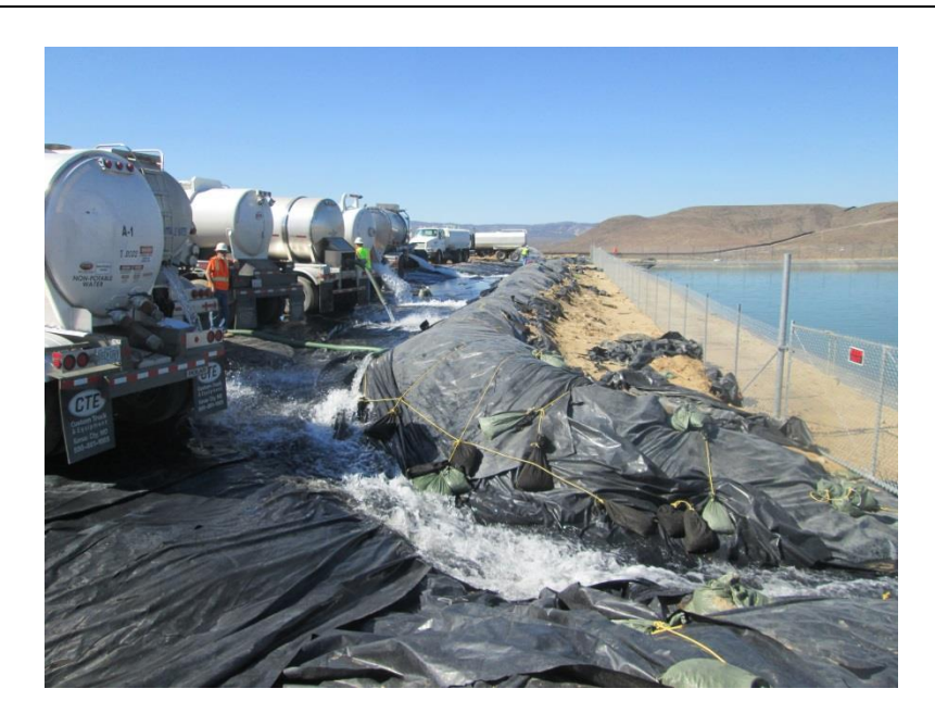
Photo 6: Water trucks deliver water from offsite resources including the City of San Diego, Campo Indian Reservation and Jacumba Community Services District in accordance with MM-HYD-3 and the Amended Construction Water Supply Plan.