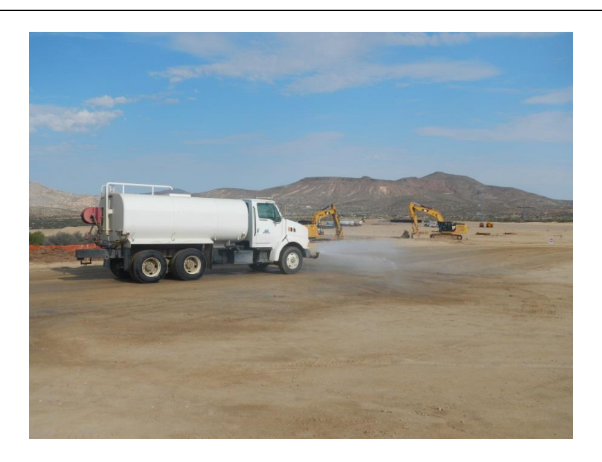
Photo 5: Water trucks are utilized on a regular basis to minimize fugitive dust emissions in accordance with MM-BIO-4A and the Dust Control Plan.