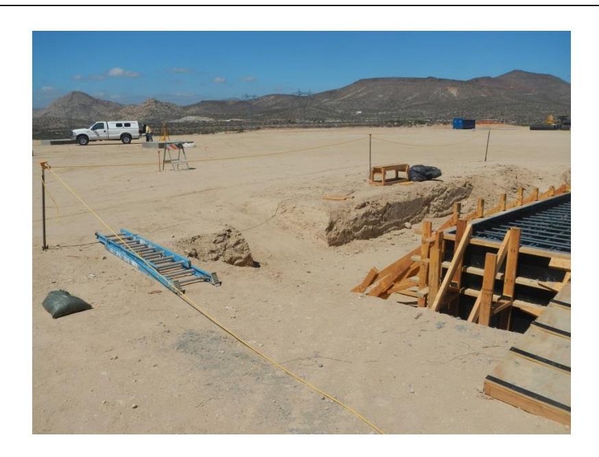
Photo 2: Wildlife escape ramps being utilized at the 138/230 kV ECO Substation pad site to prevent wildlife entrapment in accordance with MM-BIO-7A.