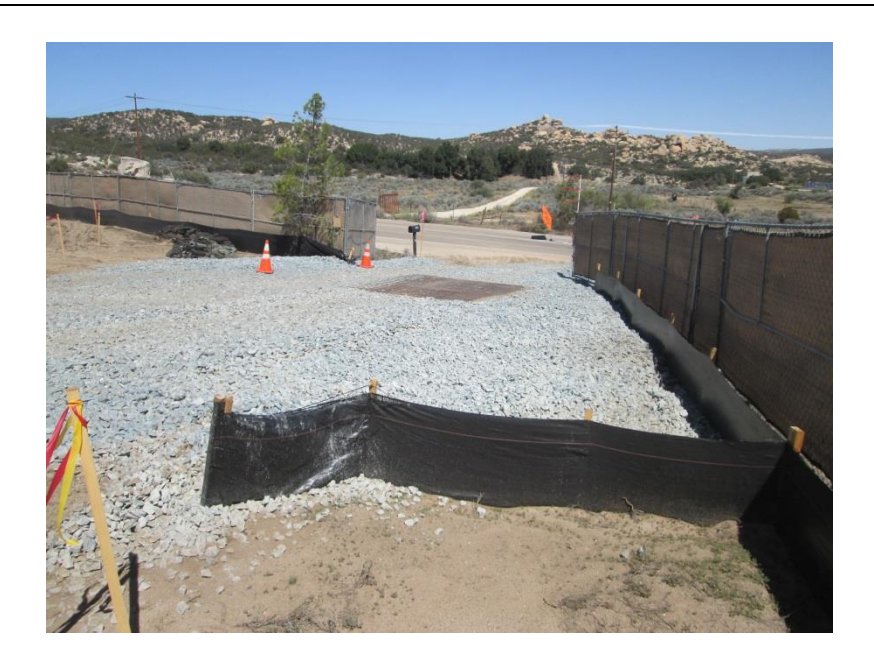
Photo 4: Trac-out measures consisting of a rattle plate and rock apron are being maintained at the point of ingress/egress to the Boulevard Substation Rebuild Site along Old Highway 80.