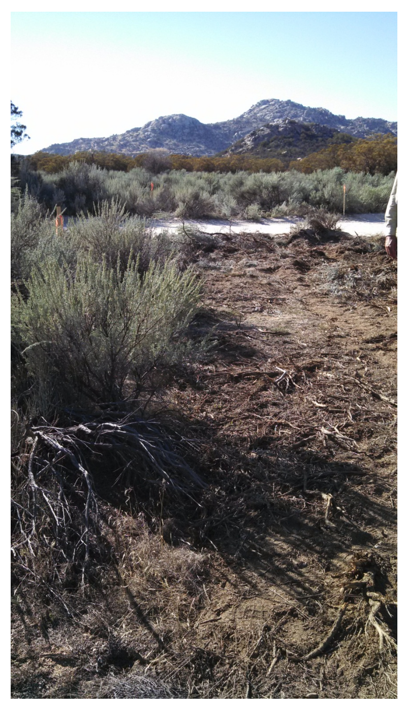
Photograph 1: View facing west of the area of disturbance outside of the approved limits for the Yard but within the Section 3 ROW.