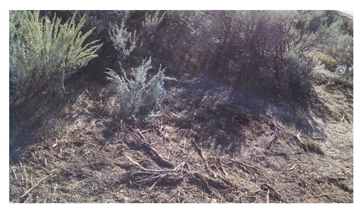
Photograph 2: View facing southwest of the area of disturbance outside of the approved limits for the Yard and the Section 3 ROW.