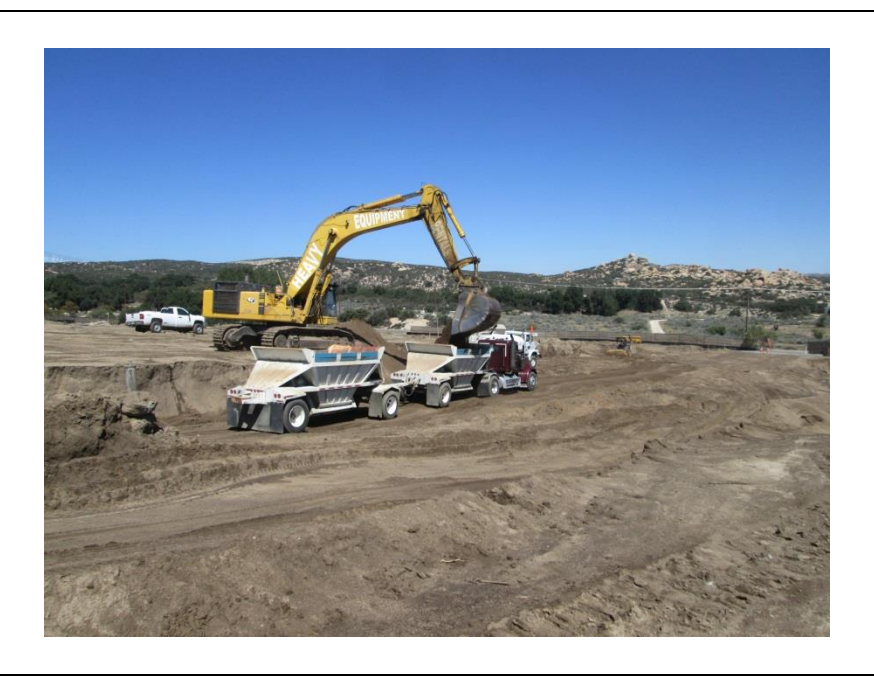
Photo 3: An excavator is utilized to load haul trucks to export soil from the Boulevard Substation Rebuild Site.