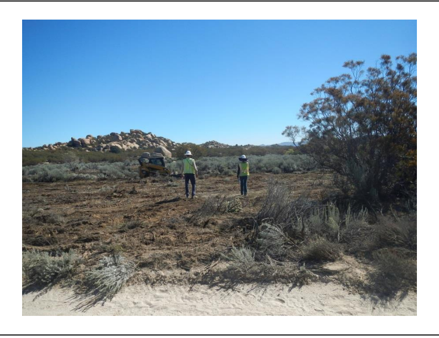
Photo 6: Biological monitors present during vegetation clearing at the Domingo Lake Construction Yard in accordance with MM-BIO-1C.