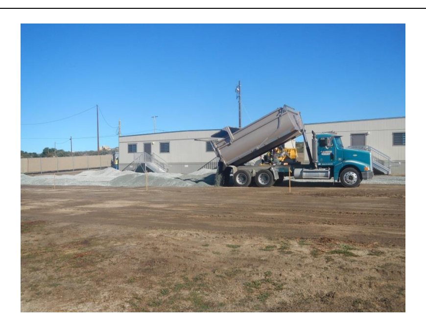
Photo 5: Gravel base being delivered to the Jewel Valley Construction Yard that will be utilized to stage construction equipment and materials.