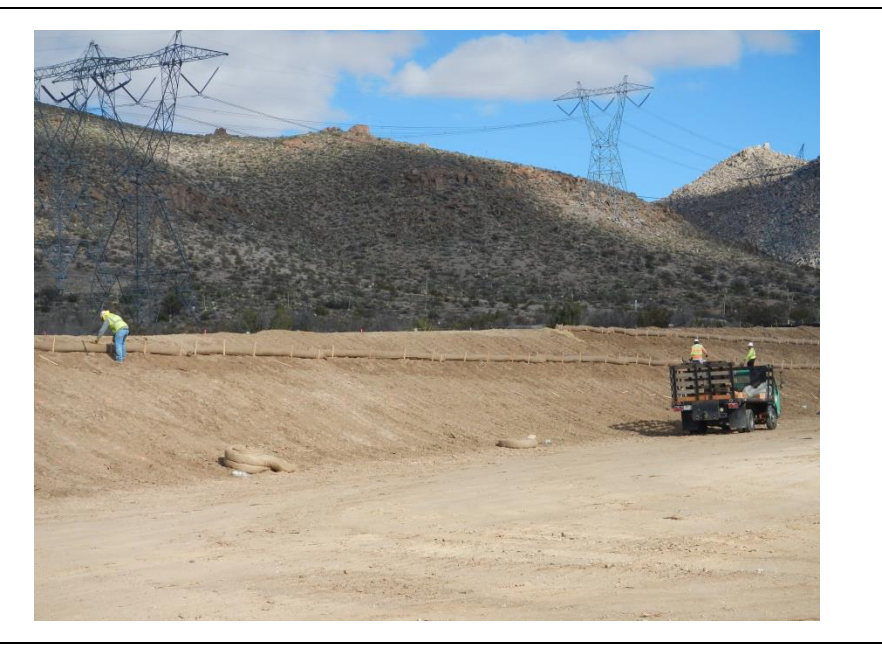
Photo 8: BMPs consisting of straw wattles were observed being placed along slopes at the ECO substation site in accordance with the SWPPP and MM-HYD-1.

Photo 7: The control shelter at the ECO substation was observed being constructed with an Otay Ranch Brown-colored split face concrete block in accordance with the Surface Treatment Plan and MM-VIS-3g.