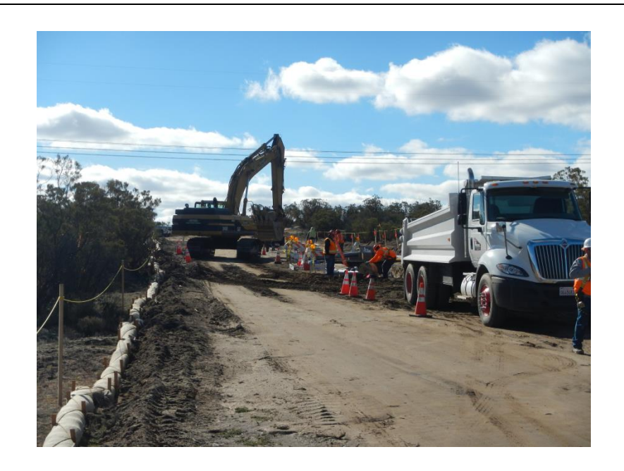
Photo 4: Yellow ropes are utilized to delineate the approved work limits during construction activities associated with the underground alignment in accordance with MM-BIO-1a. BMPs consisting of straw wattles are also placed along the work limits in accordance with MM-HYD-1 and the SWPPP.

Photo 3: In accordance with MM-BIO-7b, speed limit signage is posted along access roads during construction of the 138 kV underground alignment. Construction vehicles are not to exceed 15 miles per hour on unpaved roads and the right-of-way accessing the construction site.