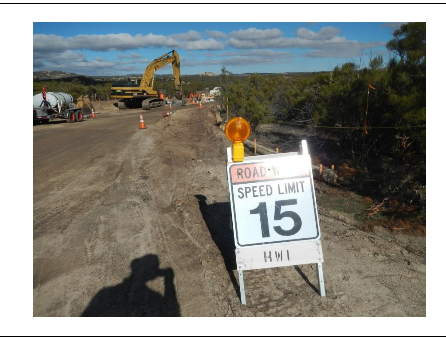
Photo 3: In accordance with MM-BIO-7b, speed limit signage is posted along access roads during construction of the 138 kV underground alignment. Construction vehicles are not to exceed 15 miles per hour on unpaved roads and the right-of-way accessing the construction site.