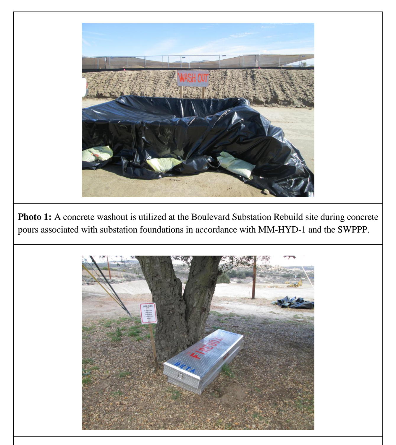
Photo 2: A Fire Box containing fire equipment is maintained onsite at the Boulevard Substation Rebuild Site in accordance with the Construction Fire Prevention Plan (Mitigation Measure FF-1).