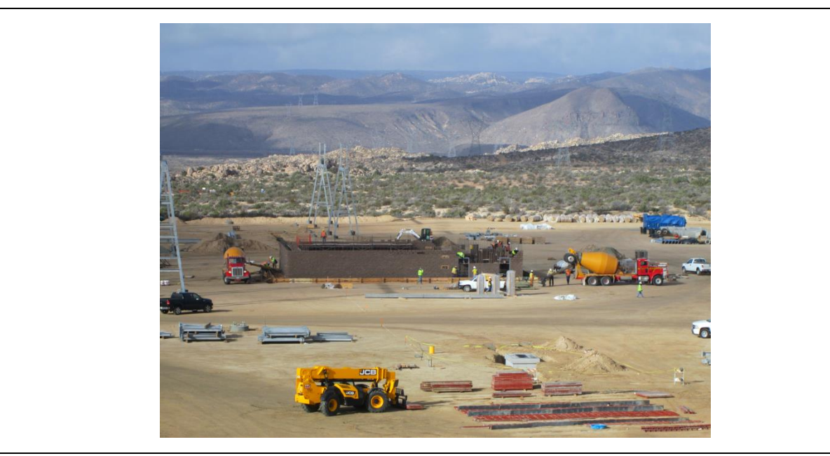
Photo 7: The control shelter at the ECO substation was observed being constructed with an Otay Ranch Brown-colored split face concrete block in accordance with the Surface Treatment Plan and MM-VIS-3g.