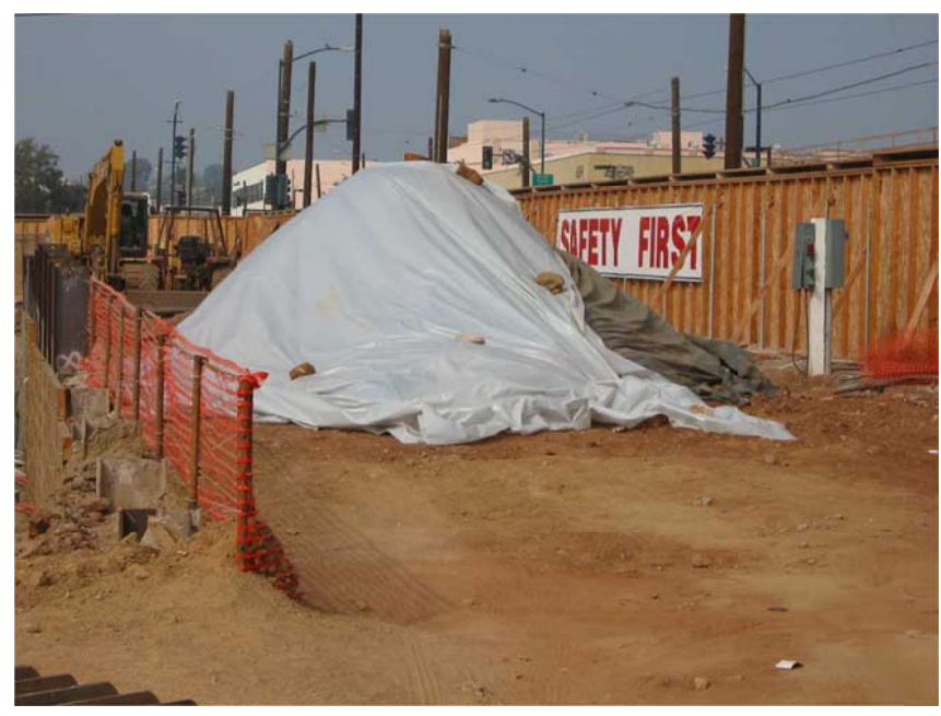
Stockpile covered with plastic and secured with large rocks.