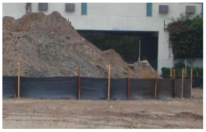
Silt fence used for stockpile perimeter control.