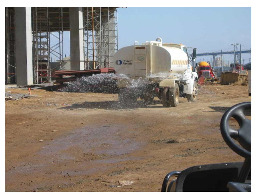
Water being applied for dust control.