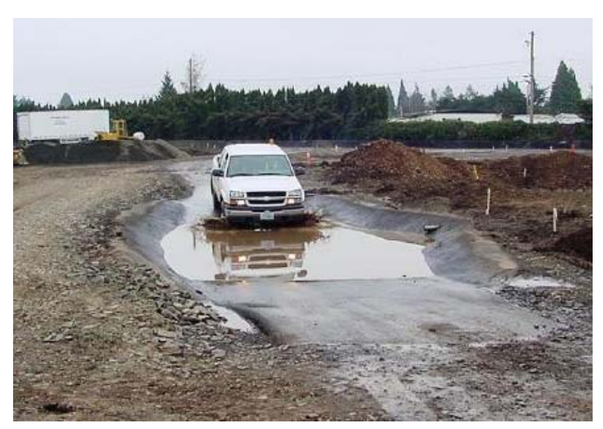
Drive through wheel wash before exiting a site.