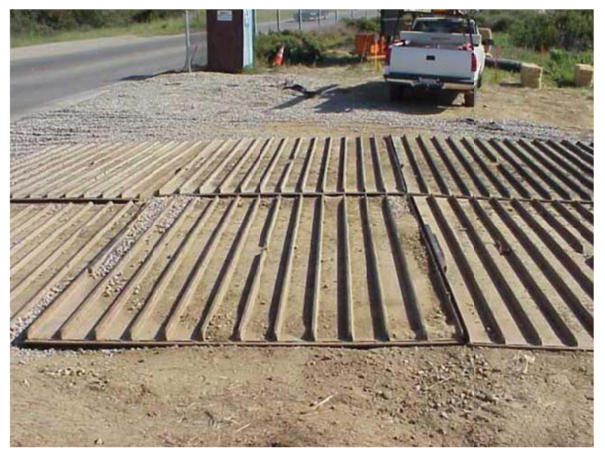
Manufactured metal plates knock dirt off vehicle tires before exiting a site.