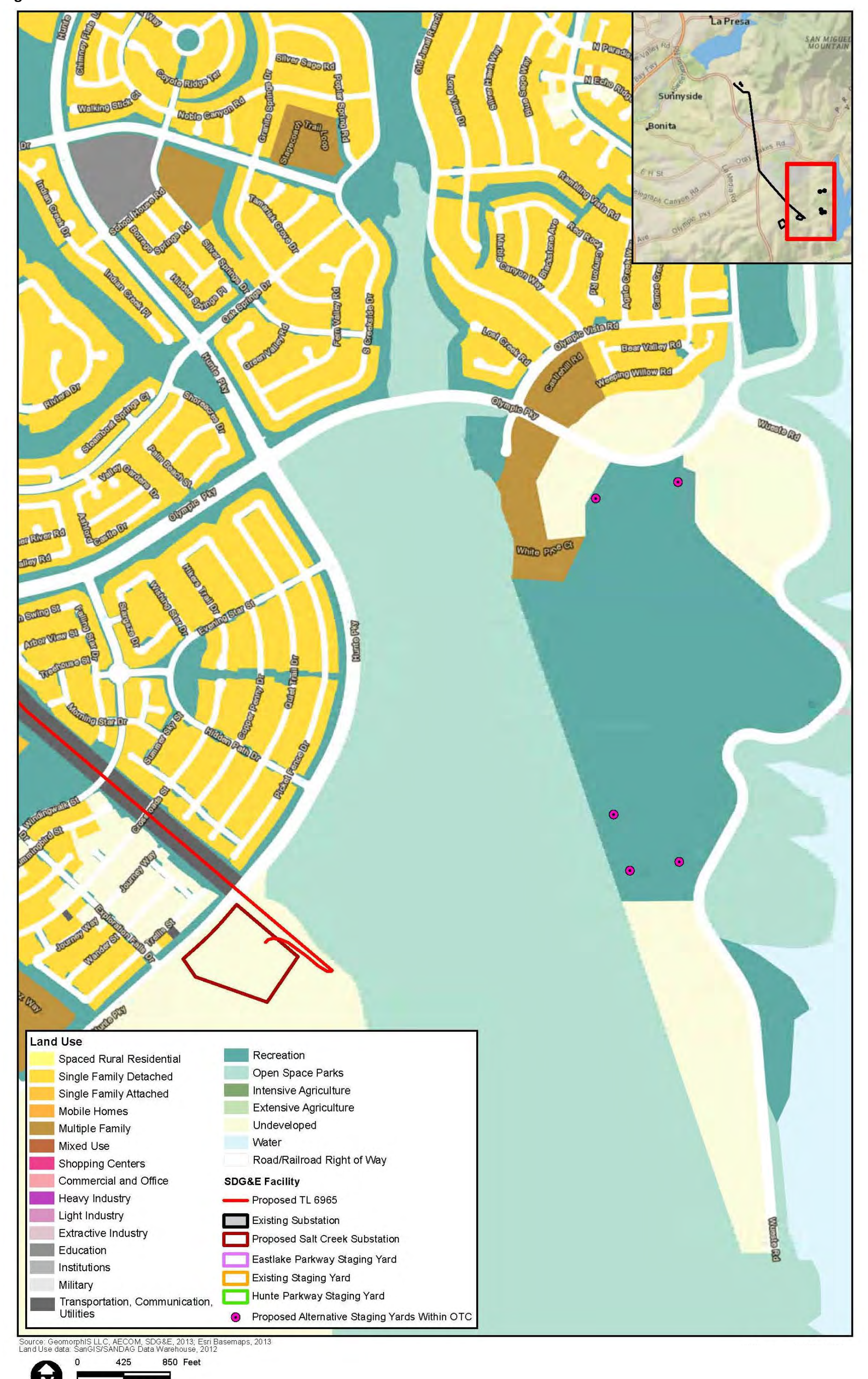
Figure 4.10-1C: Land Use

Note: SDG&E is providing this map with the understanding that the map is not survey grade.