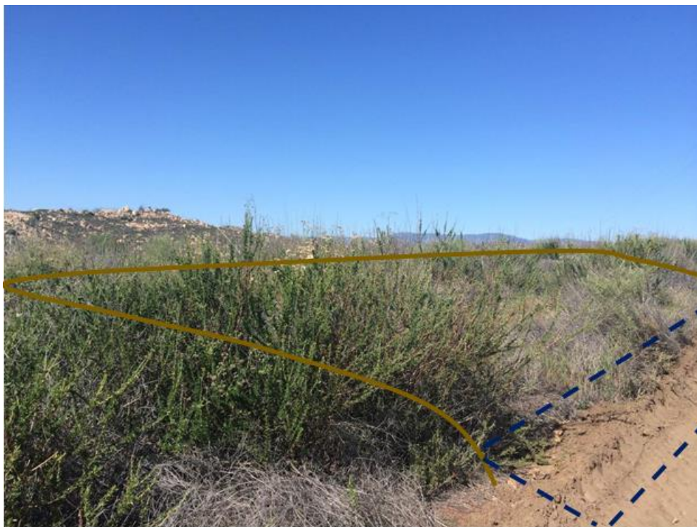
Photograph 2: View of proposed Stringing Site No. 14 with approximate boundary outlined in brown and berm flattening area shown in dashed blue, facing northwest.