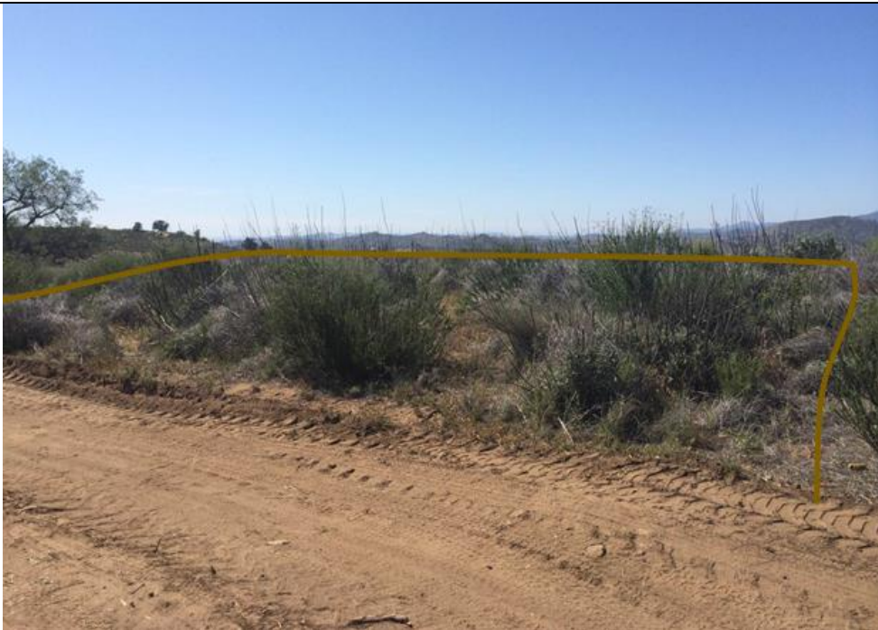
Photograph 1: View of proposed Stringing Site No. 14 with approximate boundary outlined in brown, facing northwest.