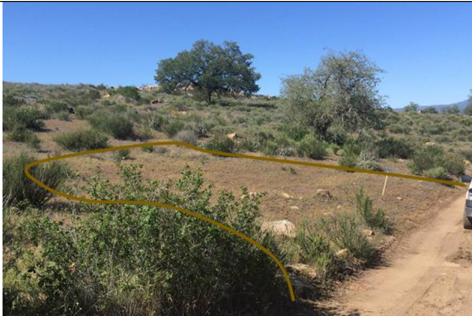
Photograph 3: View of proposed Stringing Site No. 15 with approximate boundary outlined in brown, facing northeast.