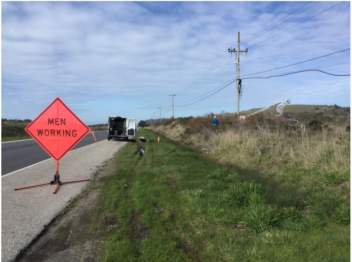
Photo 1: Aerial antennae installation and traffic control signage on Highway 1 northbound.