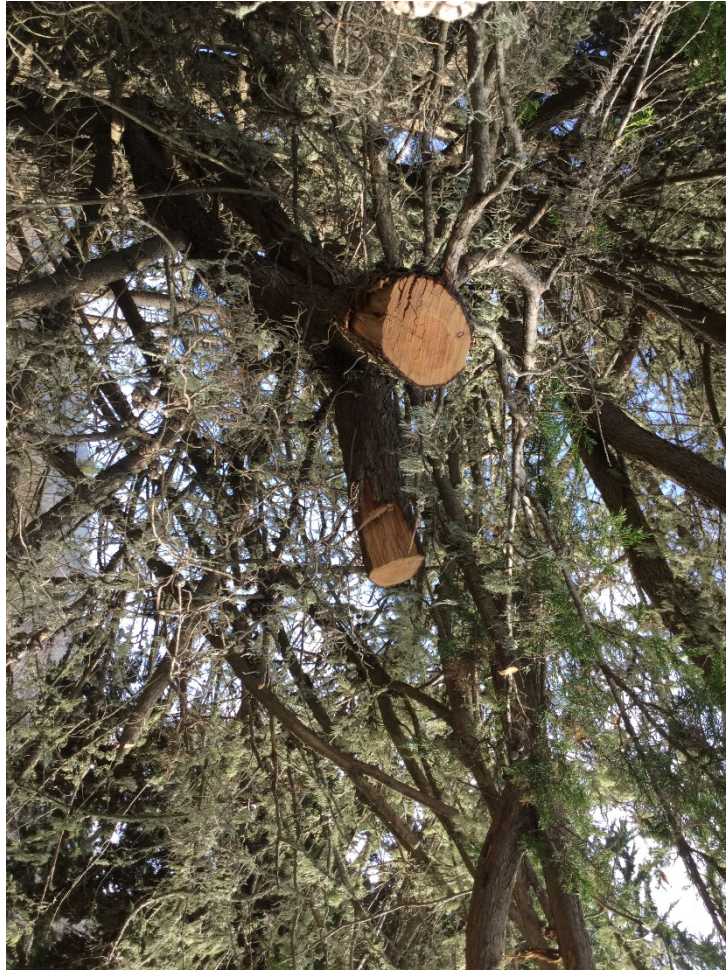
Photo 2: Small pruning cuts on Monterey cypress to clear power-line access road.