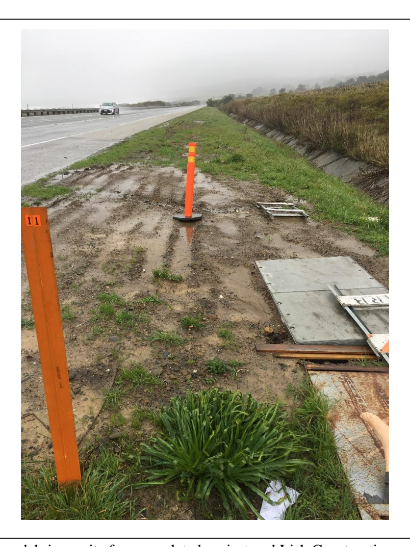
Photo 5 : Construction debris on-site from unrelated project and Irish Construction.