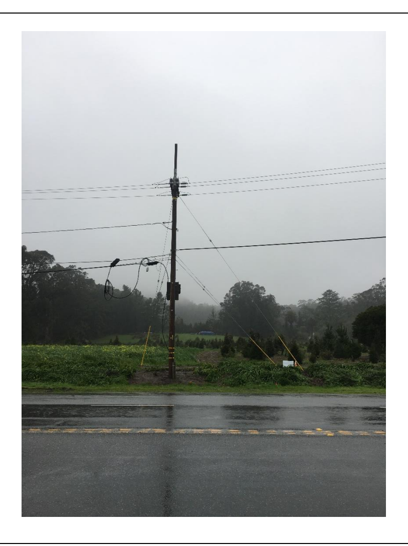
Photo 2 : Fiber-optic line remains to be connected and antennae to be installed. Air quality sign to the right of the pole.