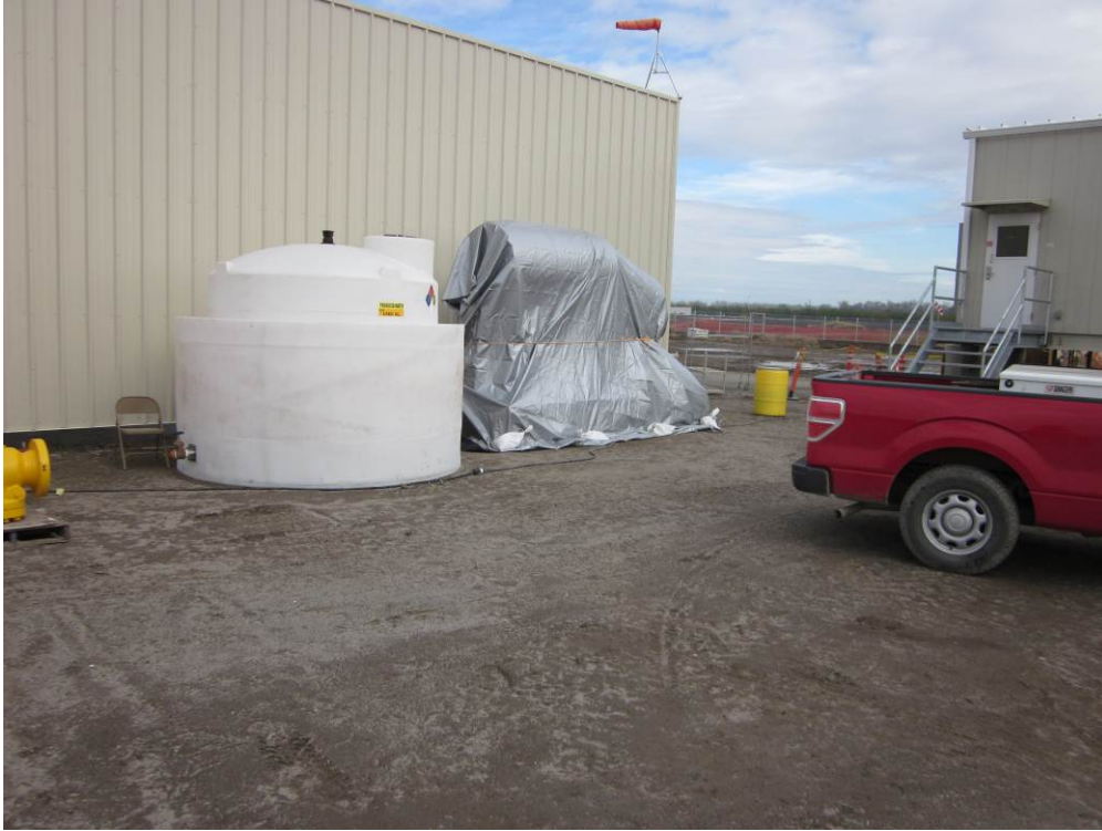
Photo 5: Liquid hazardous materials storage at the Remote Well Pad site (same location as shown in Photo 4). Secondary containment issues have been resolved following inspection by the project QSP. Tarp covering tanks has been installed in the anticipation of rain.