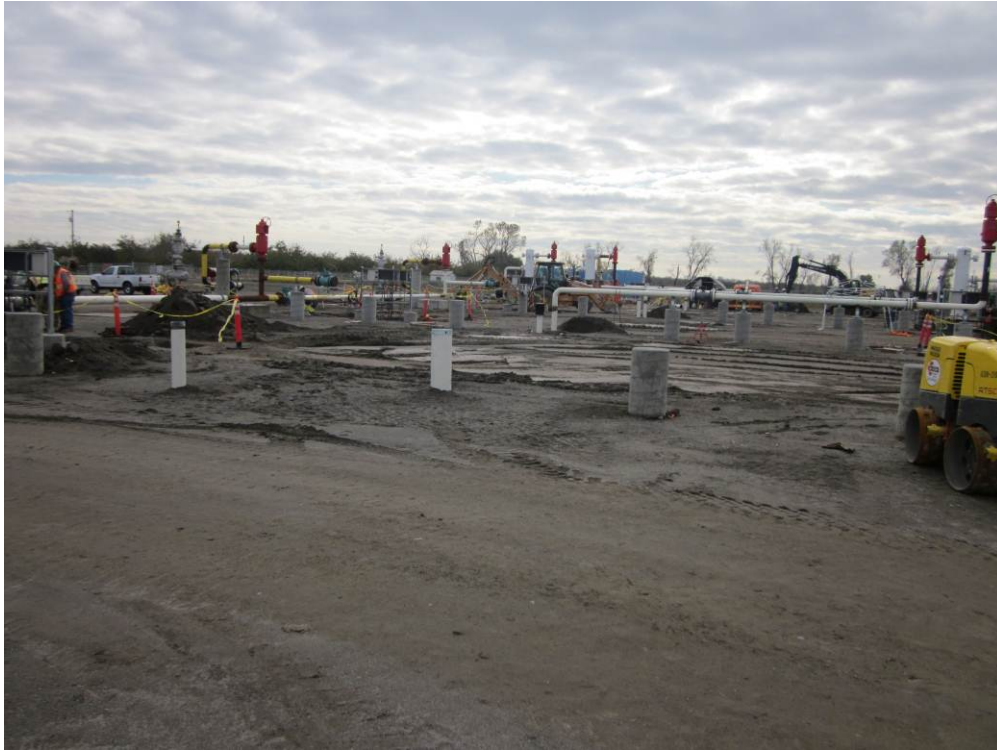
Photo 1: Trench backfilling activity for buried electrical lines and natural gas pipelines at the Remote Well Pad site.