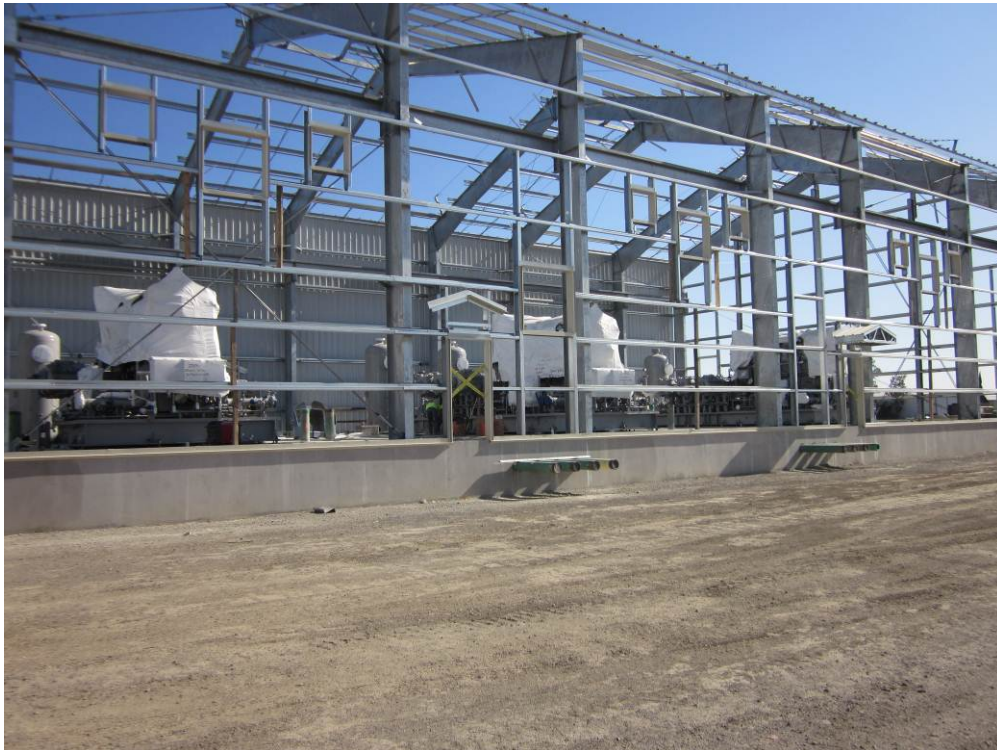
Photo 2: Three compressor engines have been lowered into and installed in the Compressor Building.