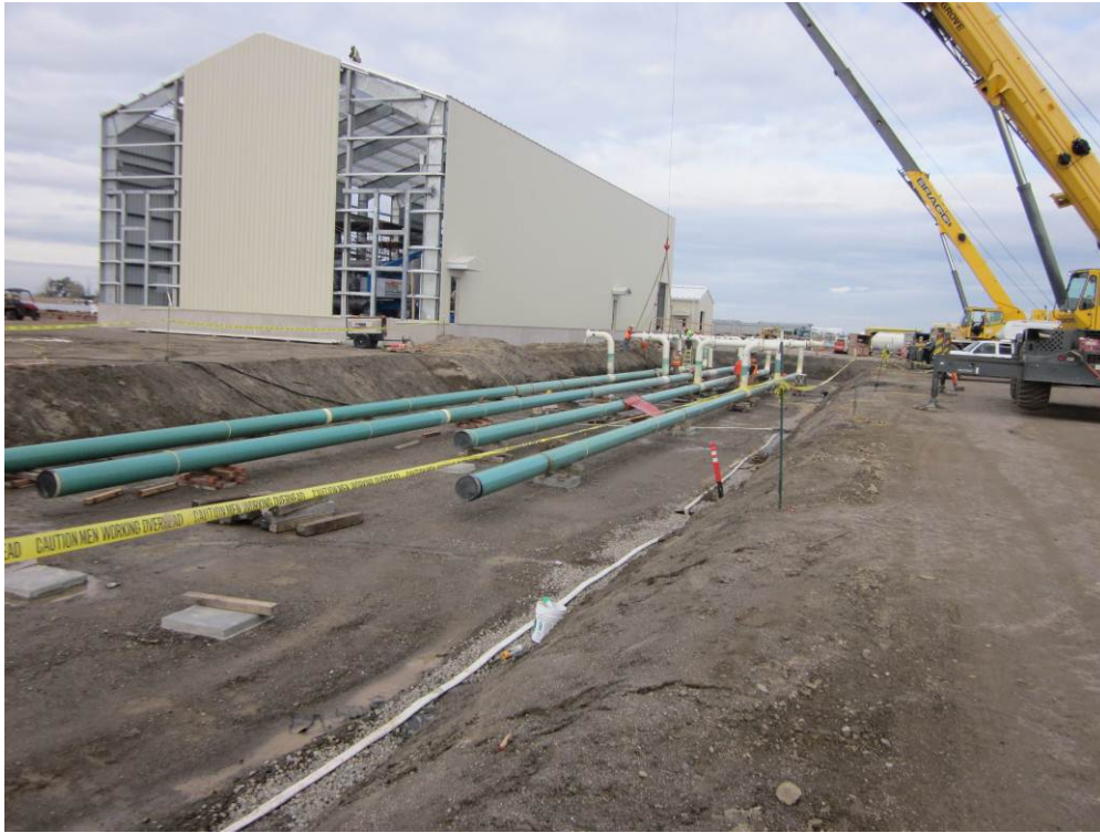
Photo 3: Excavated area immediately east of the compressor building to accommodate installation of natural gas connecting pipelines which will be connected to the compressor building.