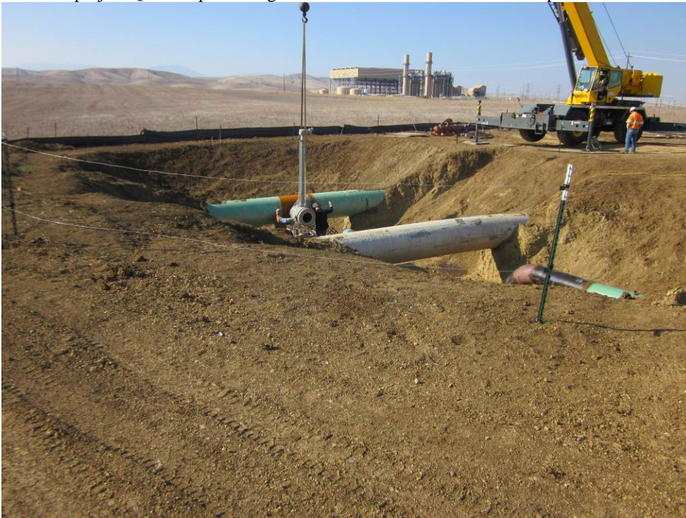
Photo 6: PG&E 400/401 Line excavated to allow for connection to the project pipeline. PG&E crews are preparing for hot-tapping the 400/401 Line.