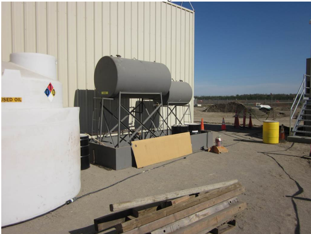
Photo 4: Liquid hazardous materials storage observed to have insufficient secondary containment at the Remote Well Pad site.