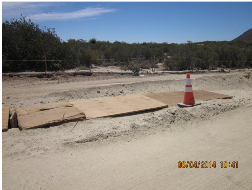
Photo 2: Trenches and excavations were observed being covered to prevent wildlife entrapment in compliance with MM-BIO-7a.