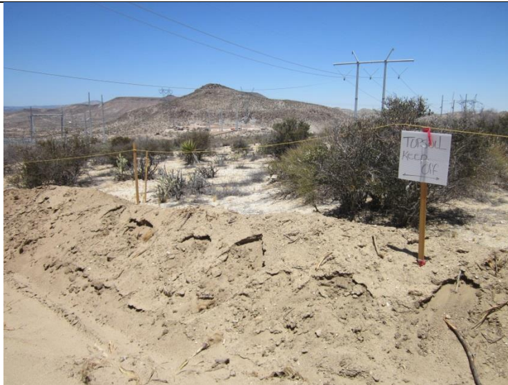
Photo 6: Topsoil salvaged during initial grading was stockpiled along slopes of the substation to be used during restoration efforts in accordance with MM-BIO-1d and the Habitat Restoration Plan.