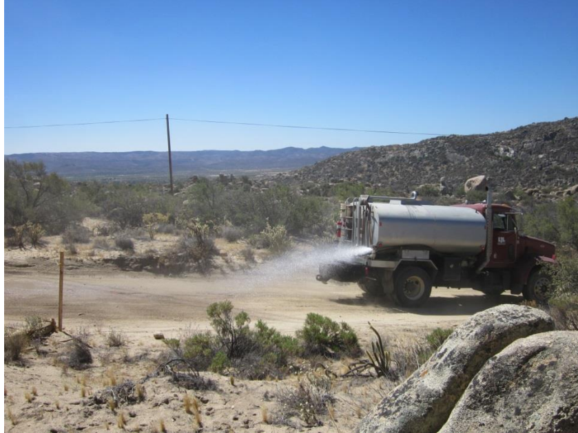
Photo 3: Dust control measures including diligent watering during rough grading and access road maintenance were observed being implemented in accordance with MM-AQ-1 and MM-BIO-4a.