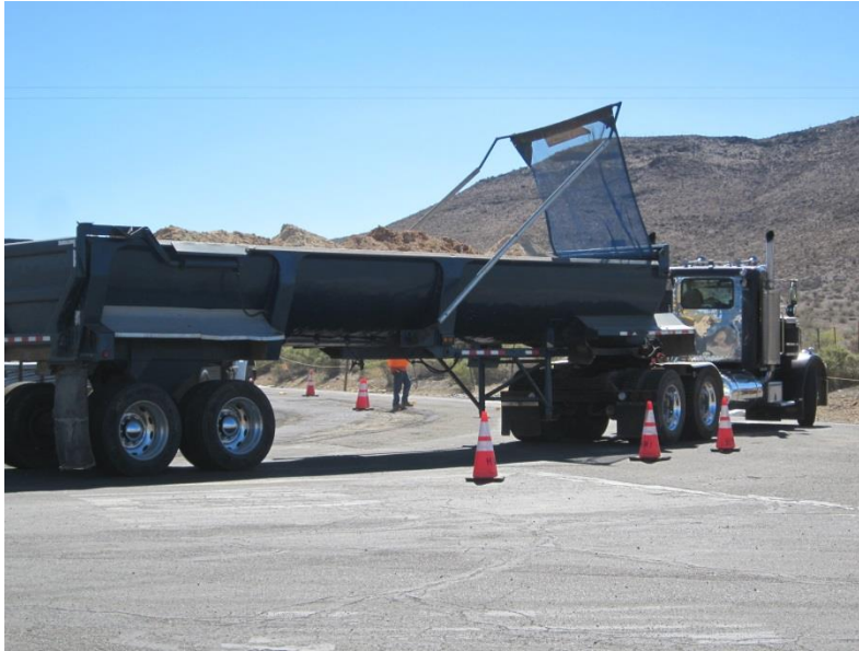
Photo 1: Trucks used during spoil removal associated with excavation were observed actively covering loads prior to entering publicly accessed roads in accordance with the Project SWPPP and MM-BIO-4a and MM-AQ-1.