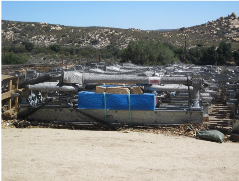
Photo 5: In compliance with BIO7j and in an attempt to reduce the risk of nesting bird settlement, staged equipment were observed being covered with thin netting so as to avoid bird or wildlife settlement or entrapment.