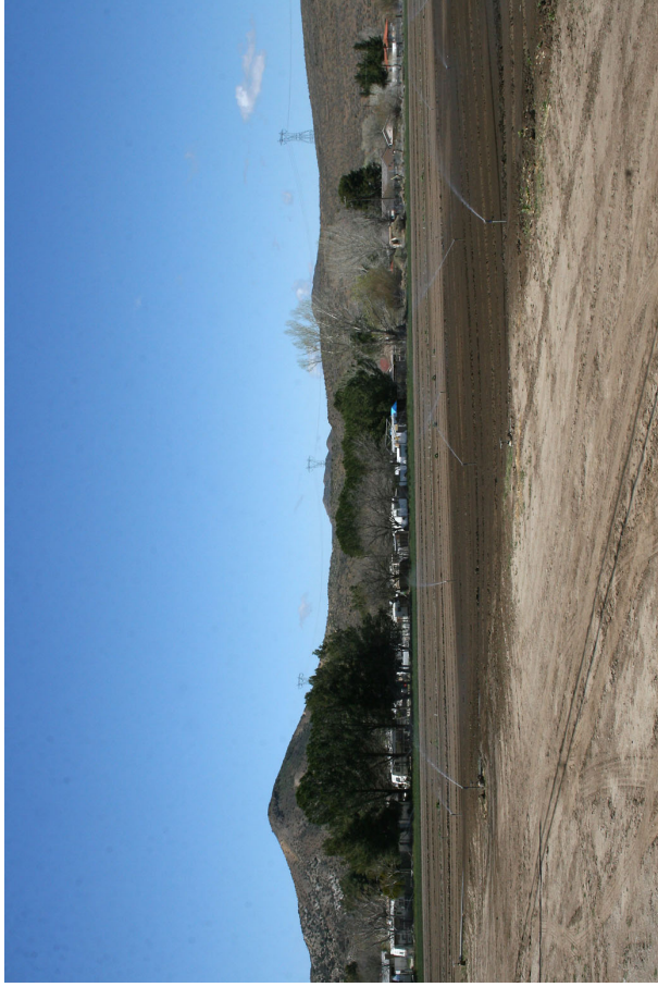
17. Old Highway 80 east of Jacumba looking northwest