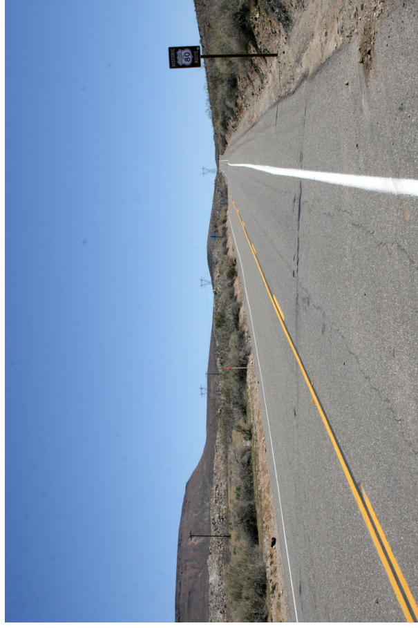
11. Old Highway 80 looking northeast