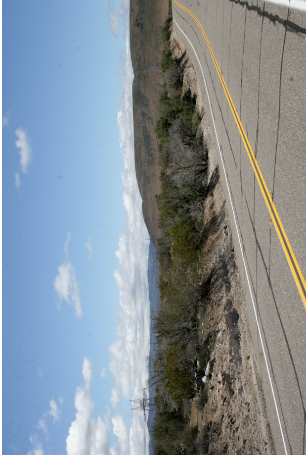
5. Old Highway 80 looking south toward substation site