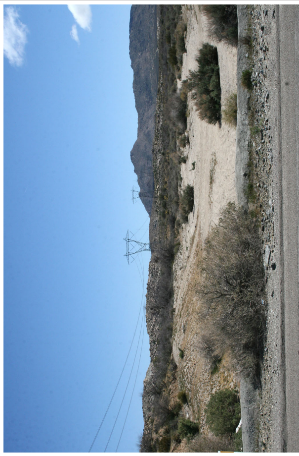
12. Carrizo Gorge Road looking east