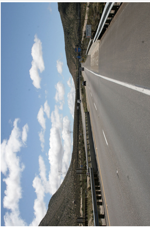
2. I-8 westbound at In-Koh-Pa exit looking southwest