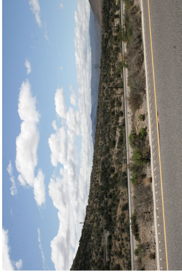
3. I-8 westbound looking south toward substation site