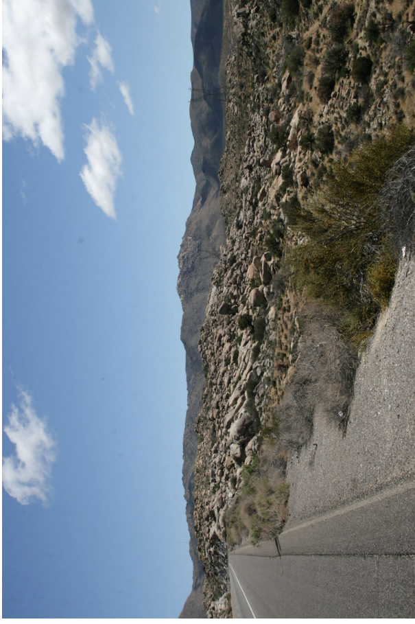
13. I-8 eastbound looking southeast