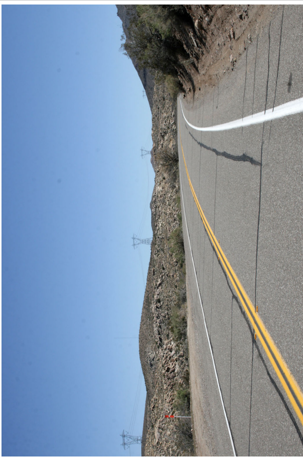
10. Old Highway 80 looking northeast