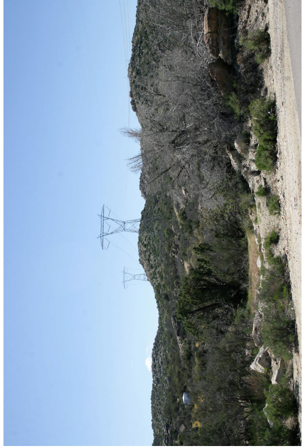
23. Old Highway 80 looking west