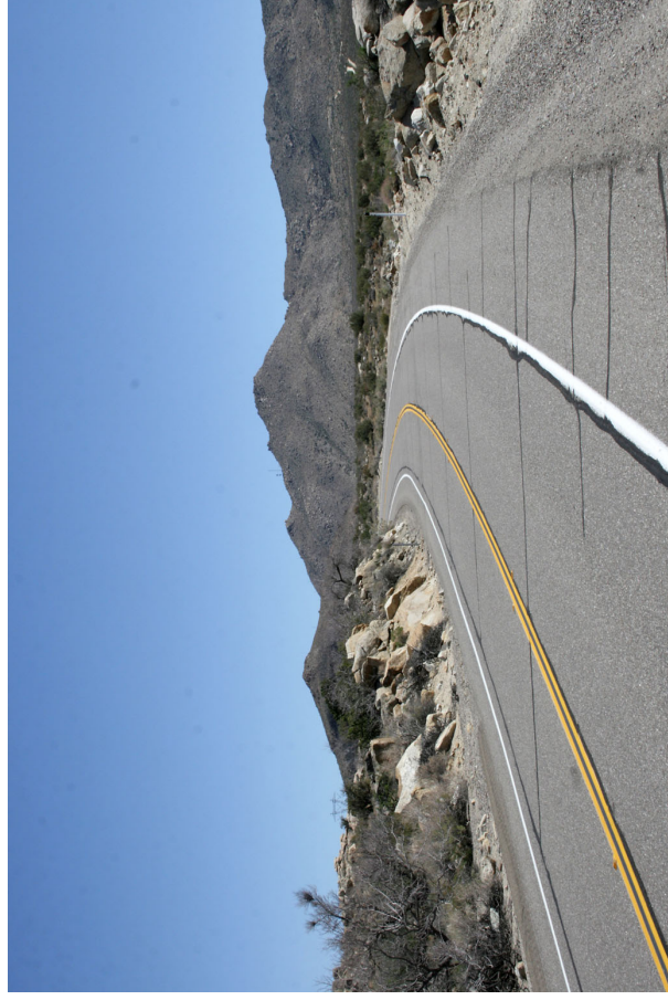
8. Old Highway 80 looking east toward substation site