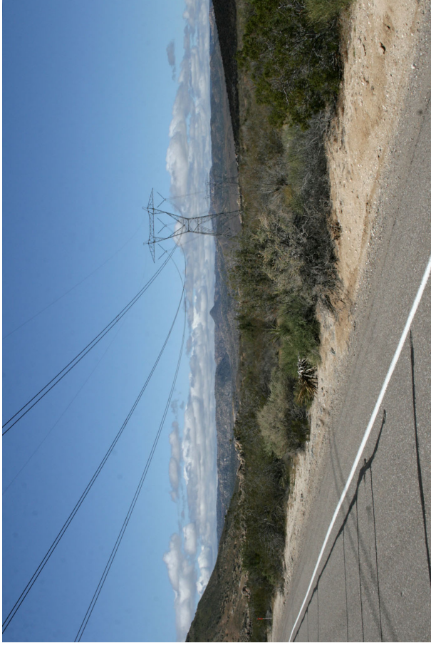
9. Old Highway 80 looking west