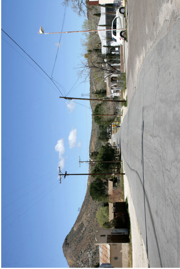
18. Old Highway 80 in Jacumba looking north*