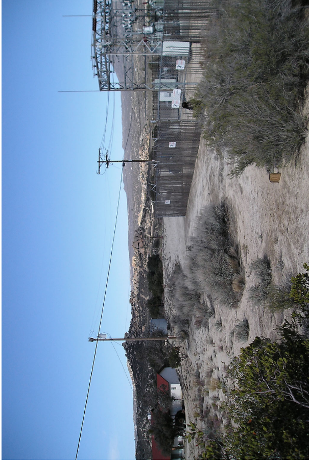
29. Boulevard Substation looking northwest