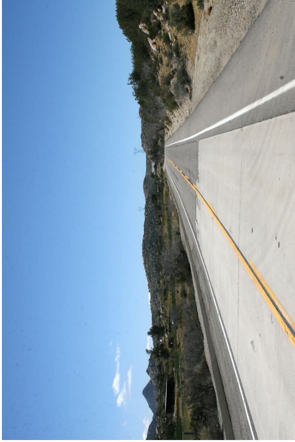
21. Old Highway 80 looking northwest