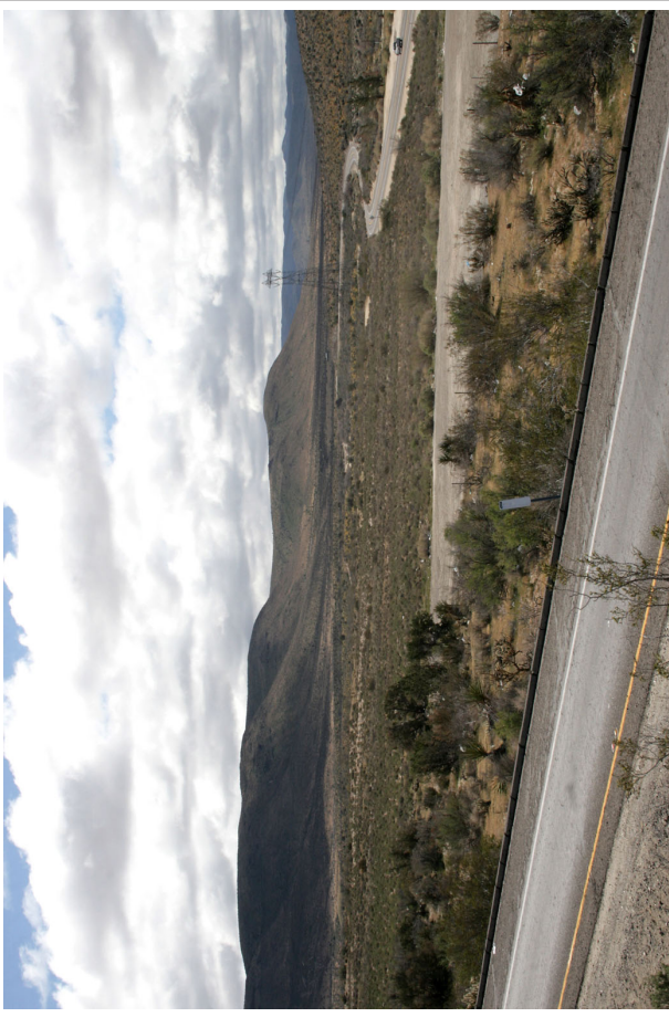
14. I-8 eastbound at Jacumba exit looking south*