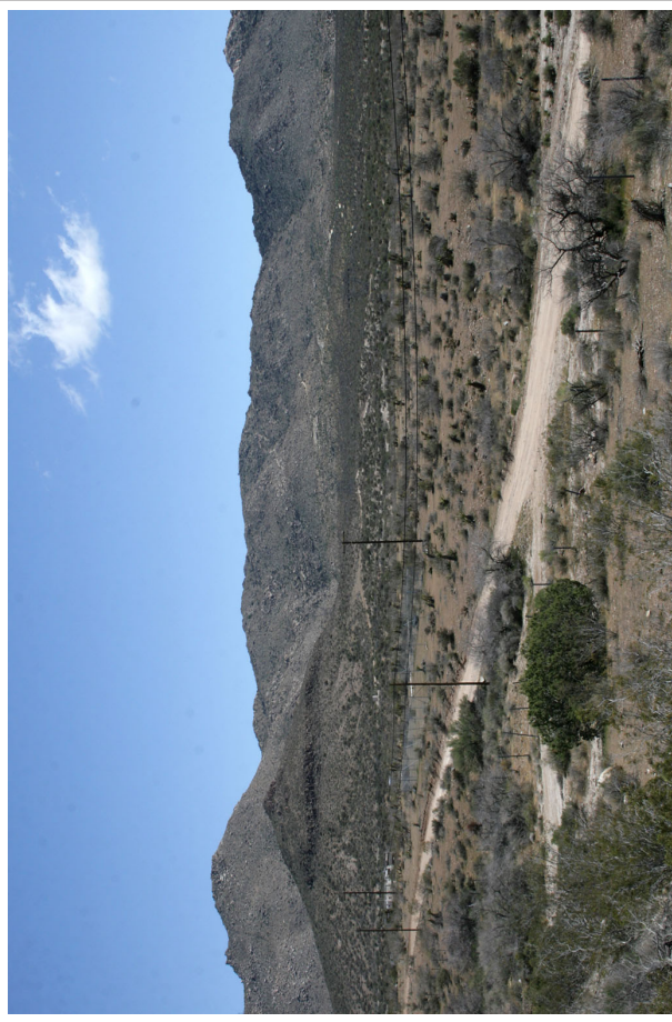
4. I-8 eastbound looking southeast toward substation site*