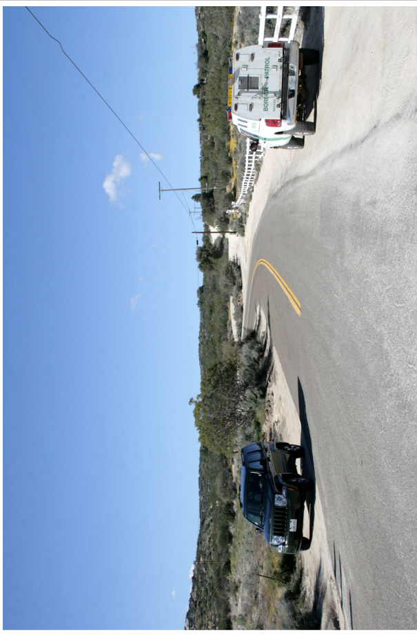
26. Jewel Valley Road looking north*