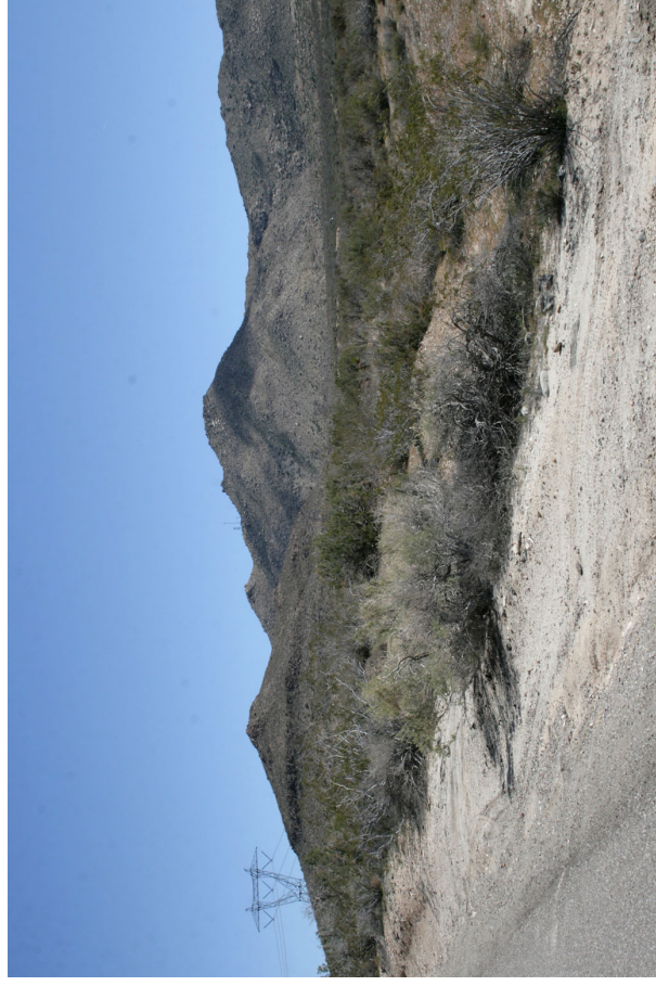
7. Old Highway 80 looking east toward substation site*