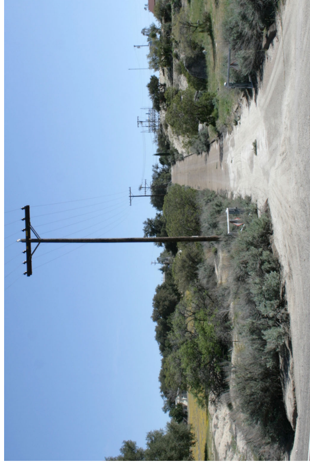
31. Old Highway 80 looking south toward Boulevard Substation*