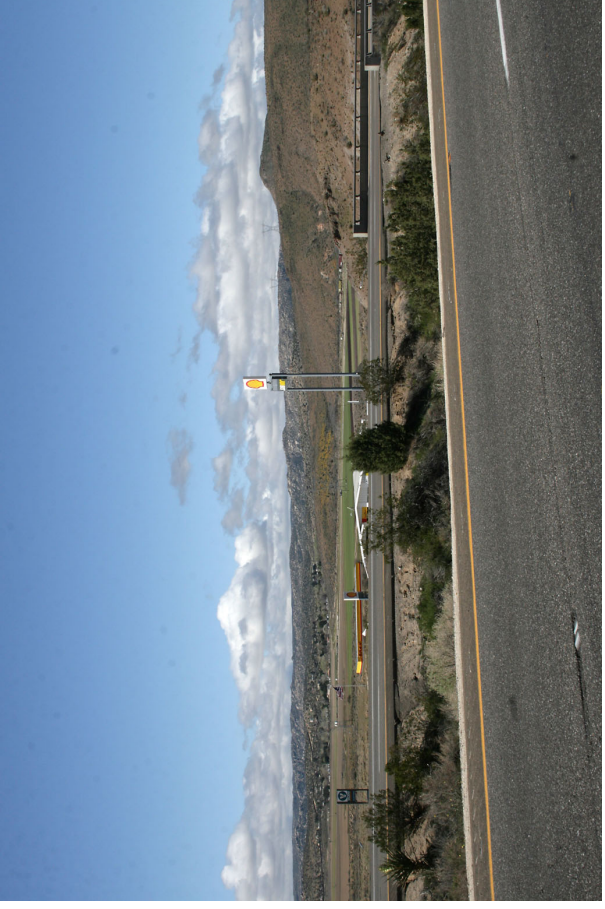
15. I-8 westbound near Jacumba exit looking southwest