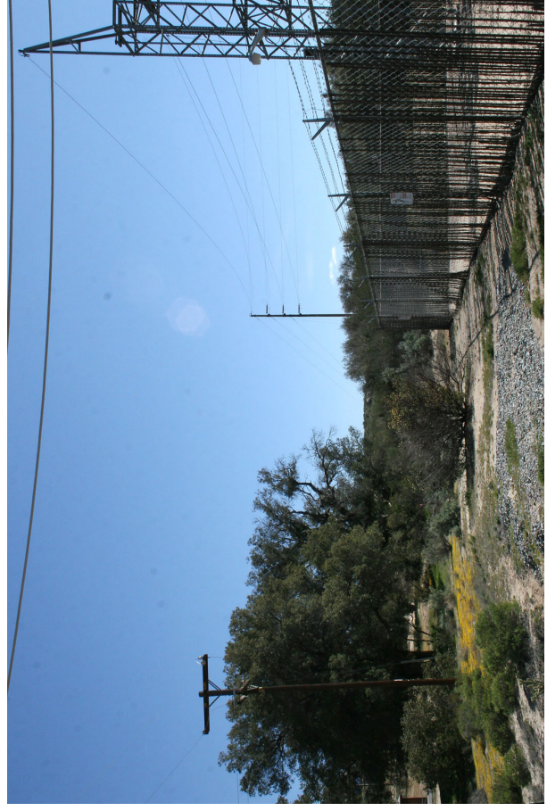
27. Boulevard Substation looking south