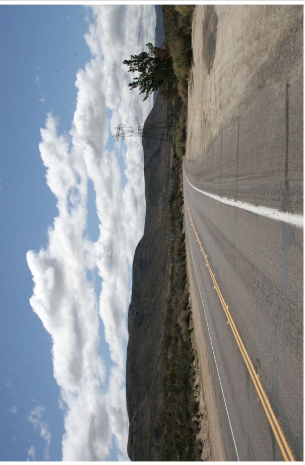
16. Carrizo Gorge Road looking southeast