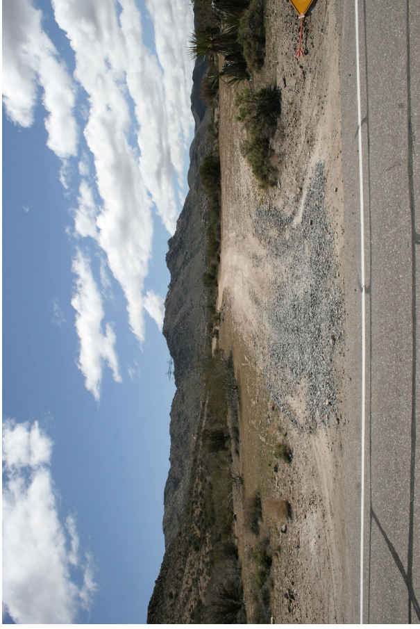
6. Old Highway 80 looking south at substation site entry