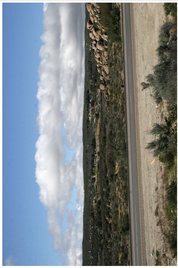
28. I-8 westbound looking southwest