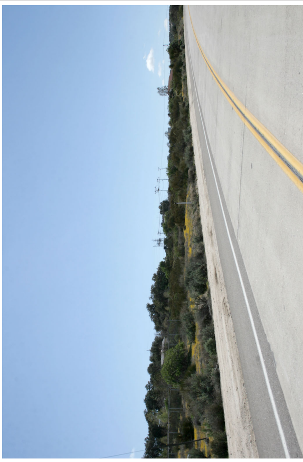
30. Old Highway 80 looking southwest toward Boulevard Substation*