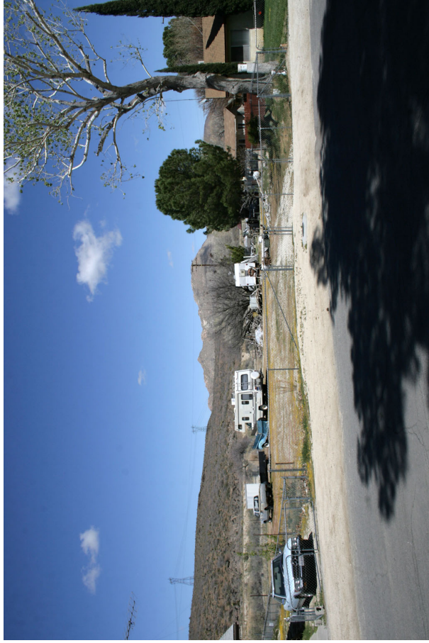
19. Seeley Avenue in Jacumba looking northeast