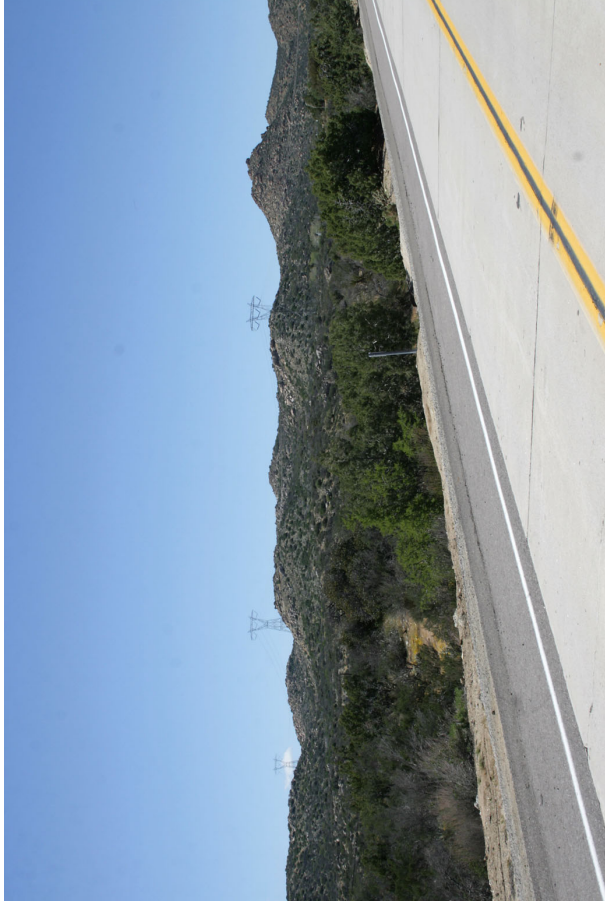
22. Old Highway 80 looking northwest*