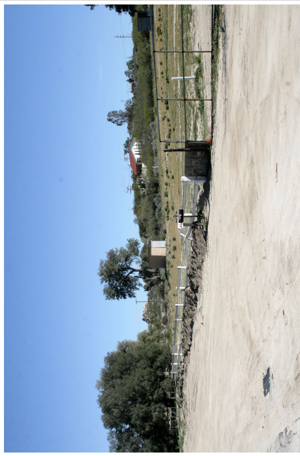
32. Old Highway 80 looking southeast toward Boulevard Substation