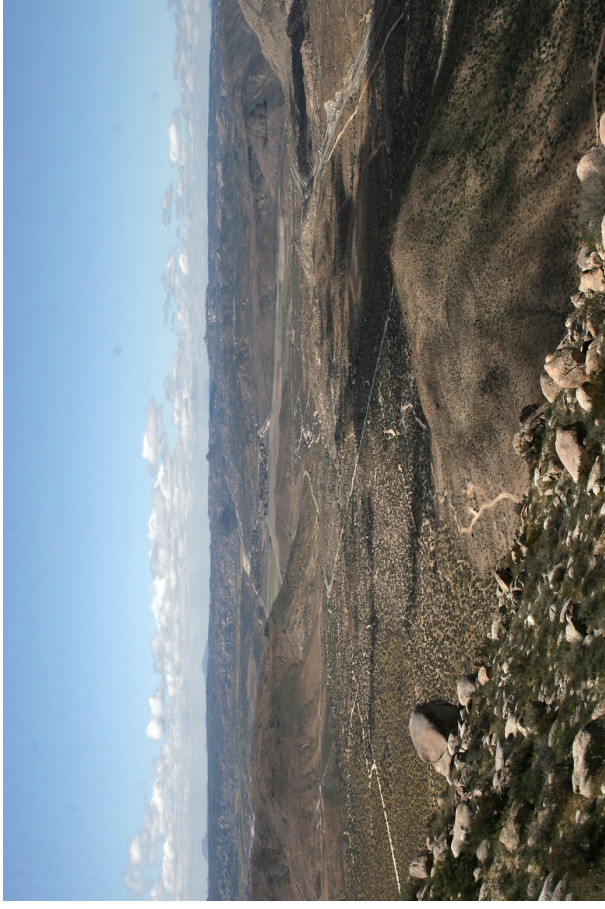
1. Nopal Peak in Jacumba Mountain Wilderness looking west