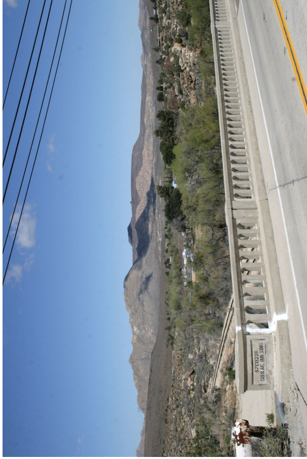
20. Old Highway 80 west of Jacumba looking northeast