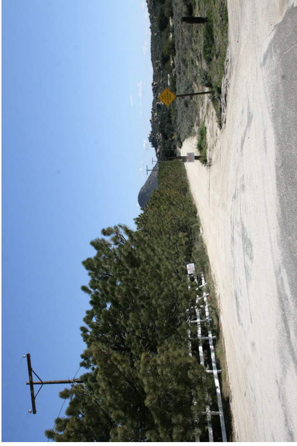
25. Jewel Valley Road looking south