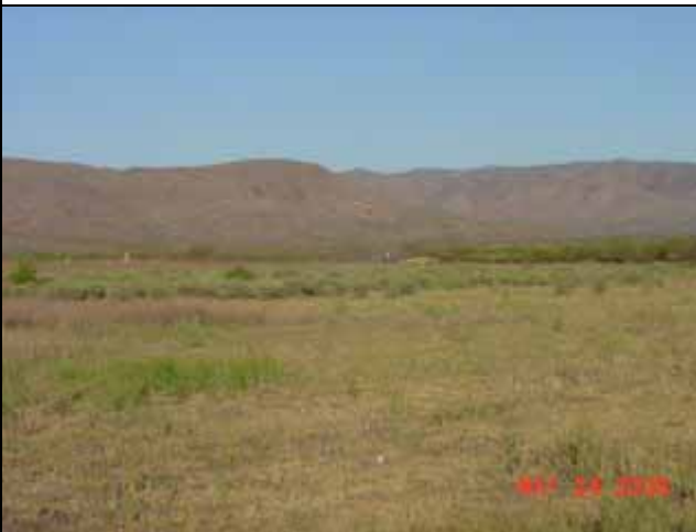
Landforms of mesa and adjacent mountains provide vertical relief in contrast to relatively level adjacent lowlands. Little or no variety and contrast in vegetation.