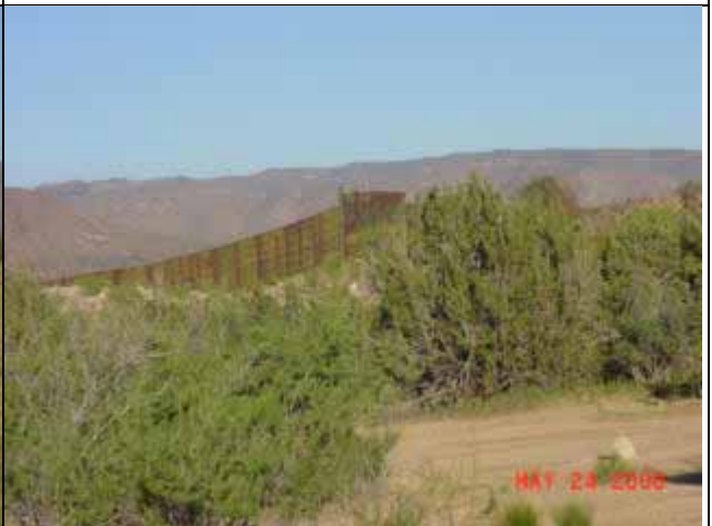
Metal border fence extends along southern tip of the mesa, partially up the mesa slopes.