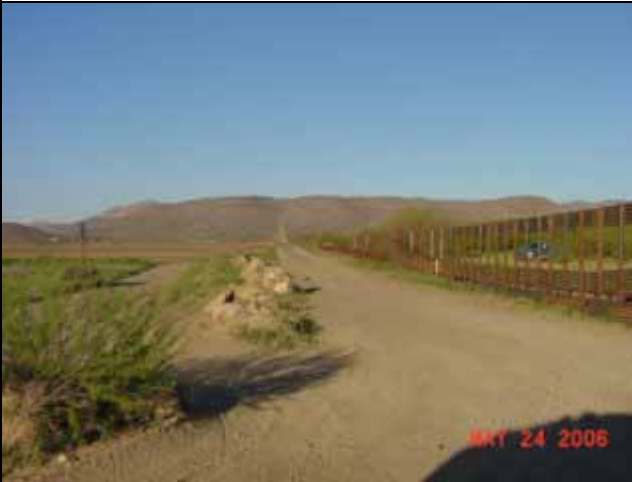
Rounded form of mesa rises from adjacent agricultural lands; graded road along International Border has a strong linear form and moderate to high visual contrast with adjacent undisturbed hillslopes. Metal border fence extends along southern tip of mesa, partially up the mesa slopes.