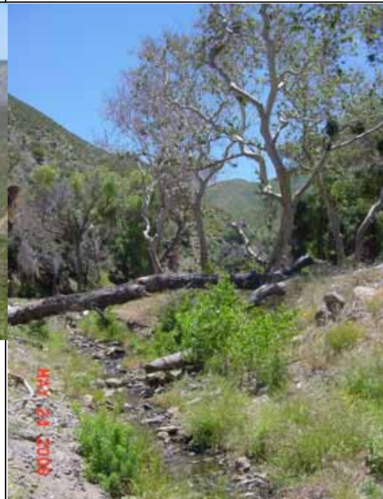
Large trees and intermittent flow along drainages are visually attractive and result in increased biodiversity and enhanced scenic quality.