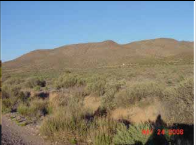
Vegetation of mesa and adjacent lowlands is relatively uniform in texture and color, with subtle differences in muted tones noticed at closer viewing range.