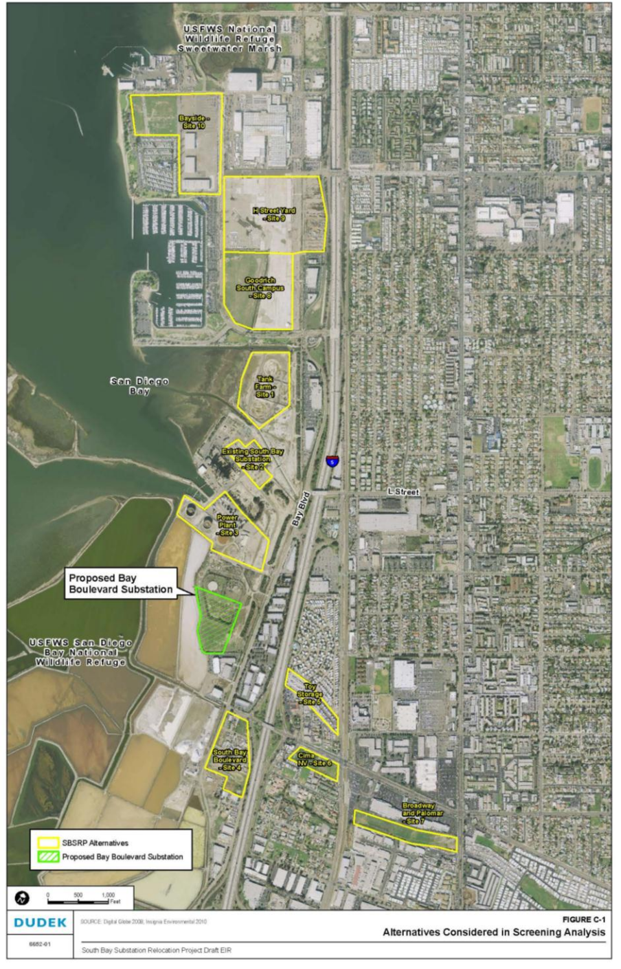
SDG&E Silvergate Transmission Substation Project - Informational Meeting