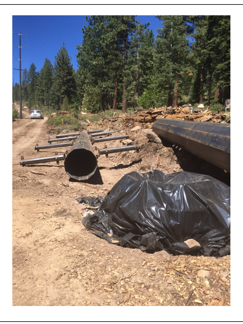
Photo 1 : Pole top and bottom staged in ROW, poured concrete pole base covered. Approved work area flagged (APM-BIO-26).