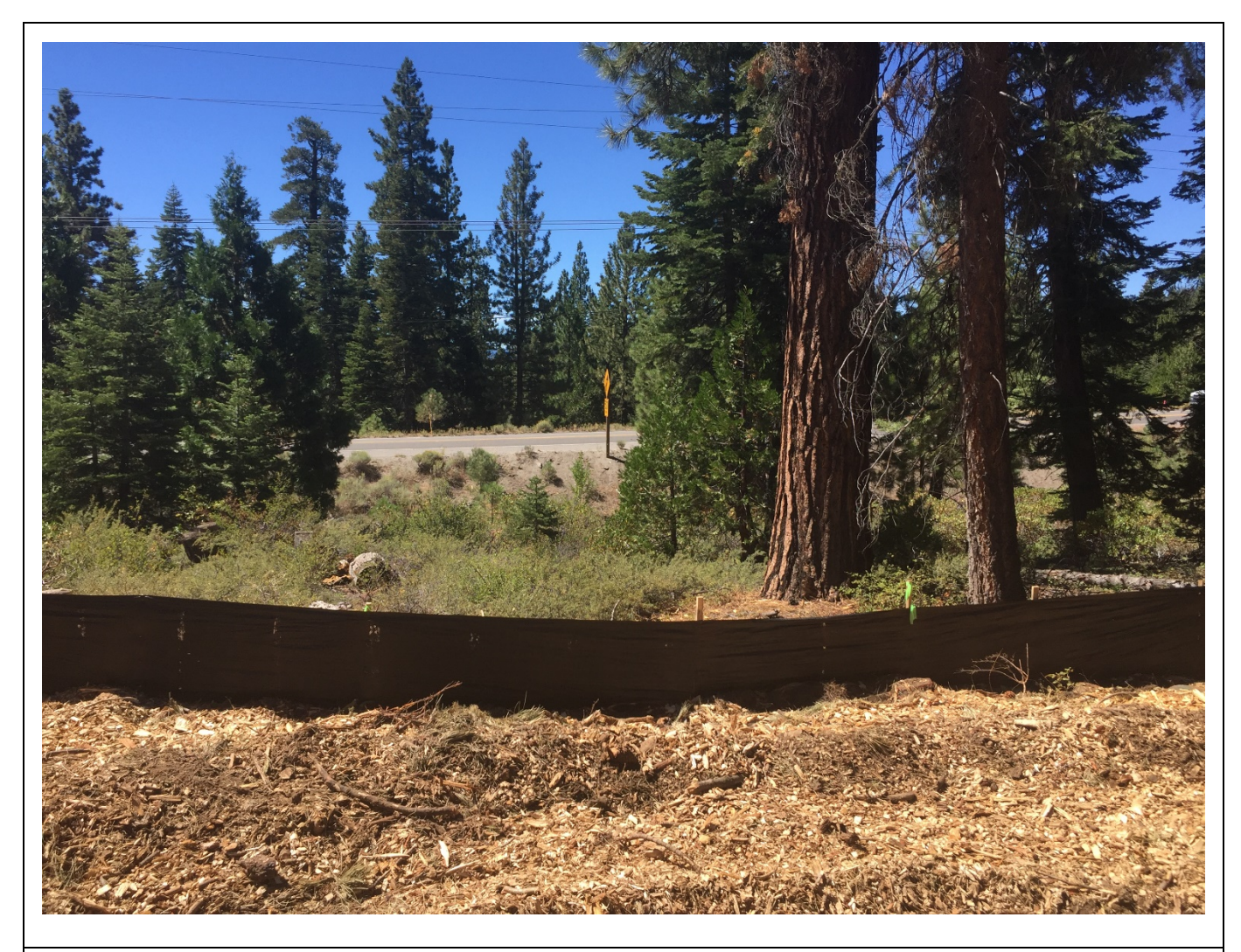
Photo 2: BMPs (silt fence) installed between ROW and Highway 267 (APM-SOILS-1).