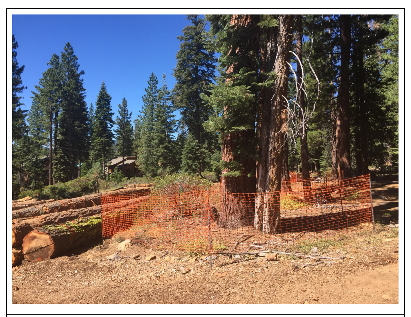
Photo 3 : Tree protection fencing installed within Lake Tahoe Basin.