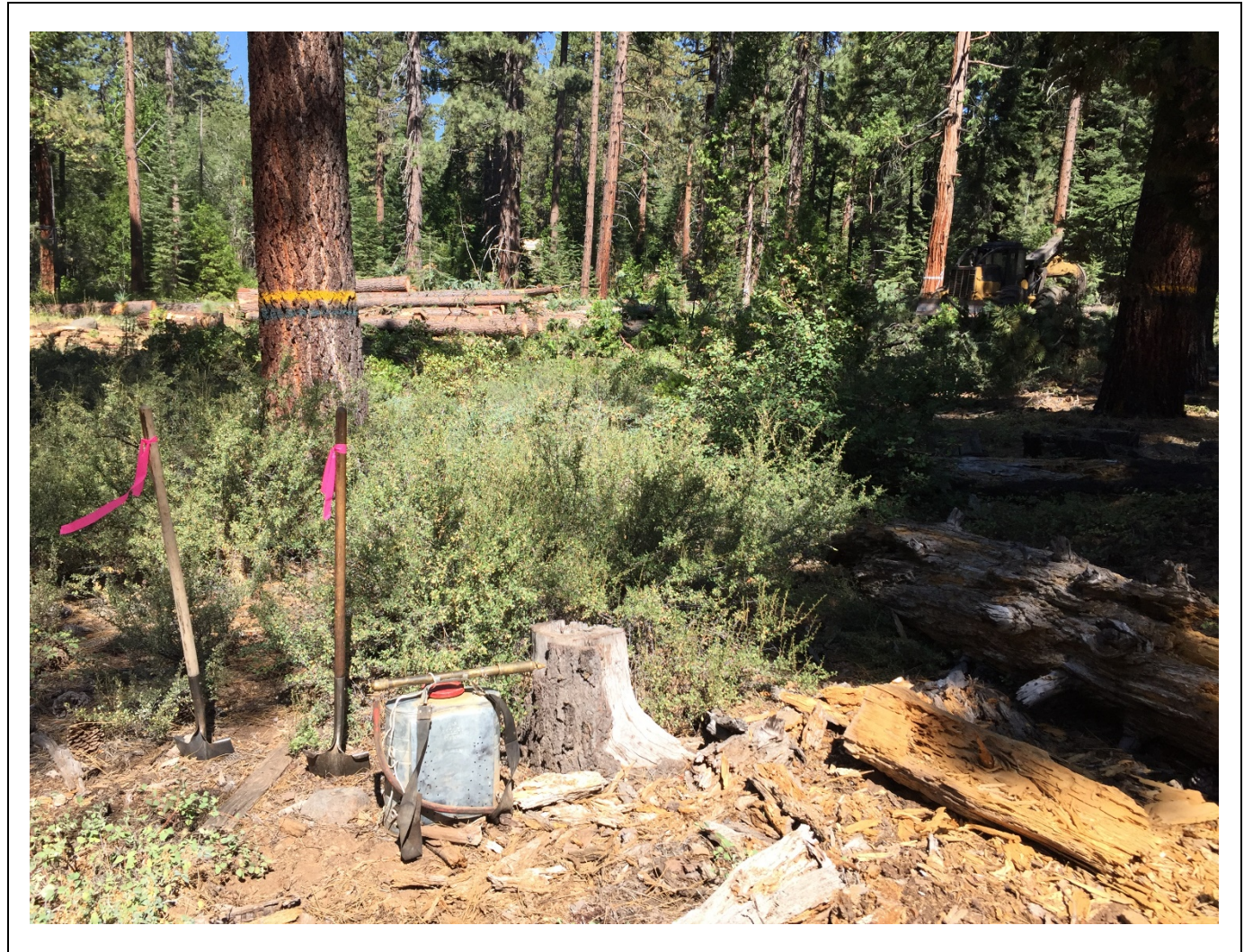
Photo 5: Firefighting equipment on site for timber operations, in accordance with APM-HAZ-6.