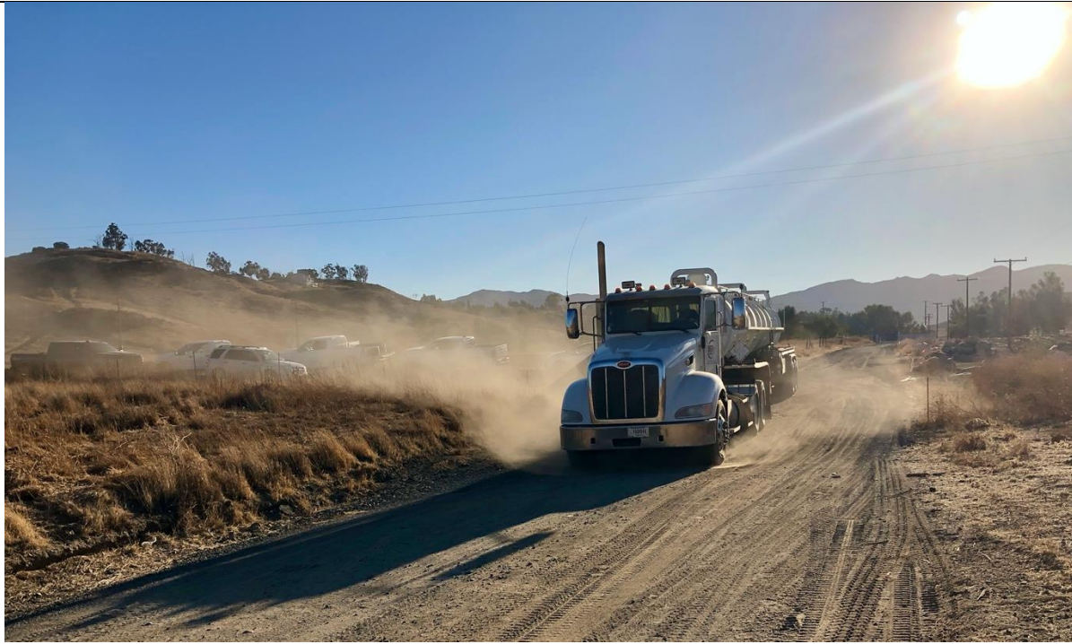
Photo 9 – Dusty conditions around TSPs 408 and 409. Photo facing west