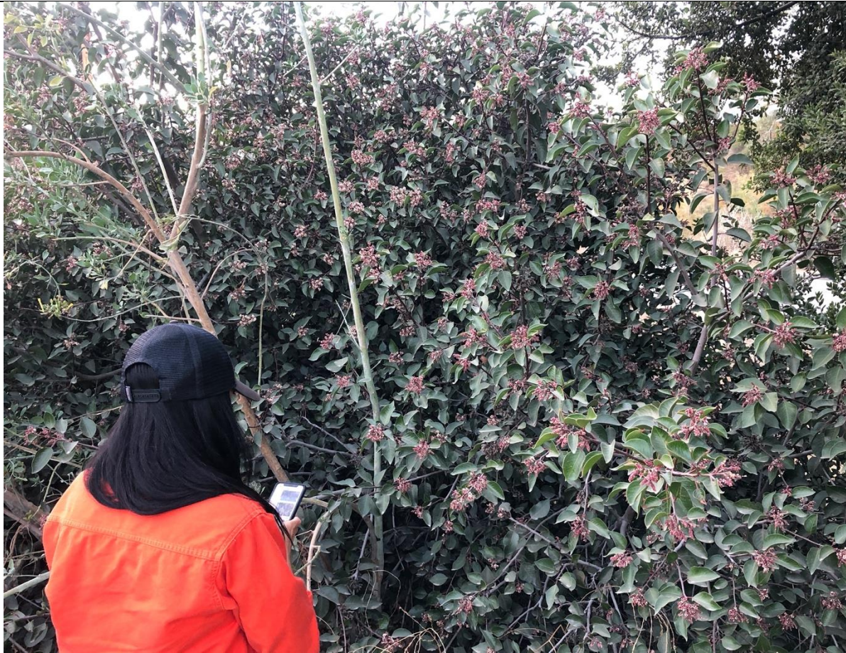
Photo 11 – The LEI evaluating the native vegetation near a TSP location at the IvyGlen substation.