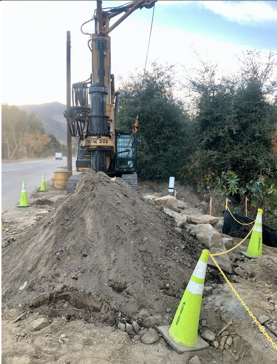
Photo 10 – Drilling operation across the street from the IvyGlen substation. Photo facing northwest