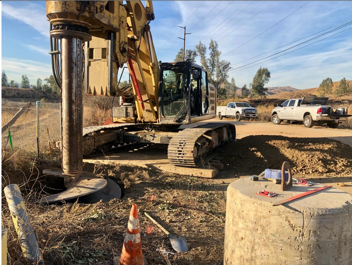
Photo 7 – Partial drilling operation at TSP 450. Photo facing north