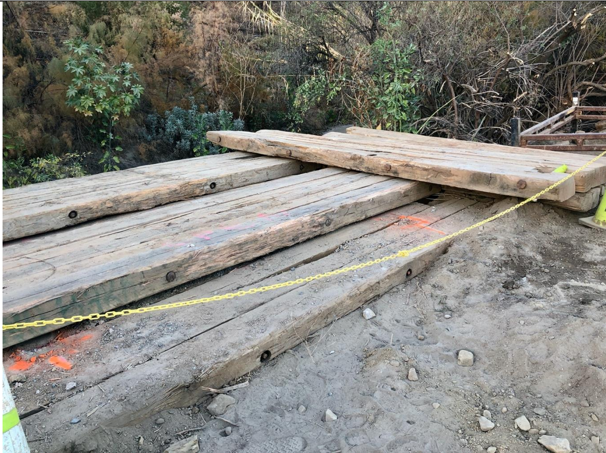
Photo 11 – Wooden matting covering the partially drilled foundation hole.