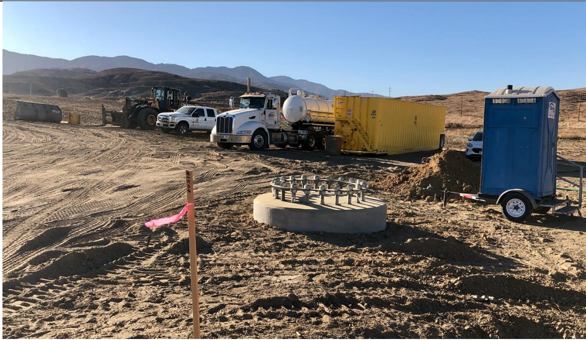
Photo 6 – Staging area and pulling station near the newly poured TSP 408. Photo facing northwest