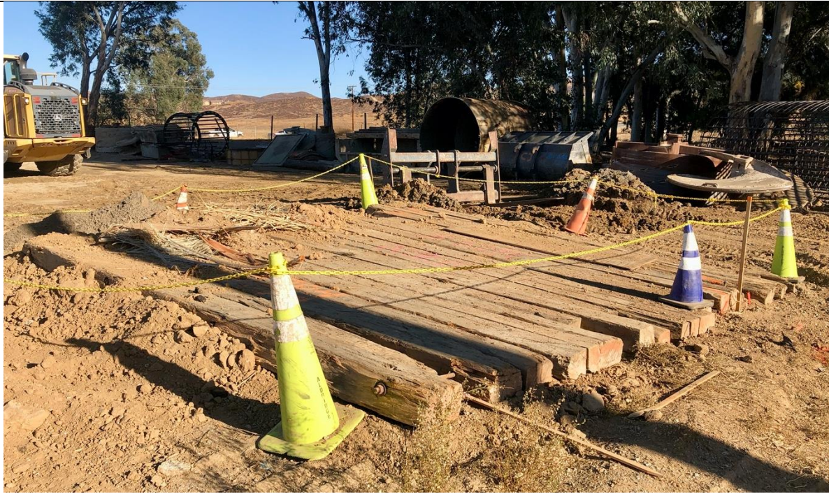
Photo 5 – Wooden mats covering the partially drilled foundation hole for TSP 333. Photo facing south