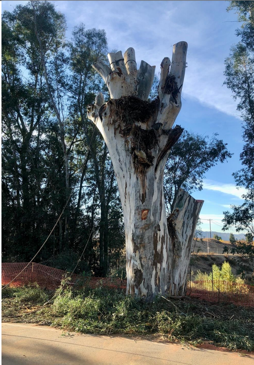
Photo 4 – Eucalyptus trees being trimmed and removed along Segment 5 near TSPs 449 and 450. Photo facing northwest