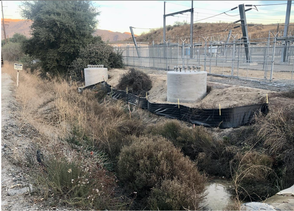
Photo 9 – New TSP foundations adjacent to the IvyGlen substation. Photo facing south