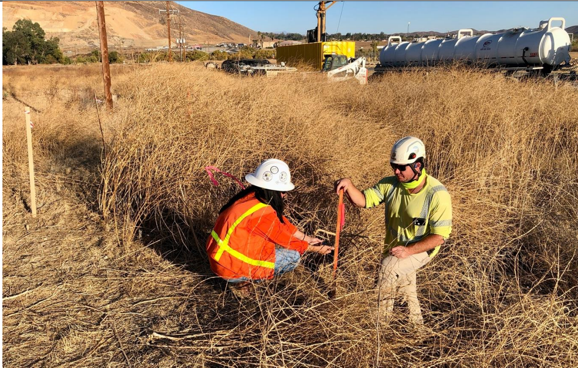
Photo 10 – The LEI and a drilling foreman discussing the impacts from work to be done at TSP 412E. Photo facing southeast