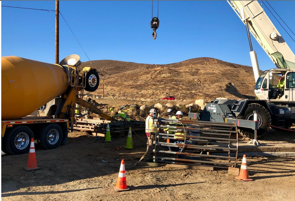
Photo 8 – Installation of the anchor bolt cage at TSP 409. Photo facing northeast