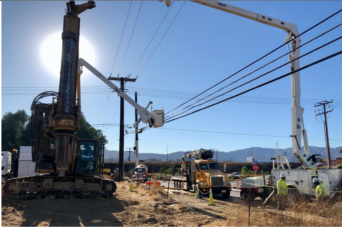
Photo 4 – Crews preparing to drill the foundation hole at TSP 330. Photo facing west