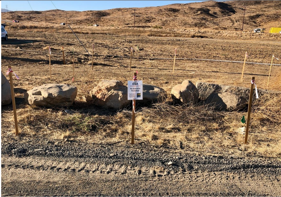
Photo 7 – A staked off area of botanical sensitivity between TSPs 408 and 409. Photo facing northeast