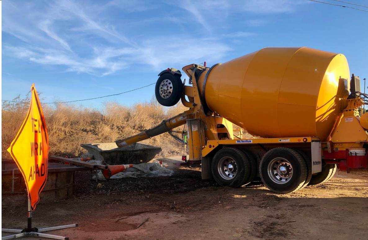
Photo 6 – Concrete washout station for the work at TSPs 449 and 450. Photo facing southwest