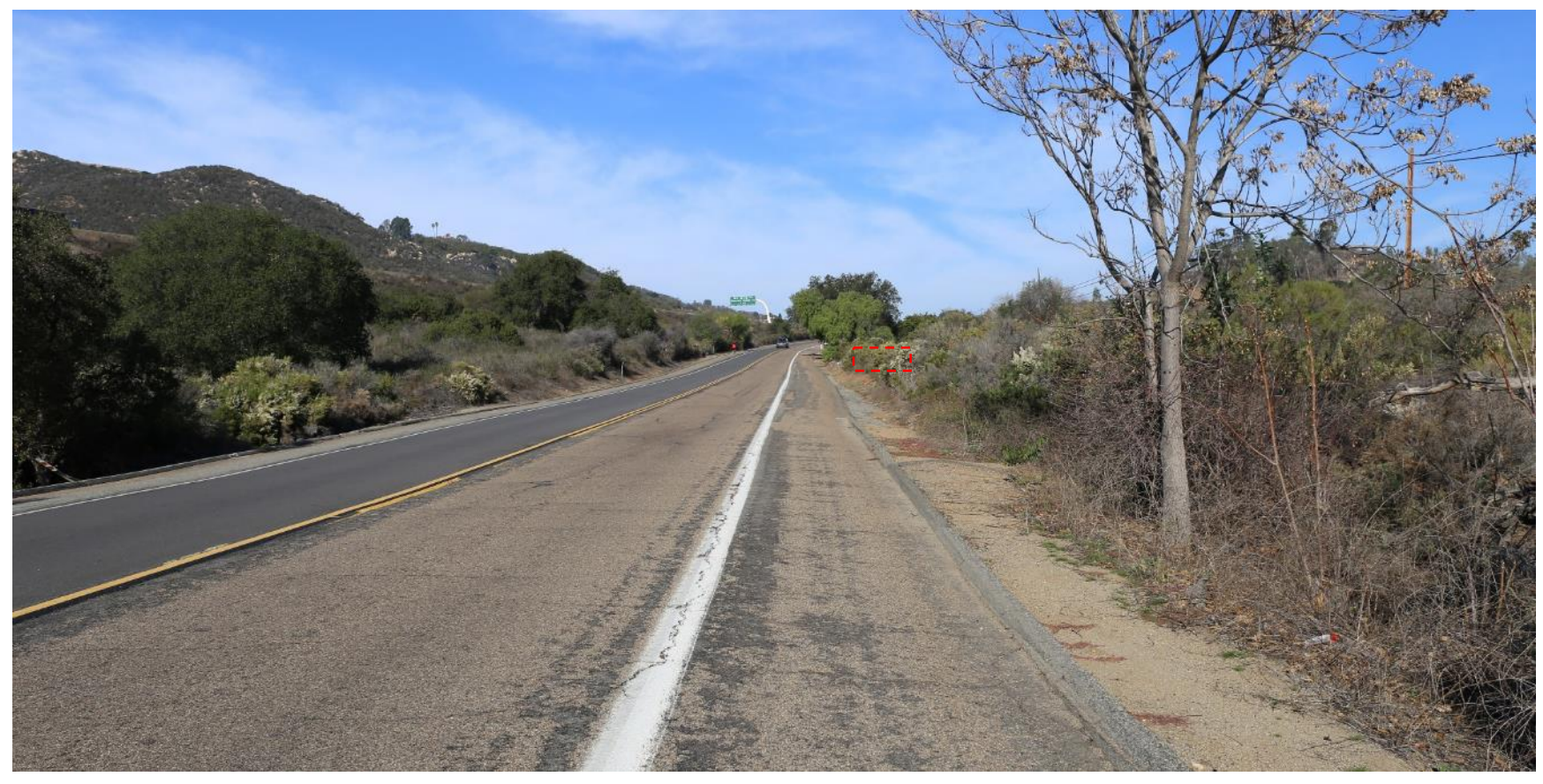
Photograph 21 : View looking north-northwest toward the location of MLV 5 along North Centre City Parkway near approximate MP 20.1. The MLV is depicted by the red box. Small- and medium-sized shrubs within the workspace are expected to be removed at this location. The remaining shrubs to the north and south of the MLV that are outside of the workspace will limit views of the MLV.