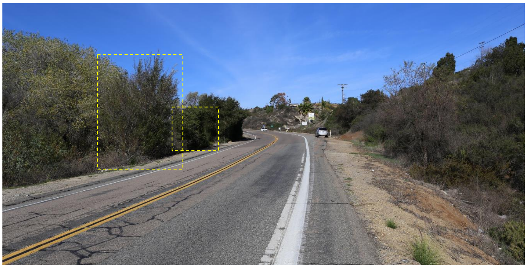
Photograph 15 : View looking northeast toward the location of the proposed Horizontal Directional Drill (HDD) 2 exit point, along Old Highway 395 near MP 12.1. The yellow boxes depict the areas where vegetation will be removed. The ROW is only visible to vehicles for a short time due to the terrain and curvature of the roadway.