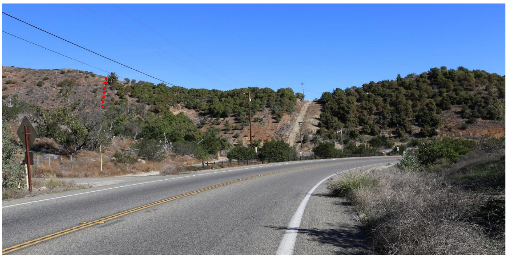
Photograph 6 : View looking northeast from Mission Road of the Proposed Project ROW near approximate MP 3.9. The ROW, which is depicted by the red line, will only be visible for a short period of time while driving along Mission Road. The view of the alignment is limited by trees in the foreground and the road turning away from the site.