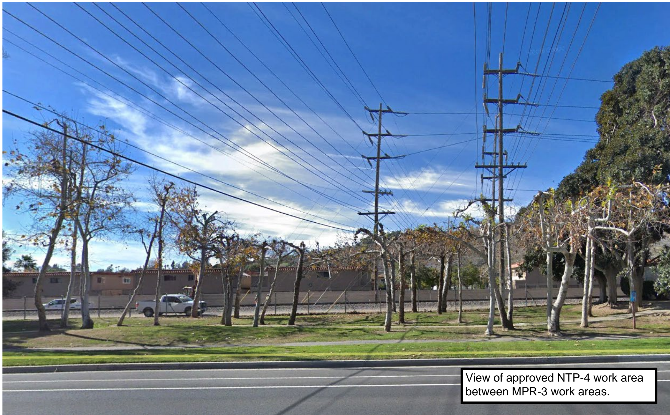
View of approved NTP-4 work area between MPR-3 work areas.