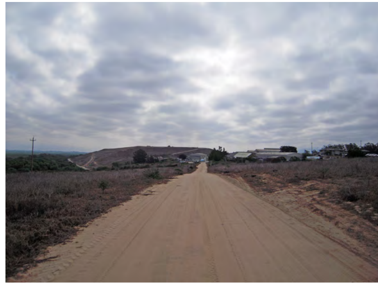
Photo 2. Southeast-facing view from site of proposed MPWSP Desalination Plant (right) toward the Monterey Regional Environmental Park (ESA, 2013).