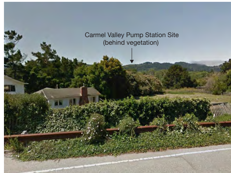
Photo 8. South-facing view of Carmel Valley Pump Station site (ESA, 2014).