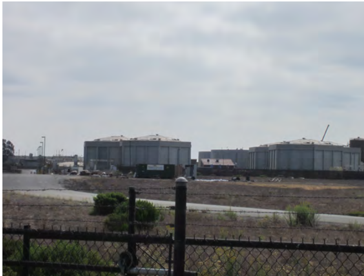
Photo 3. East-facing view from Charles Benson Road entrance to Monterey Regional Water Pollution Control Agency's Wastewater Treatment Plant site (ESA, 2013).