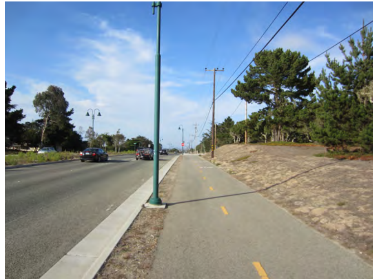
Photo 4. Northeast-facing view along General Jim Moore Boulevard of the proposed ASR injection/extraction wells site.