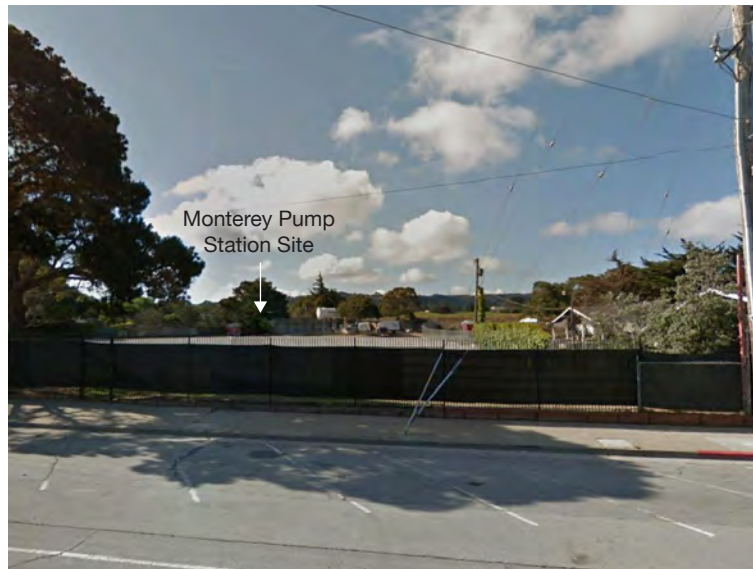
Photo 7. South-facing view of Monterey Pump Station site.