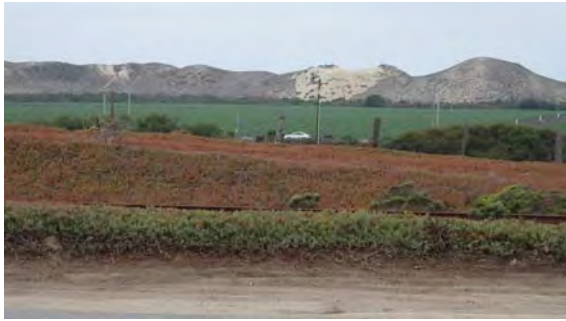
AG & Coastal Dunes