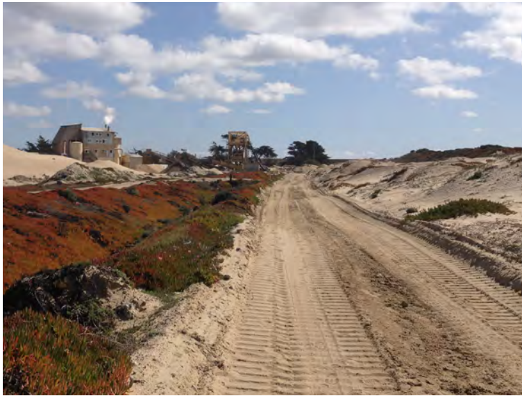
Photo 1. East-facing view of the CEMEX sand mining facility from beach access road (ESA, 2013).