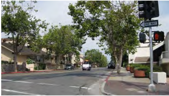
PL Urban Builtup Monterey