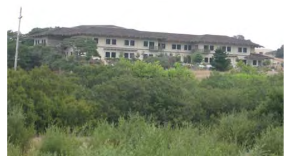
Riparian and Built up