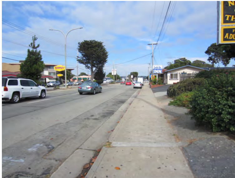
Photo 5. East-facing view of Fremont Street along new Monterey Pipeline alignment (ESA, 2013).