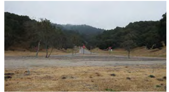
TF Forested Hills