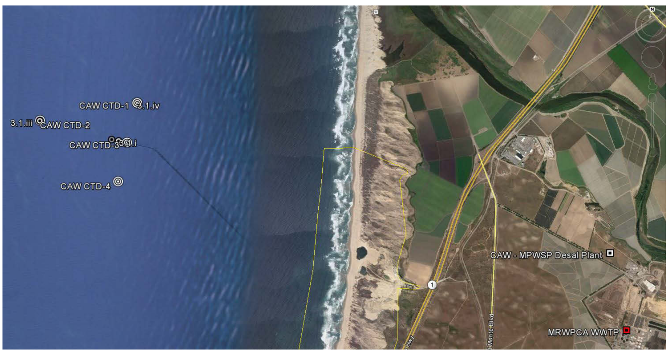
Figure 1 – Overall View