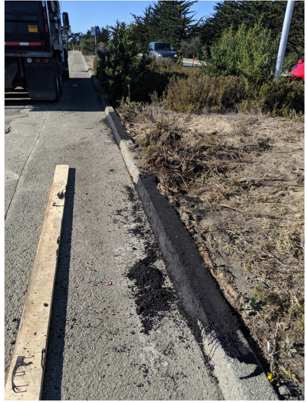
Dike was repaired at the intersection of Lightfighter and GJM