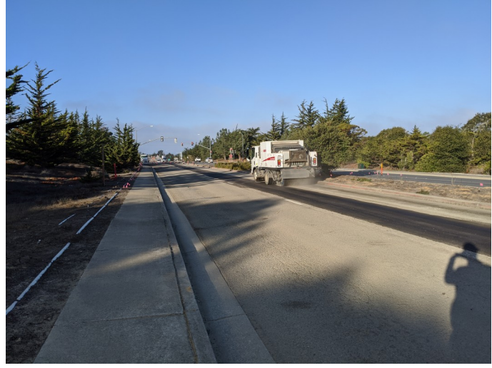
street sweeping of Lightfighter ave, facing W