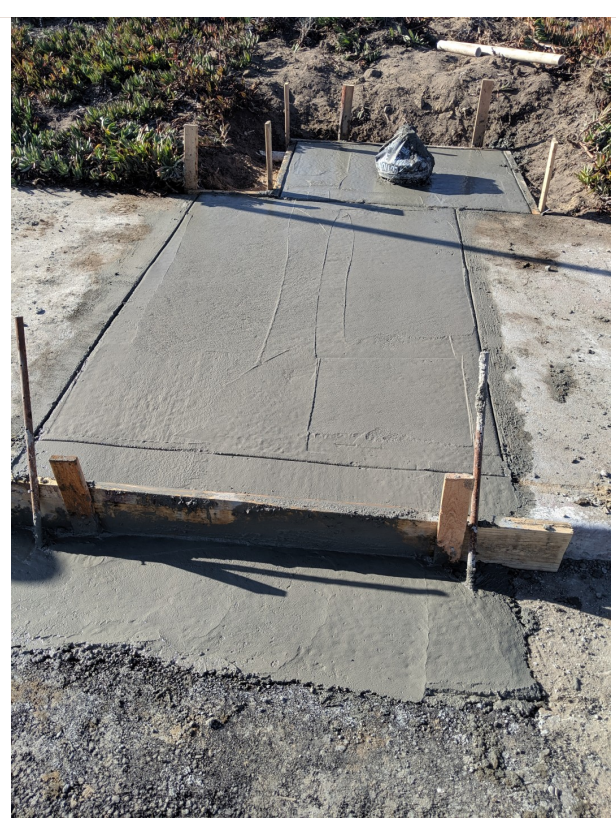
Concrete for air valve across the fire station on GJM.

Afternoon was spent pouring concrete for the air and blow valves and the sweeper was run in the morning.