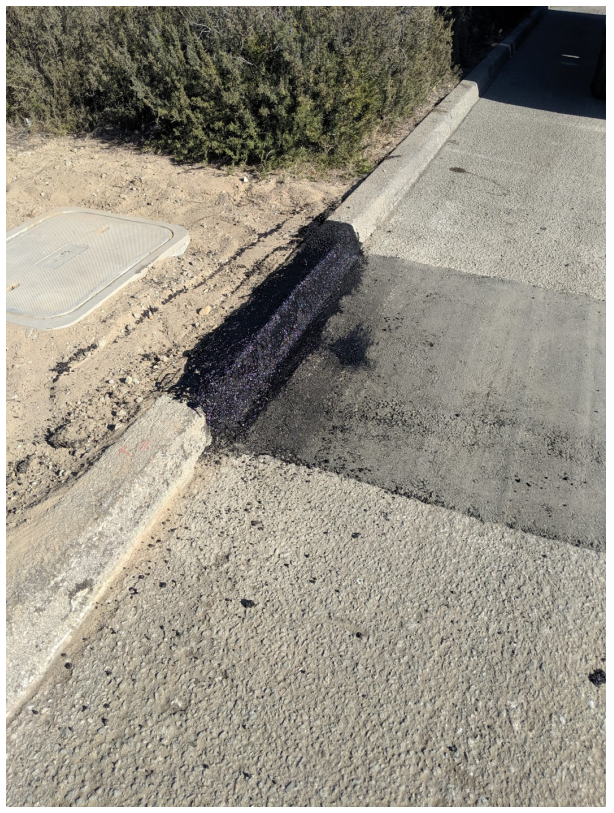
Dike was replaced in front of thr blow valve on Lightfighter