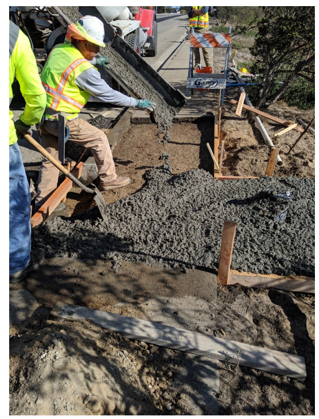
Concrete pouring for sidewalk and air valve by Lightfighter and 2nd.