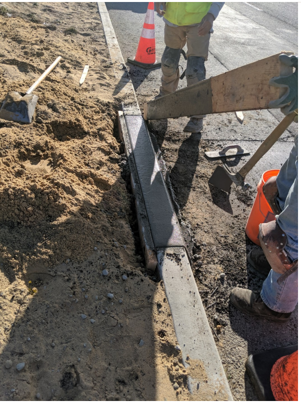
Curb replaced on GJM