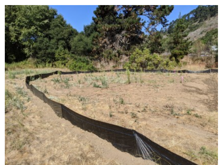
09/18/2020 - Completed silt fencing surrounding staging area and access route.