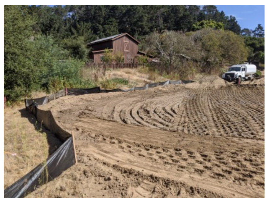
09/18/2020 - Completed silt fencing surrounding staging area and access route.