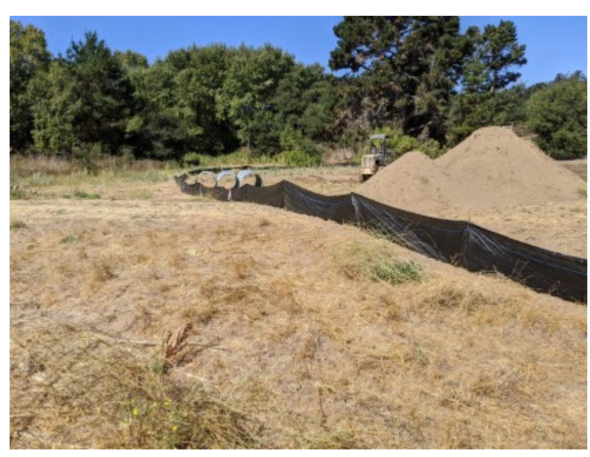
09/18/2020 - Completed silt fencing surrounding staging area and access route.