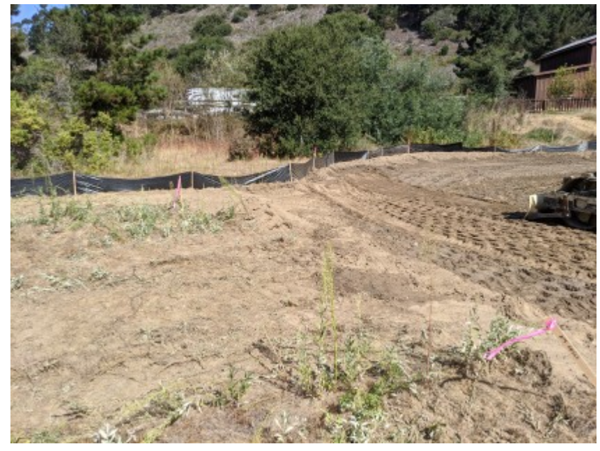
09/18/2020 - Completed silt fencing surrounding staging area and access route.