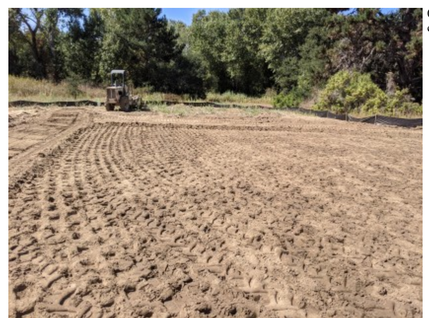
09/18/2020 - Graded and compacted area within construction site.