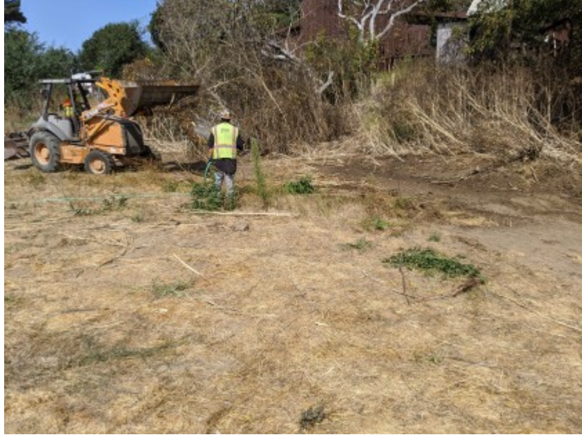
09/16/2020 - Initial vegetation clearing within limits of grading.