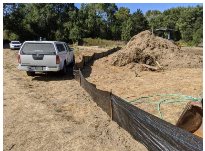
09/18/2020 - Completed silt fencing surrounding staging area and access route.