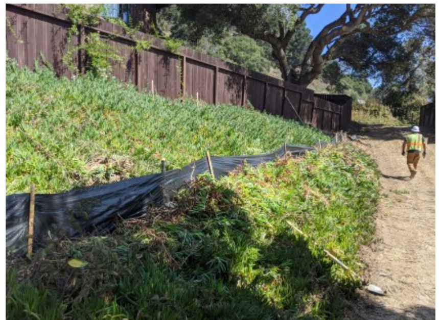
09/18/2020 - Completed silt fencing surrounding staging area and access route.