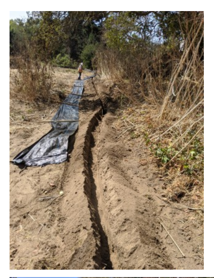
09/16/2020 - Trench and silt fencing installation surrounding construction area.