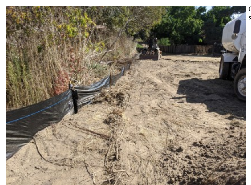
09/18/2020 - Completed silt fencing surrounding staging area and access route.