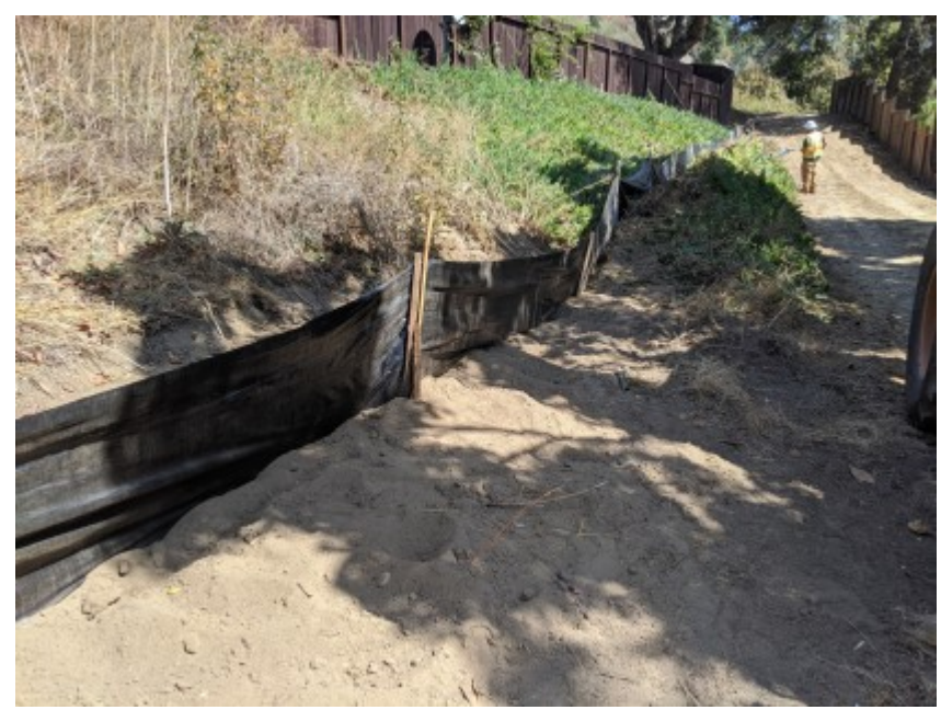
09/18/2020 - Completed silt fencing surrounding staging area and access route.