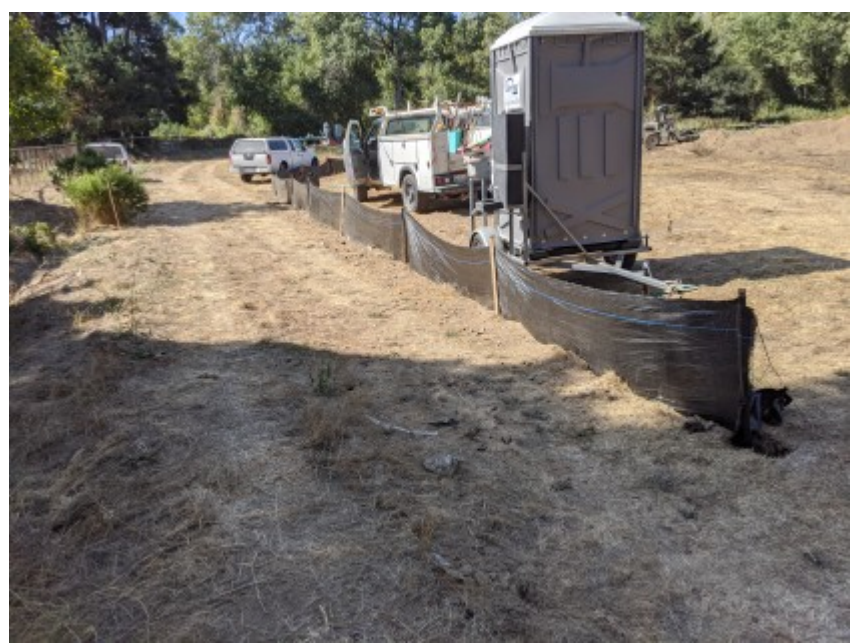
09/18/2020 - Completed silt fencing surrounding staging area and access route.