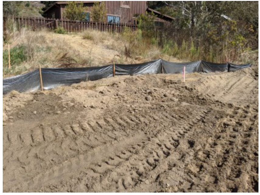
09/18/2020 - Completed silt fencing surrounding staging area and access route.