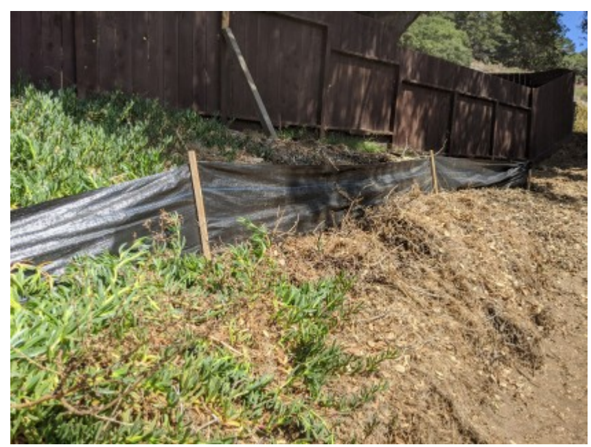
09/18/2020 - Completed silt fencing surrounding staging area and access route.