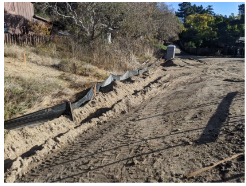
11/16/2020 - Soil building up against silt fencing in need of removal