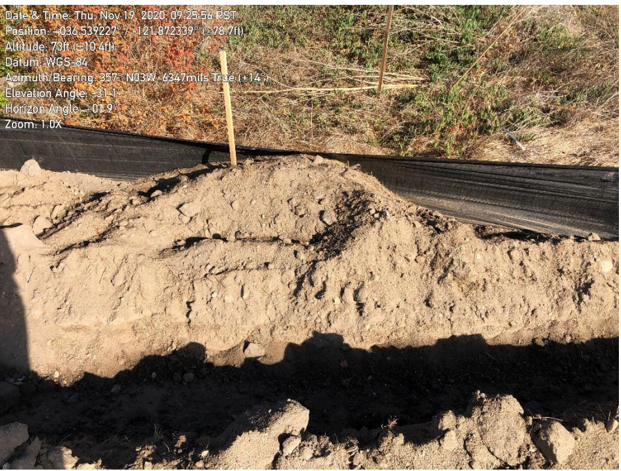
Photo 1. Carmel Valley Pump Station: small section of silt fence compromised.

550 Kearny Street Suite 800 San Francisco, CA 94108 415.896.5900 main phone