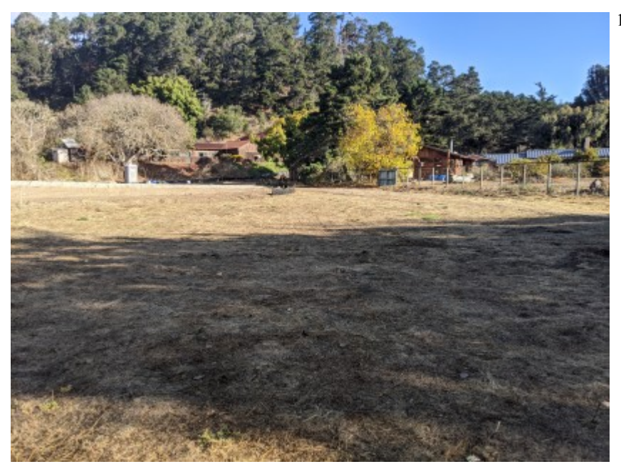
11/19/2020 - Site conditions