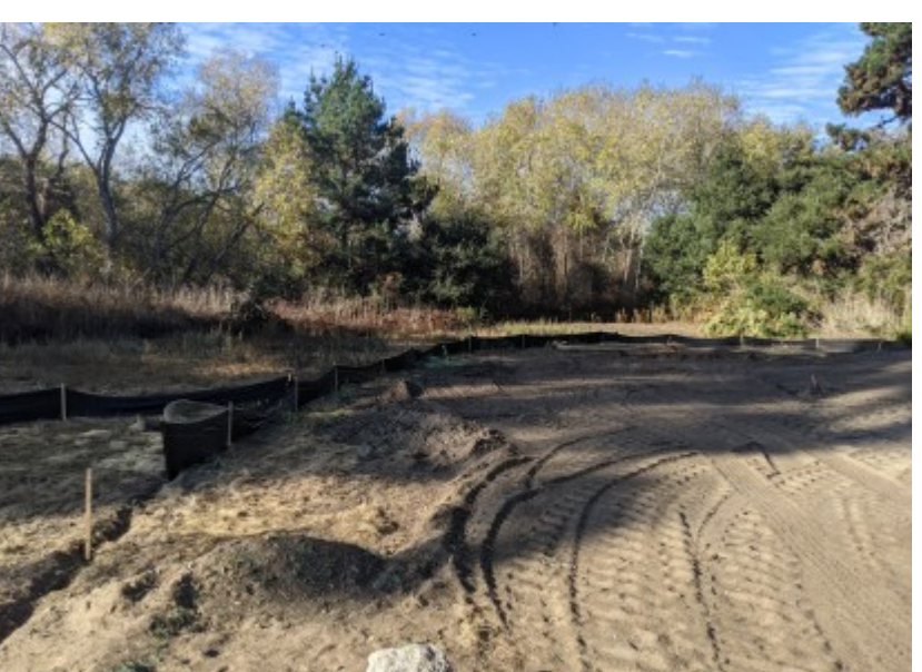
11/19/2020 - Intact silt fencing surrounding construction area