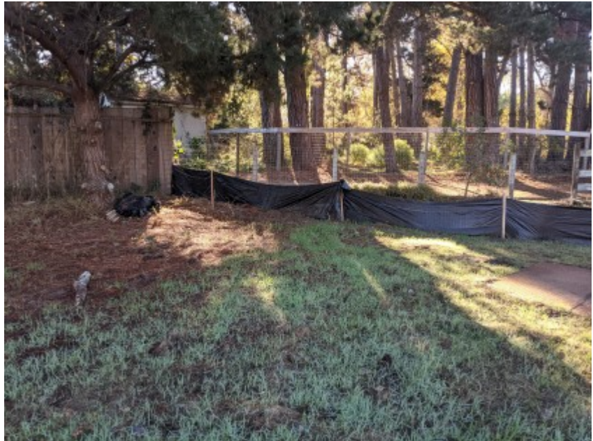
12/29/2020 - Intact exclusionary fencing surrounding work area.