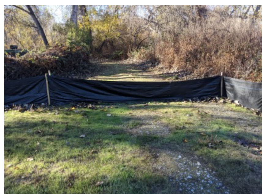
12/29/2020\mbox{ -} Intact exclusionary fencing surrounding work area.