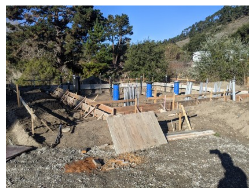
12/29/2020 - Site conditions.