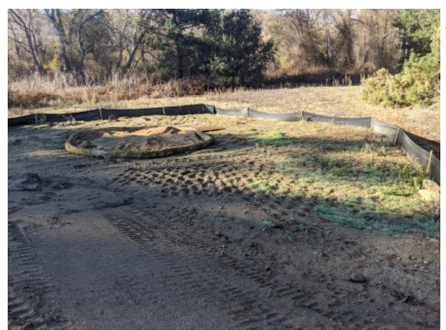
12/29/2020 - Intact exclusionary fencing surrounding work area.