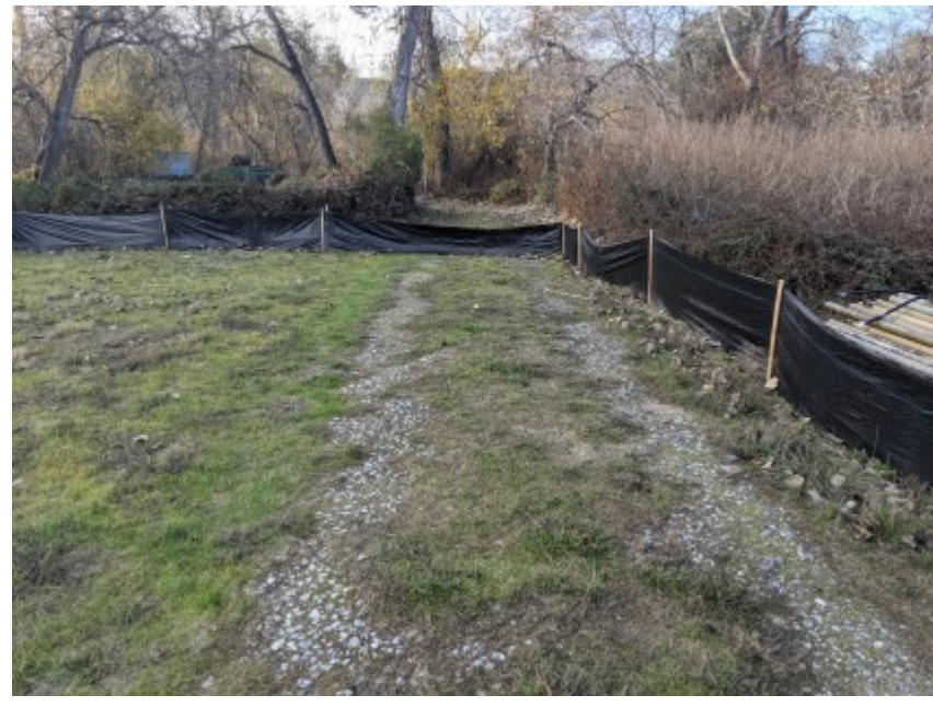
01/07/2021 - Intact exclusionary fencing surrounding work area.