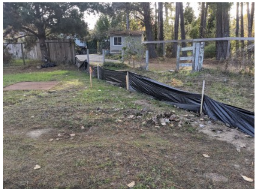
01/07/2021 - Intact exclusionary fencing surrounding work area.