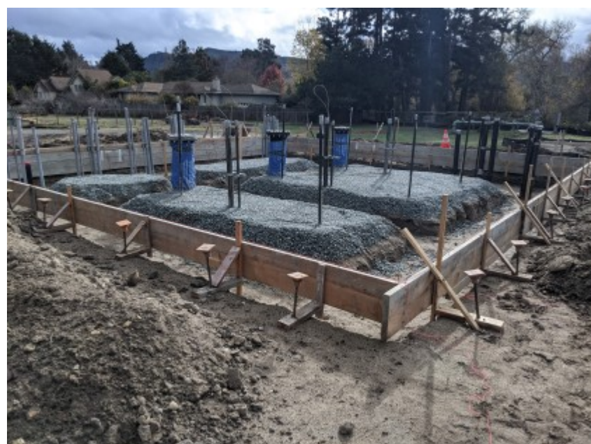
01/07/2021 - Site conditions.