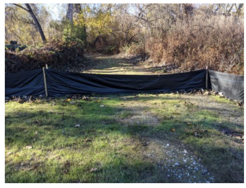
01/04/2021 - Intact exclusionary fencing surrounding work area.