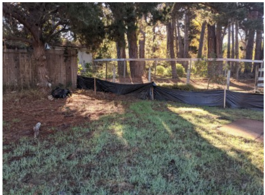
01/04/2021 - Intact exclusionary fencing surrounding work area.