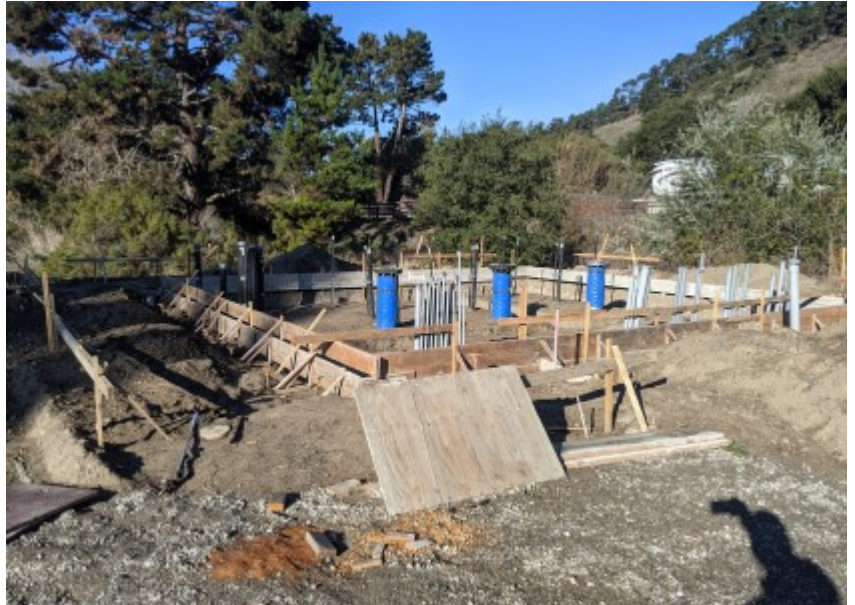
01/04/2021 - Site conditions.