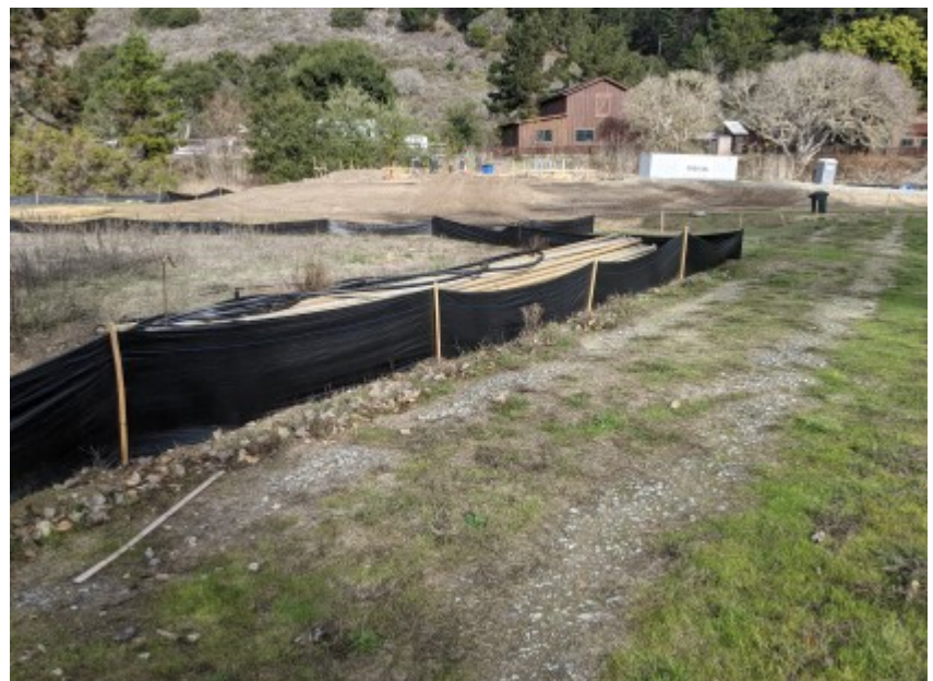
01/\!07/\!2021 - Intact exclusionary fencing surrounding work area.