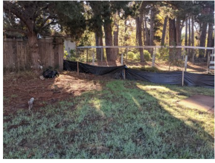
01/04/2021 - Intact exclusionary fencing surrounding work area.