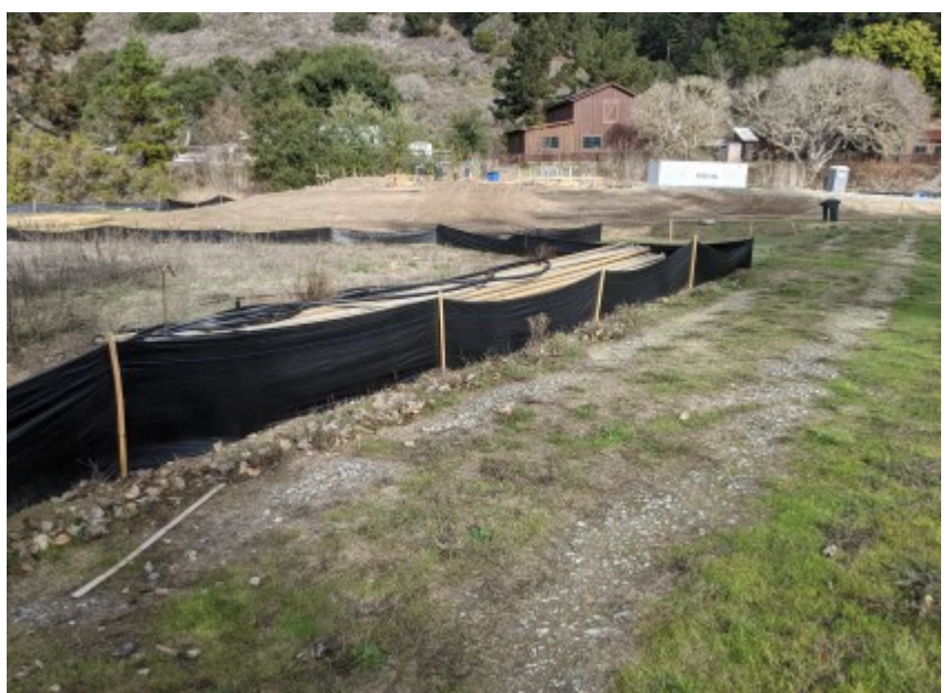
01/04/2021 - Intact exclusionary fencing surrounding work area.