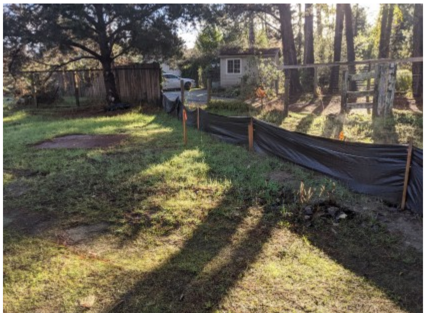
01/29/2021 - Intact exclusionary fencing surrounding work area.