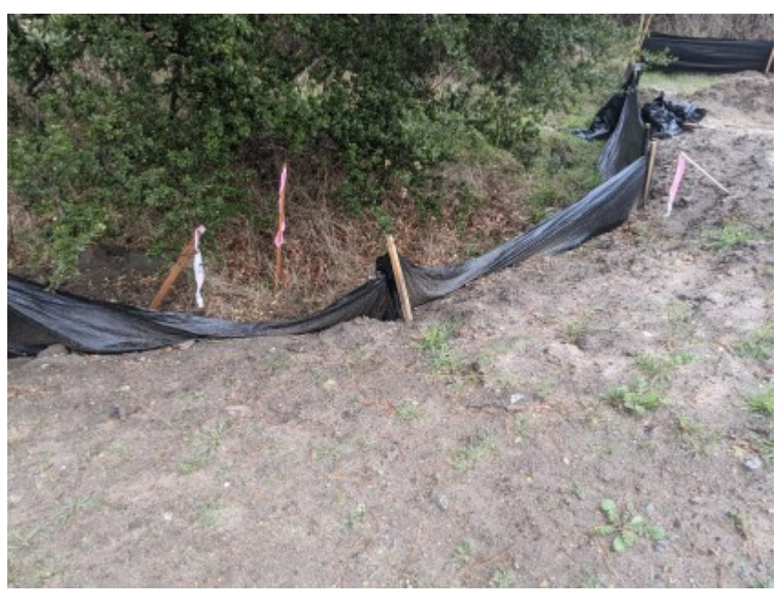
01/27/2021\mbox{ -} Erosion within work area damaging exclusionary fencing.