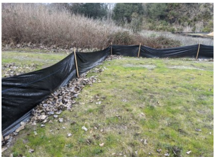
01/25/2021 - Intact exclusionary fencing surrounding work area.