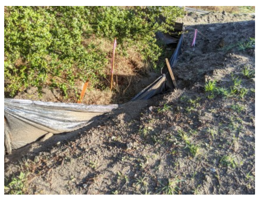
01/29/2021 - Erosion within work area damaging exclusionary fencing.