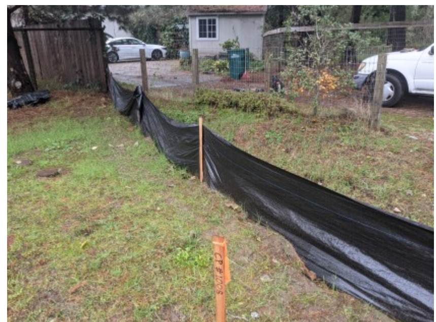
01/27/2021 - Intact exclusionary fencing surrounding work area.