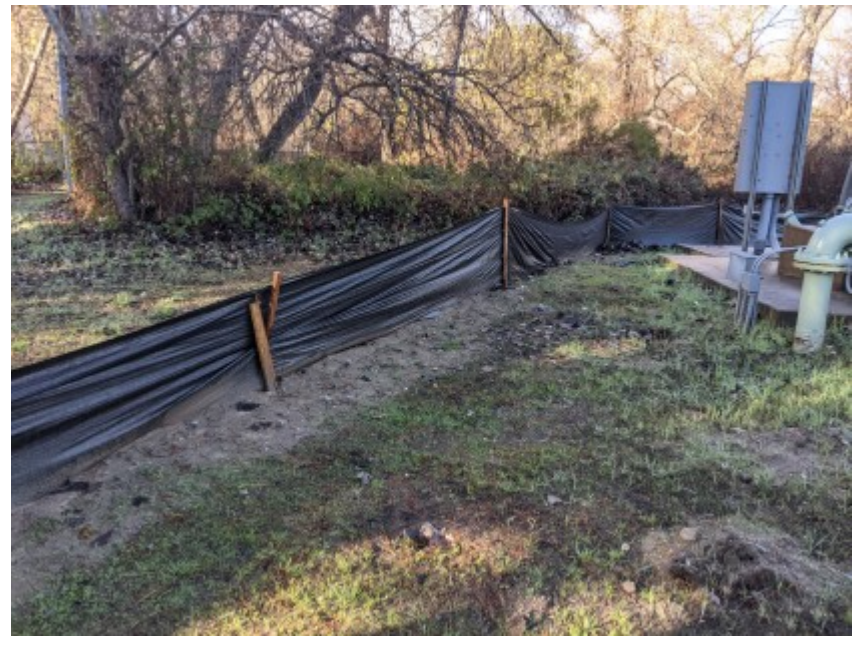
01/29/2021 - Intact exclusionary fencing surrounding work area.