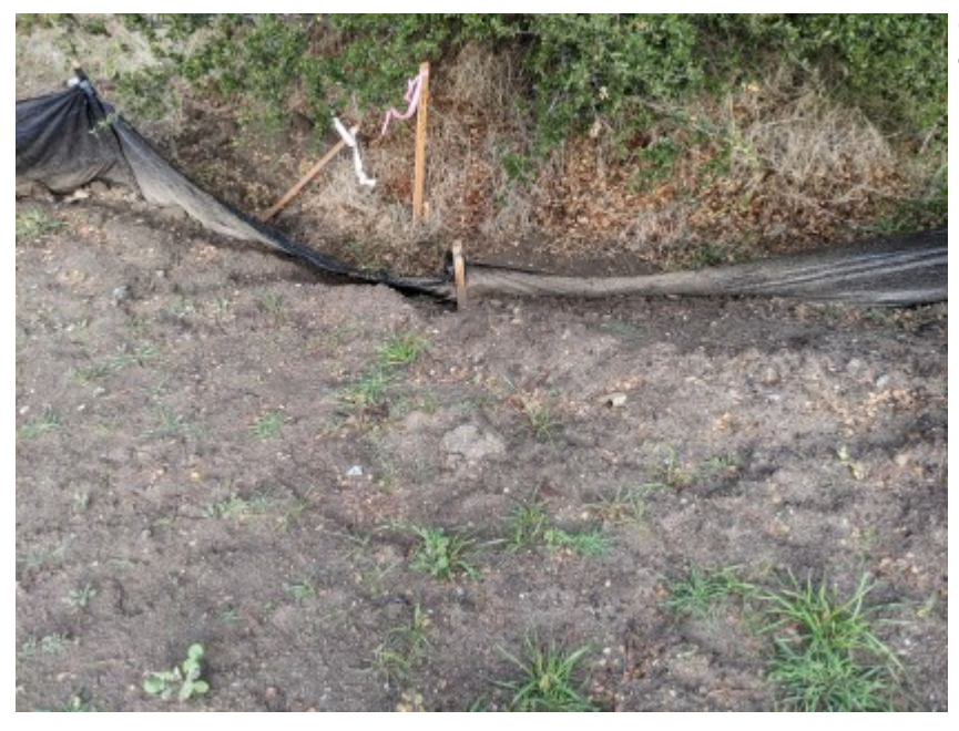
01/25/2021\mbox{ -} Erosion within work area beginning to damage exclusionary fencing.