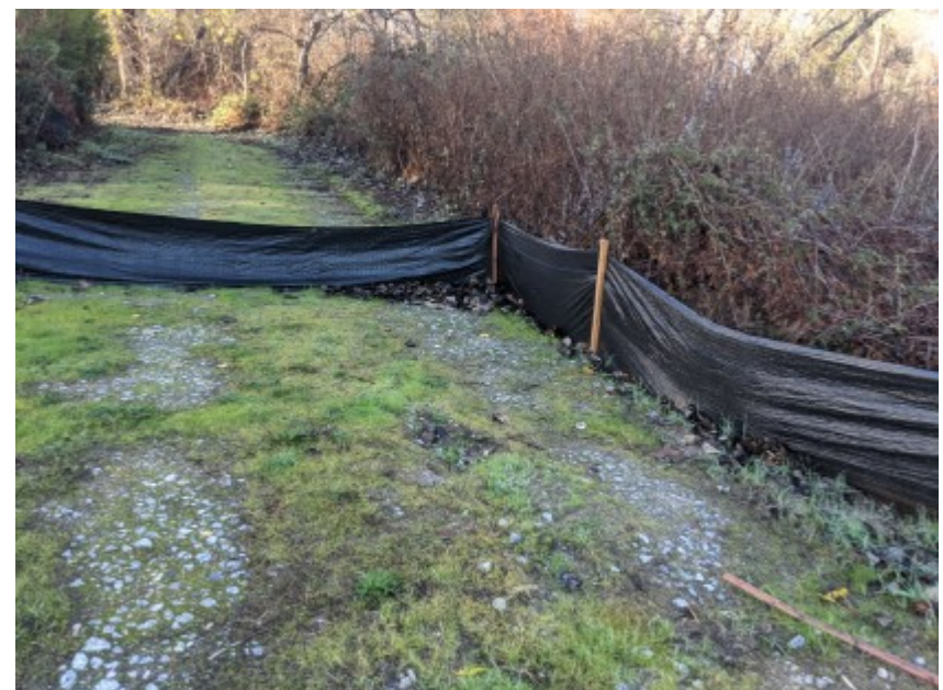
01/29/2021 - Intact exclusionary fencing surrounding work area.