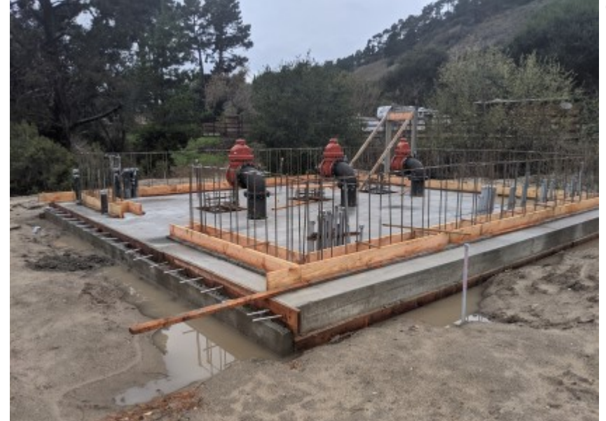
01/27/2021 - Site conditions.