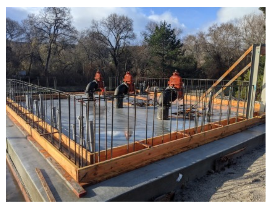
01/29/2021 - Site conditions.