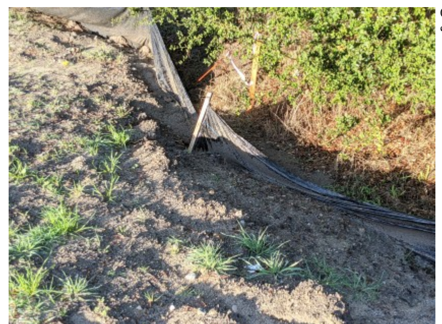
01/29/2021 - Erosion within work area damaging exclusionary fencing.