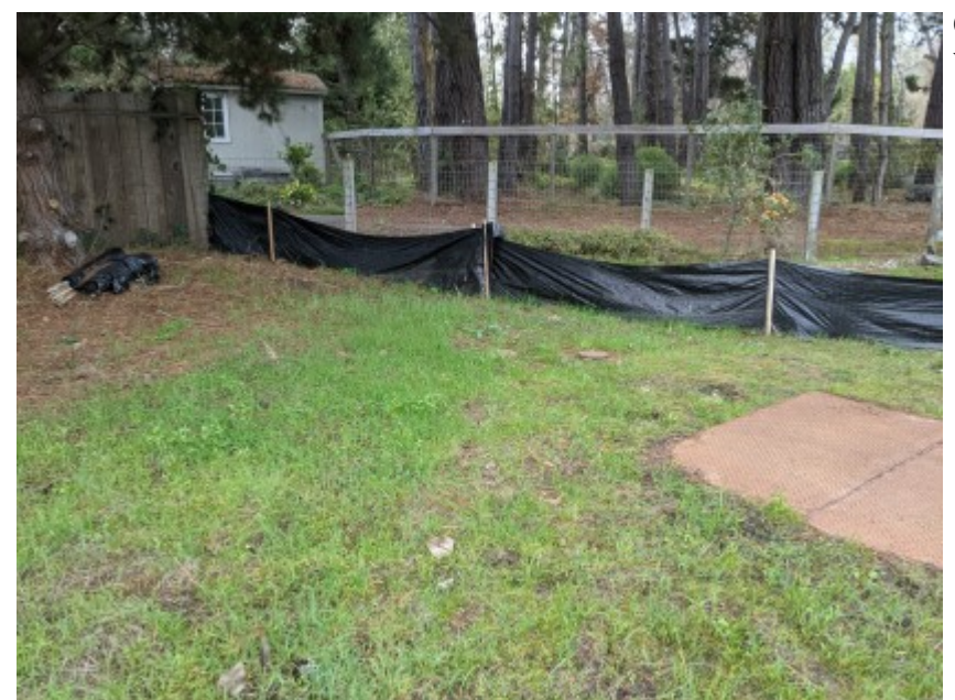
01/25/2021 - Intact exclusionary fencing surrounding work area.