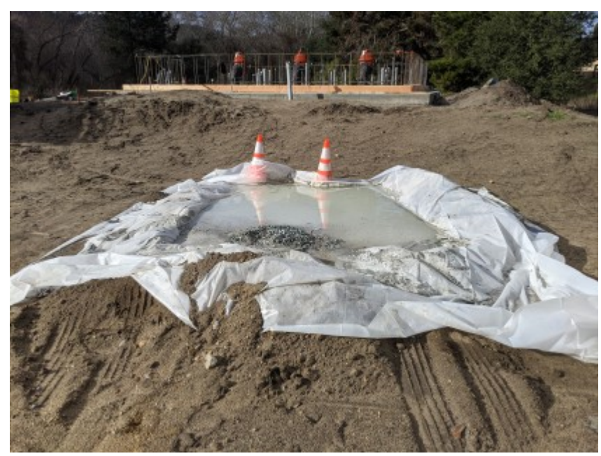
01/25/2021 - Concrete washout containment within work area.