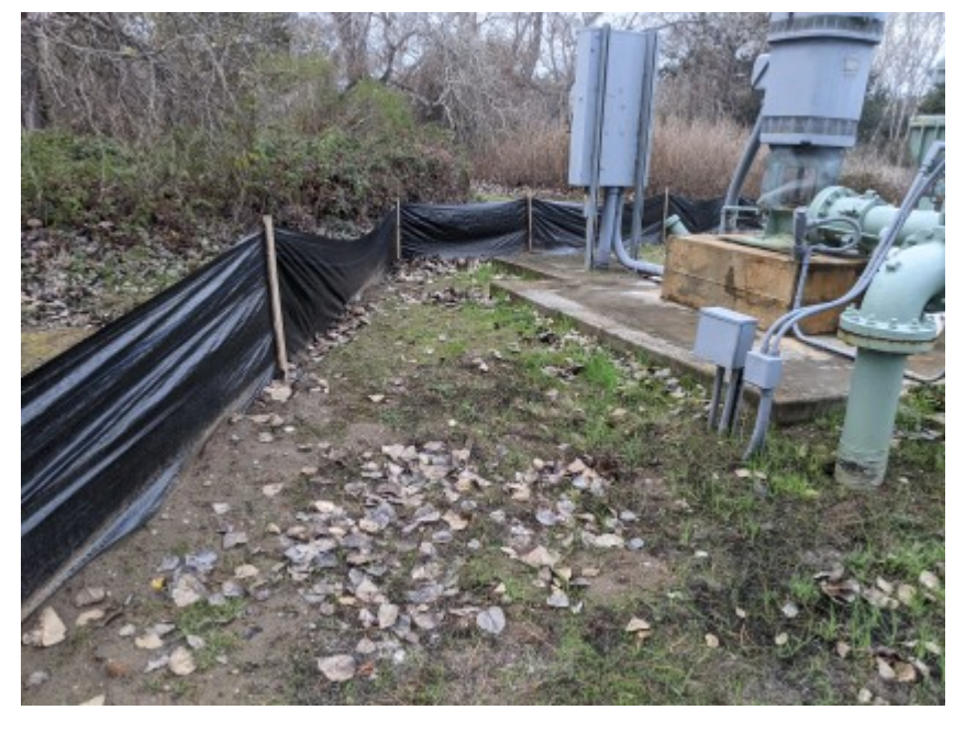
01/25/2021 - Intact exclusionary fencing surrounding work area.