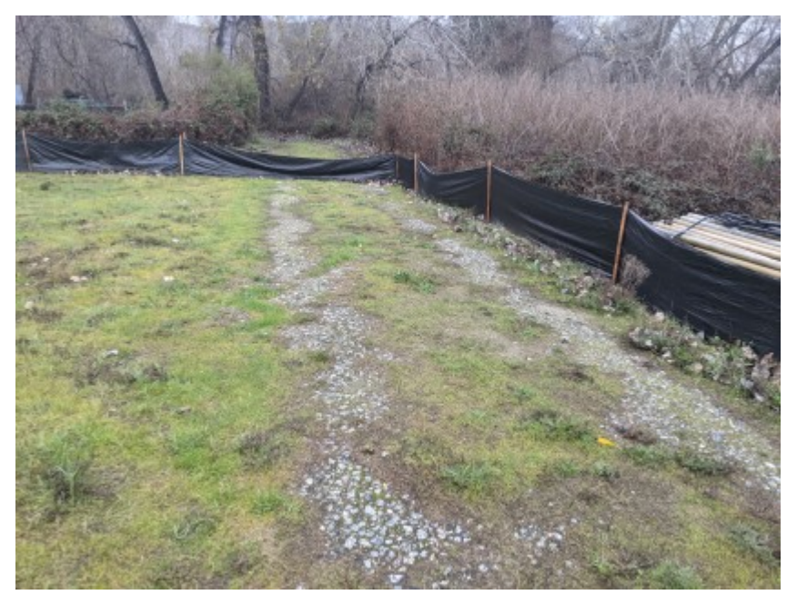
01/27/2021\mbox{ -} Intact exclusionary fencing surrounding work area.