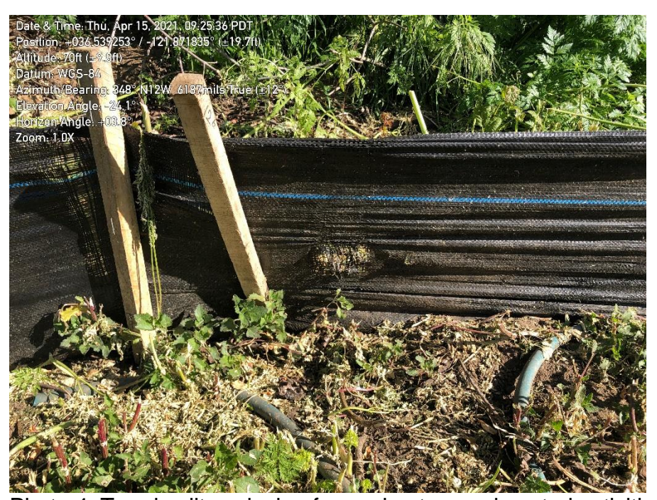
Photo 4. Tear in silt exclusion fence due to weed control activities.