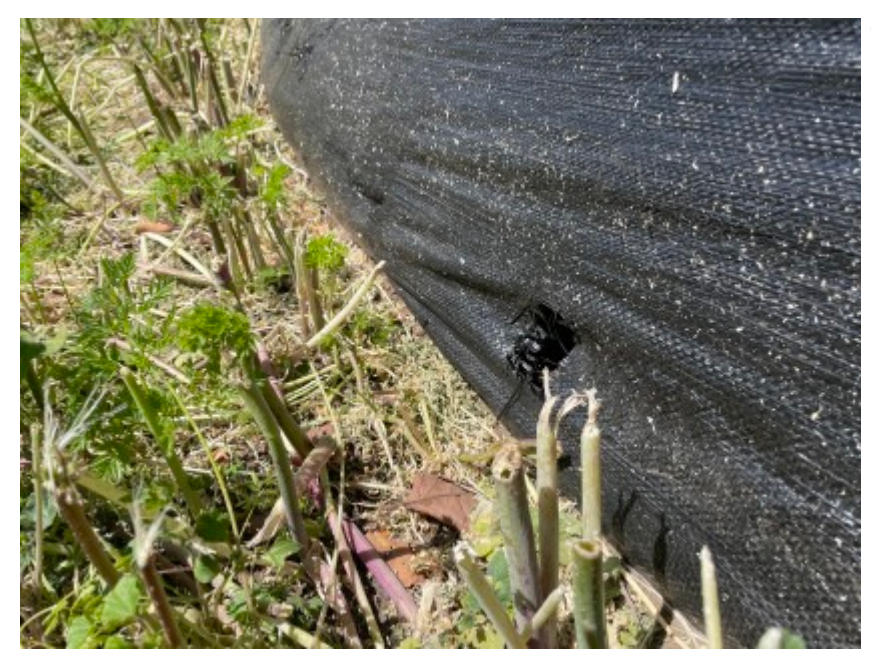
04/16/2021 - Holes caused by vegetation removal are still in silt fence, need to be fixed.