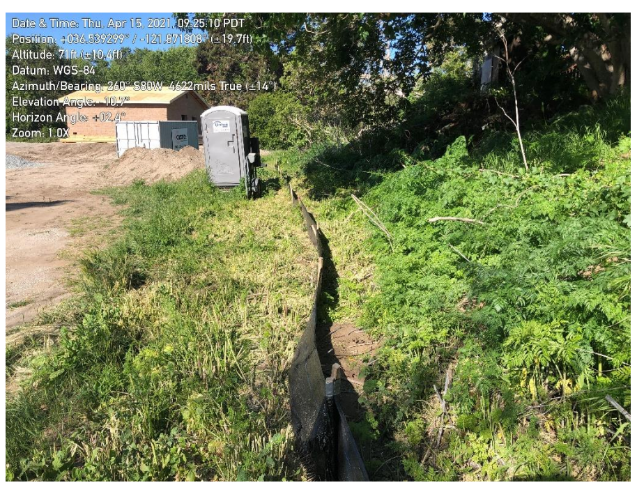
Photo 5. Hemlock growing along north border of site has been mowed.