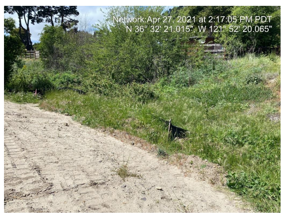
Photo 1. A portion of the fence where invasive weeds need to be removed.

550 Kearny Street Suite 800 San Francisco, CA 94108 415.896.5900 main phone