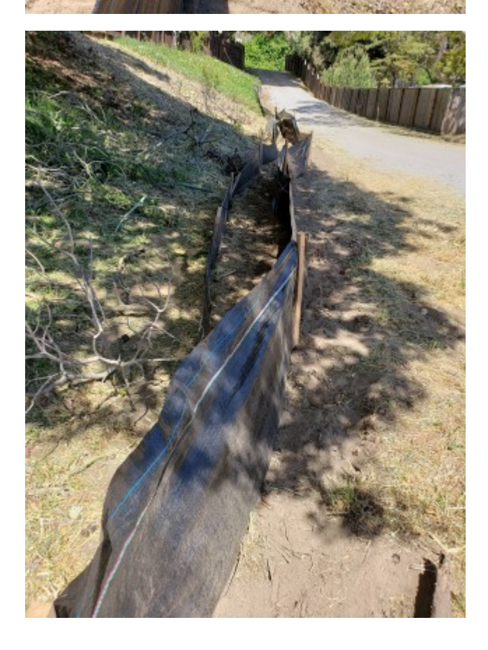
05/13/2021 - Repaired exclusion fencing.