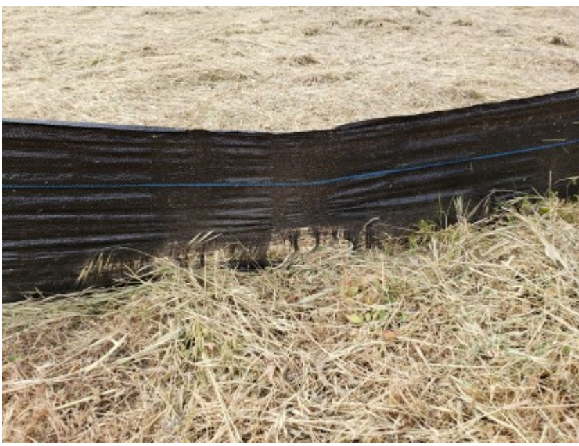
05/13/2021 - Exclusion fencing to be repaired.

05/13/2021 - Exclusion fence to be repaired.