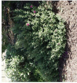
CISTUS 'SUNSET GOLD' Rockrose

INSTALLATION: 1'-2' HT. / 1'-2' W. SIZE AT 5-10 YEARS: 3'-4' HT./ 6'-8' W. MATURITY: 3'-4' HT. / 6'-8' W.