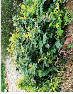
RIBES VIBURNIFOLIUM Catalina Perfume

INSTALLATION: 1'-2' HT. / 1'-2' W. SIZE AT 5-10 YEARS: 4' HT./ 6'-8' W. MATURITY: 3'-4' HT. / 8'+ W.