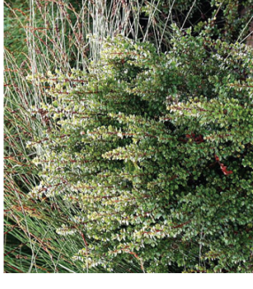
MYRSINE AFRICANA African Boxwood

INSTALLATION: 1'-2' HT. / 1'-2' W. SIZE AT 5-10 YEARS: 4' HT./ 6'-8' W. MATURITY: 3'-4' HT. / 8'+ W.