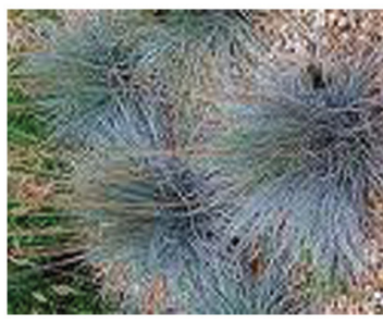
FESTUCA CINEREA' Blue Fescue

INSTALLATION: 1'-2' HT. / 1'-2' W. SIZE AT 5-10 YEARS: 3'-4' HT./ 6'-8' W. MATURITY: 3'-4' HT. / 6'-8' W.