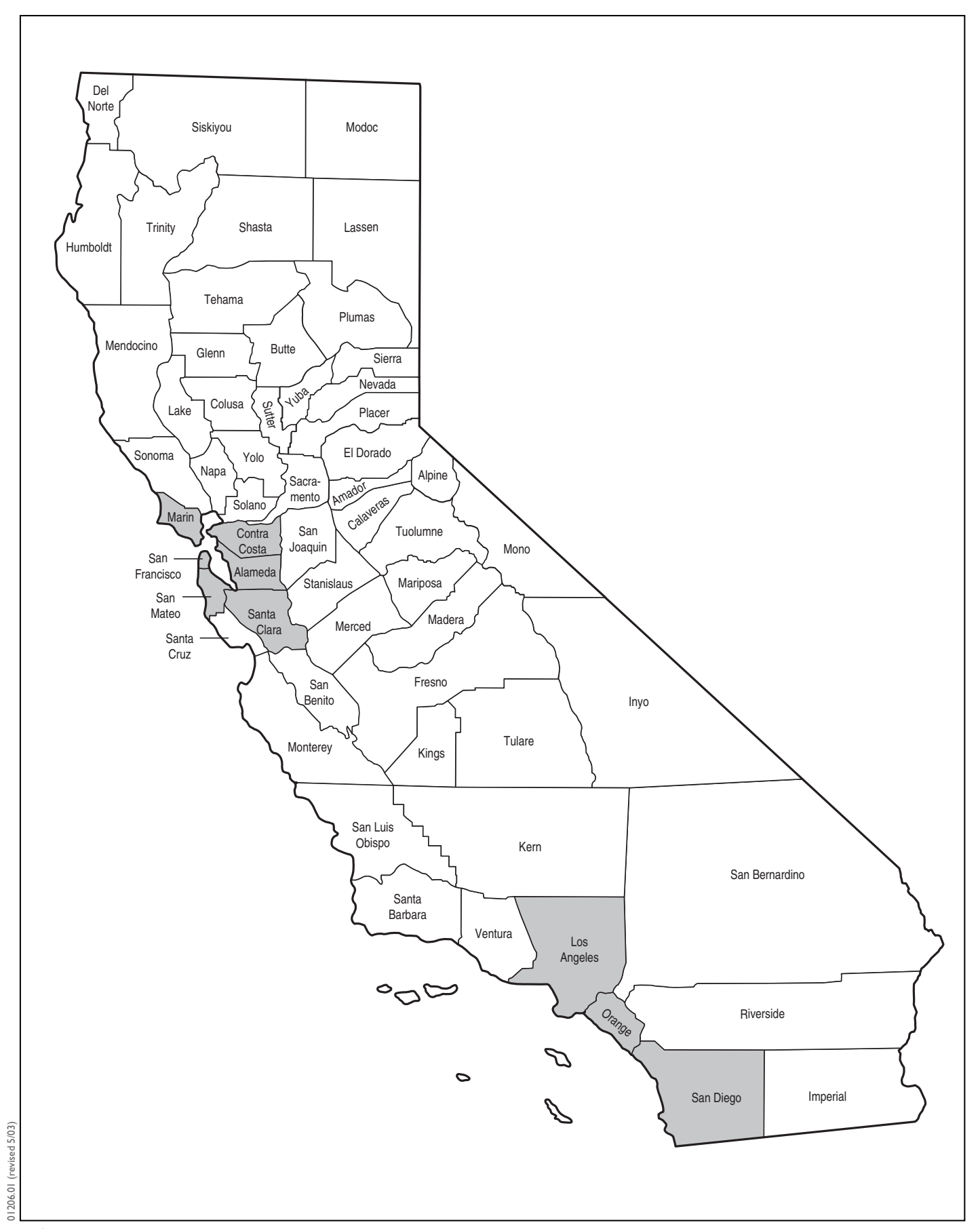
Jones & Stokes