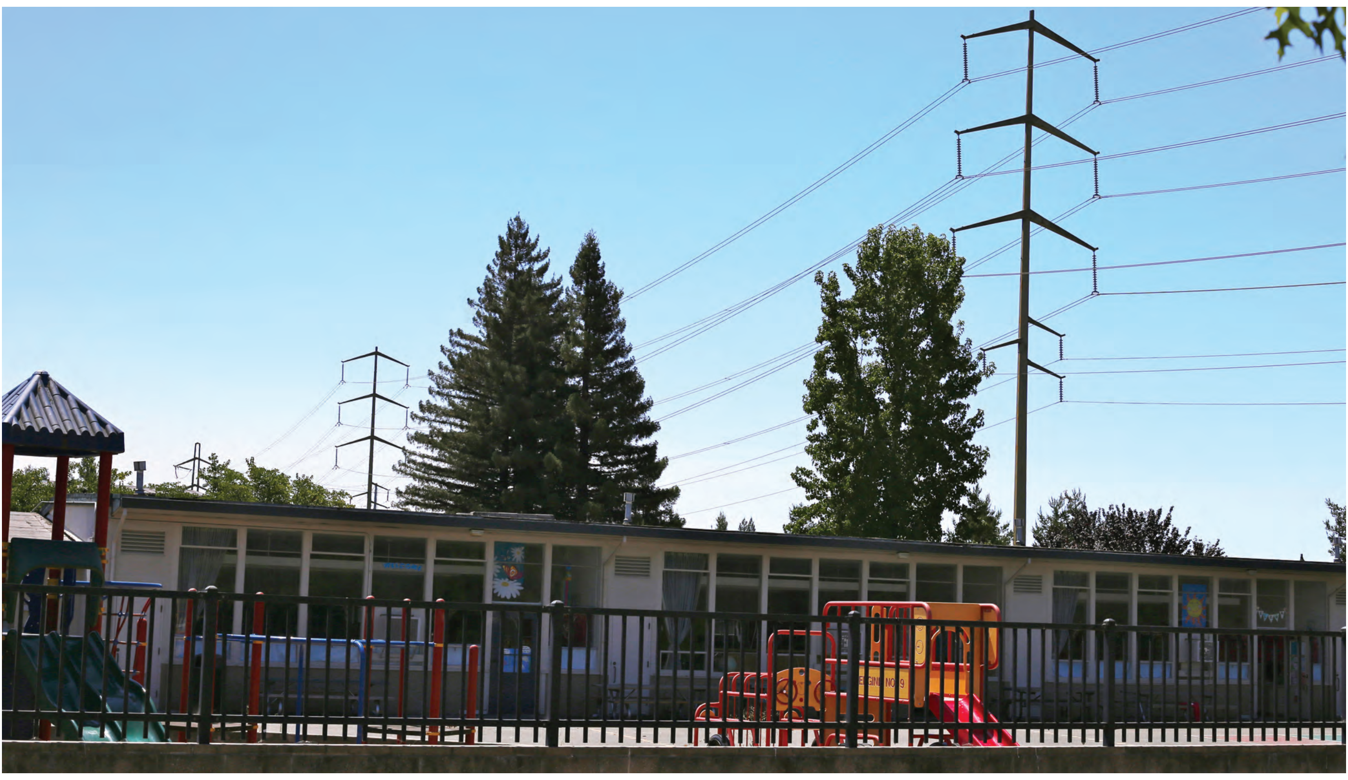
Figure 3.1-3 KOP #1 Existing Conditions