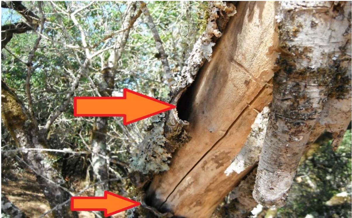
Photo 10 Potential bat crevice under exfoliating bark.