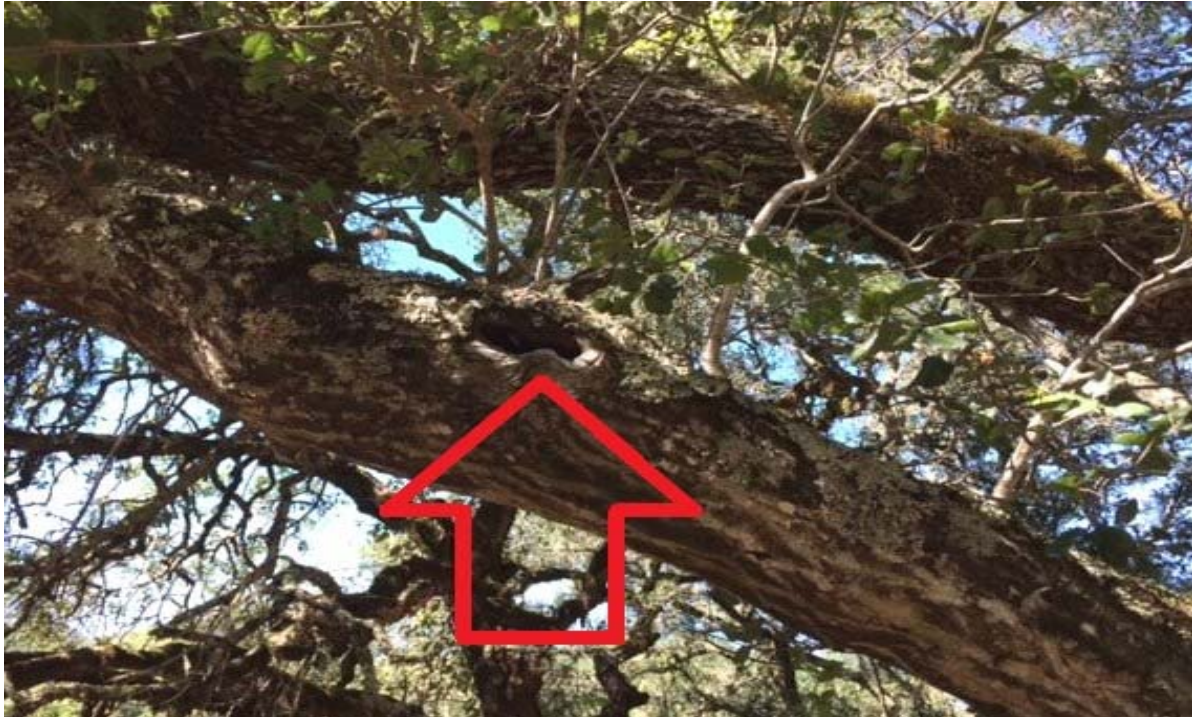
Photo 4: Cavity in tree branch that could provide bat roosting habitat.