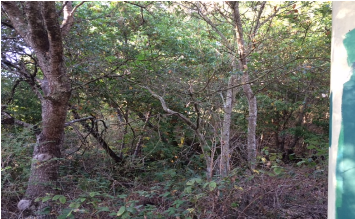
Photo 2: View north from Pole 23. Note closed canopy and dense understory lacking flyway space.