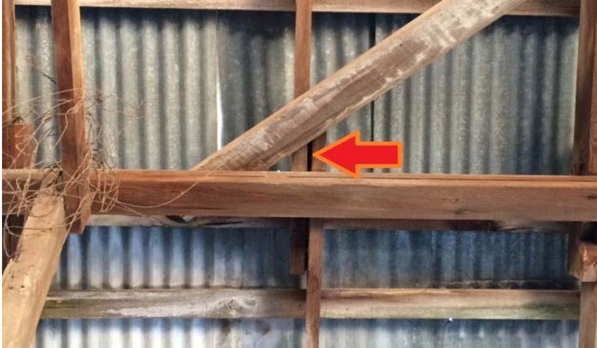
Photo 1: Potential roost crevice in unoccupied barn; no bat sign observed.